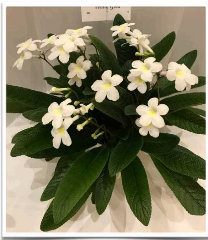
Streptocarpus 'Heartland's White Gold' Adrienne Rieck