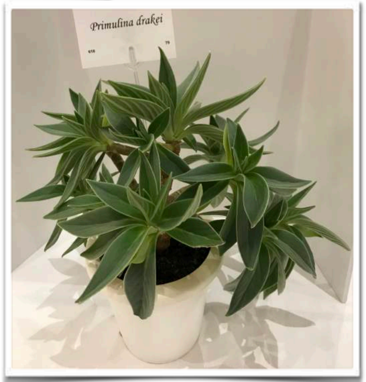
Primulina drakei