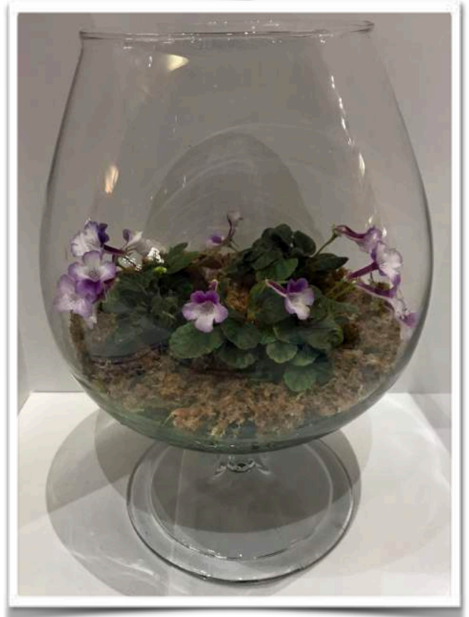
Sinningia 'Freckles' Sayeh Beheshti