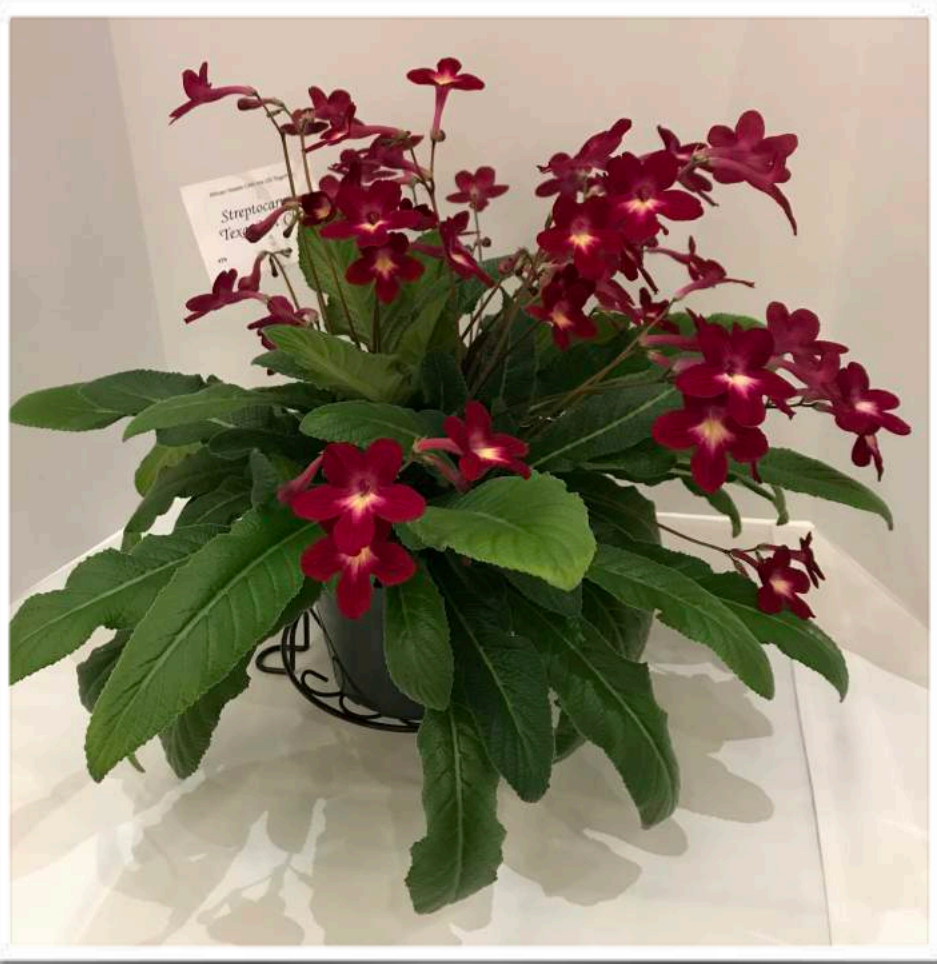
Streptocarpus 'Texas Hot Chili' BJ Ohme