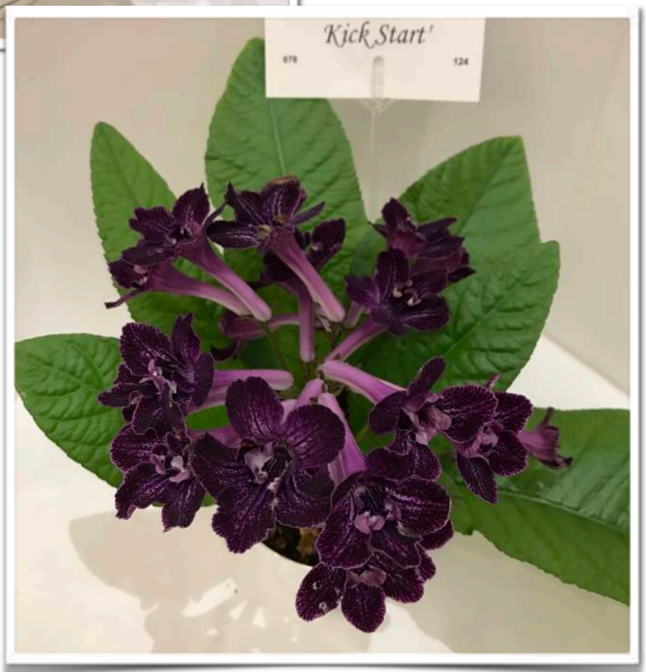
Streptocarpus 'Bristol's Kick Start' Violet Barn