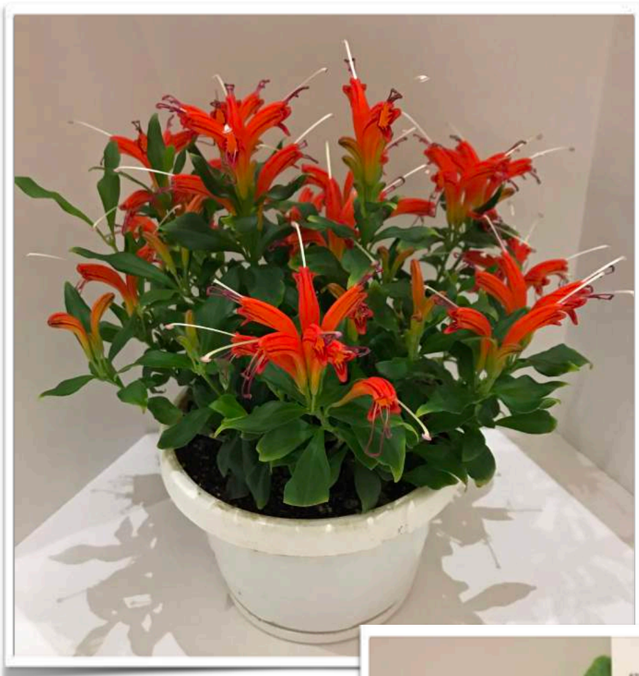
Aeschynanthus 'Mira' Violet Barn