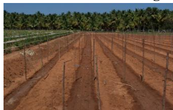
Fig 4: Field Preparation