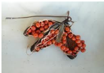
Fig 6: Matured pod with seeds