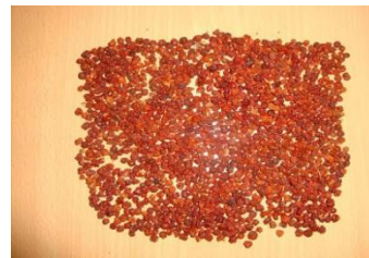
Fig 7: Dried Seeds