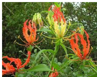
Fig 3: Ariel part of Gloriosa superb