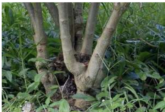
Bark of C. paniculatum