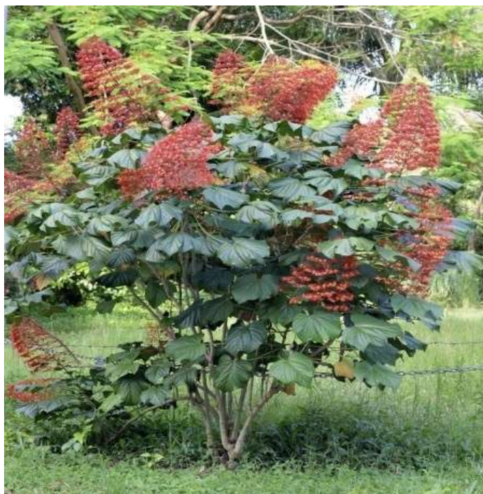
Whole plant of C. paniculatum