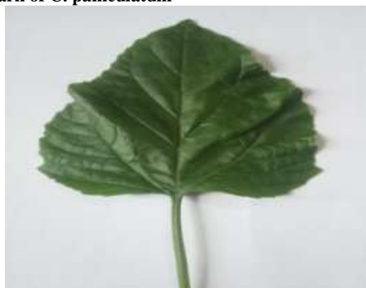
Leaf of C. paniculatum