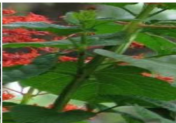
Stem, Branches and Branchlets of C. paniculatum