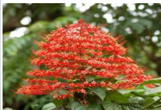
Inflorescence of C.paniculatum