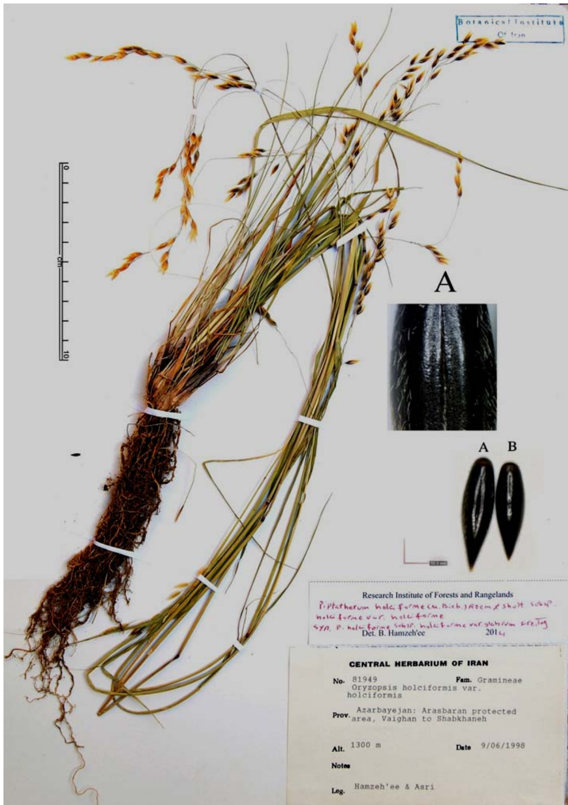
Fig. 3. Piptatherum holciforme subsp. holciforme var. holciforme . A, hairy lemma; B, glabrous lemma.