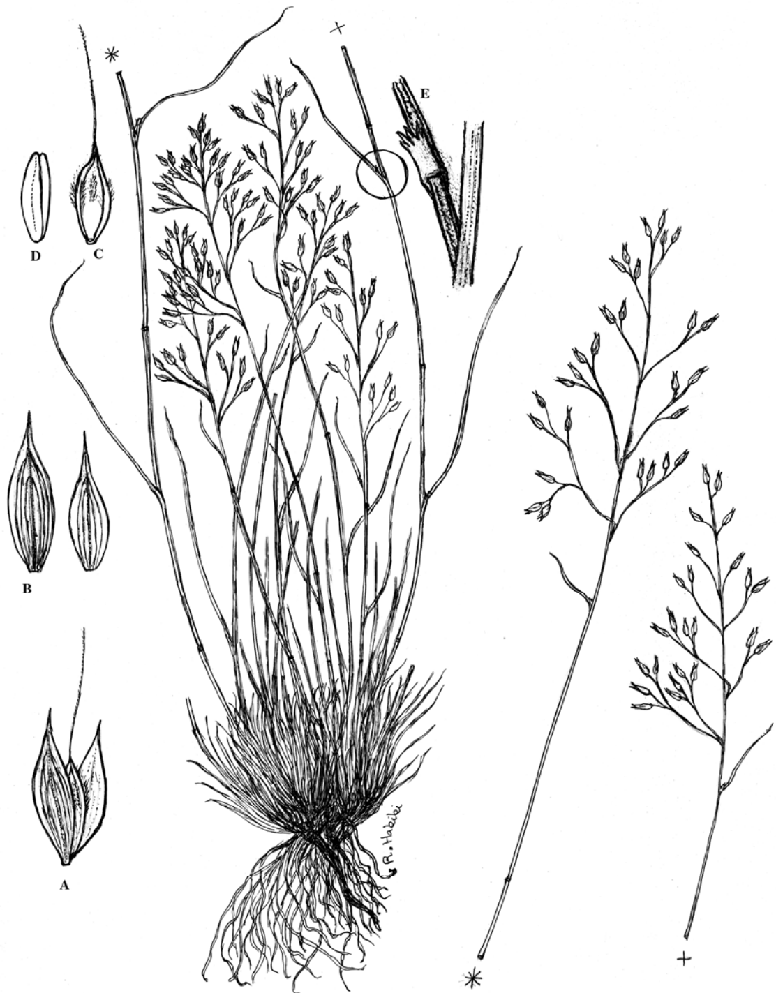
Fig. 1. Illustration of Piptatherum denaense (Assadi and Abouhamzeh 46117, TARI). A, spikelet; B, glumes; C, lemma; D, glabrous anther; E, ligule. Scales: A-C & E=X7; D=X12.