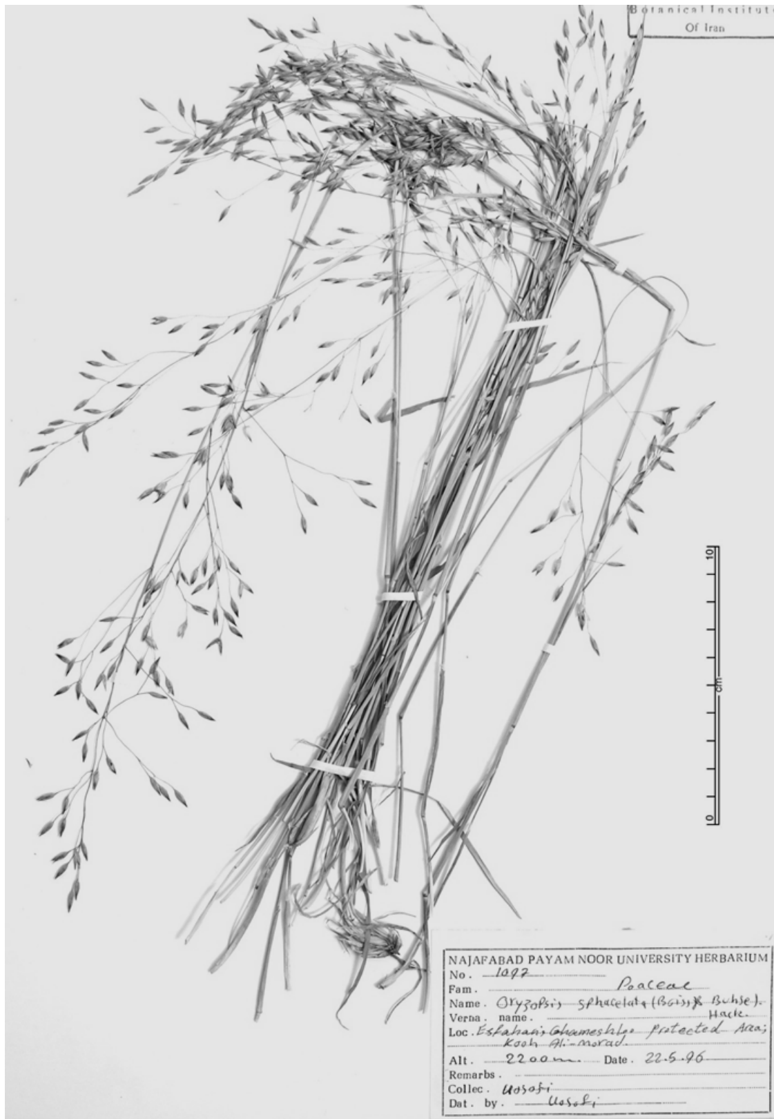
Fig. 5. Piptatherum sphacelatum with lax panicle.