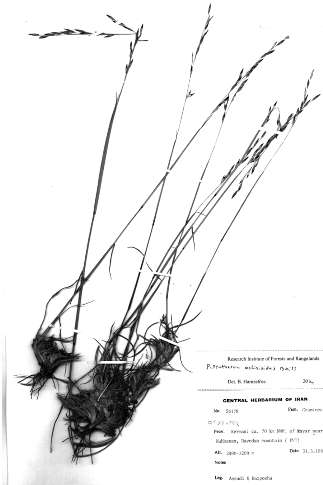
Fig. 4. Piptatherum molinioides with closed panicle.