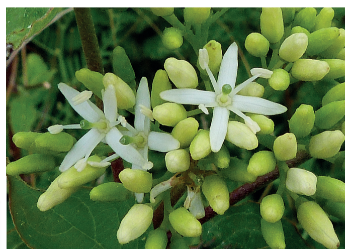
Flowers have 4 creamy white petals and 4 stamens and are arranged in flat-topped inflorescences.

Field data in Europe (including absences) ● Observed presences in Europe ●