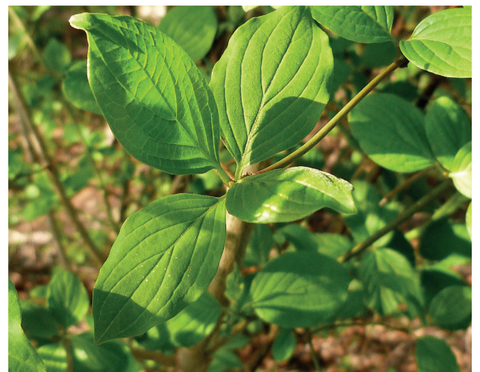
Leaves are 4-10 cm pale green, turning reddish in autumn.

This shrub is principally cultivated as an ornamental species for its small white flowers arranged in dense clusters blossoming in spring, its purplish red autumn leaves, and its bright-red winter twigs 3, 6-8 . Different cultivars have been selected, such as 'Midwinter Fire' and 'Winter Flame', with winter stems yellow at the ground level changing to orange and red at the top, or 'Compressa' developing as dwarf form 16, 17 . It can be used in shelter-belts against wind and is frequently planted in the understory 18 . Like other dogwood species, the wood is tough, hard and elastic. It is difficult to work and needs to be dried slowly to avoid cracks 19 . It is used only by craftsmen for making small objects, such as tool handles. The flexible twigs can be used as wickers for basket making or for fishing nets 4, 5, 20-23 . The fruits are not toxic and have high concentration of vitamin C; however they have an unpleasant taste. They can be used for producing jams and juices 1 . Its seeds contain 30% fats and can be used to make soap, or for oil in gas lamps 3-5 . Recent research on the antioxidant activity of leaf and fruit extracts have found an important use in areas of medical botany and pharmacology against multi-drug resistant human pathogens 24, 25 . This species