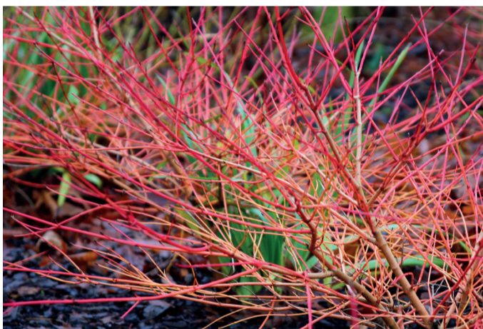
Ornamental plant with bright coloured winter stems.

This species is present in most of Europe and the Caucasian region, including the northern part of Iran. It is absent from Scandinavia (except in the southernmost part), from the north-eastern part of the British Islands, southern half of the Iberian Peninsula, and southern Greece 2-5, 8 . It grows from sea level to over 1500 m in the Alps (Switzerland) and Caucasus Mountains 9 .