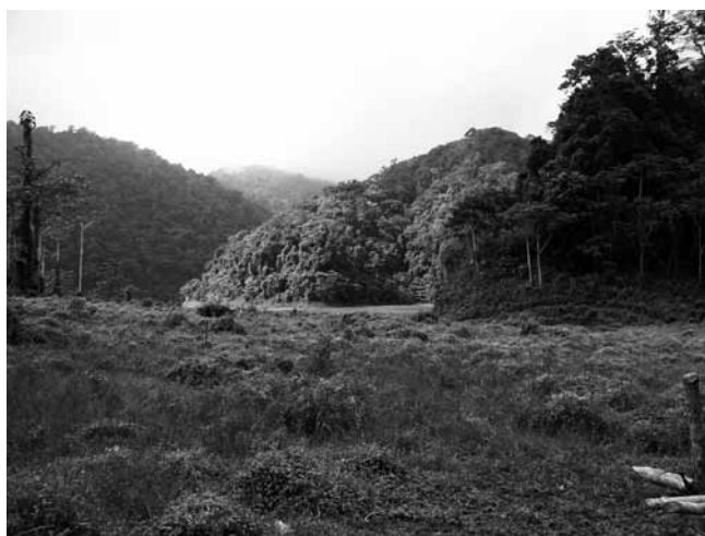
Figure 7. - Type locality of Melanotaenia parva on 15 June 2007 with an overview of the vanishing Kurumoi Lake in Bintuni Regency.