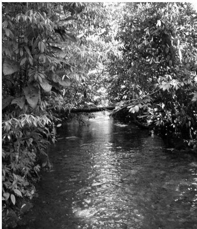
Figure 6. - Type locality of Melanotaenia fasinensis , Fasin River near Ween village, Sorong Selatan.