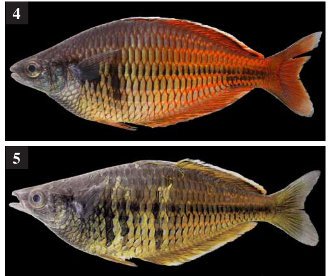
Figure 2. - Melanotaenia fasinensis , MZB 17700 (holotype), male, 108.6 mm SL, Bird's Head Peninsula, West Papua, Indonesia.