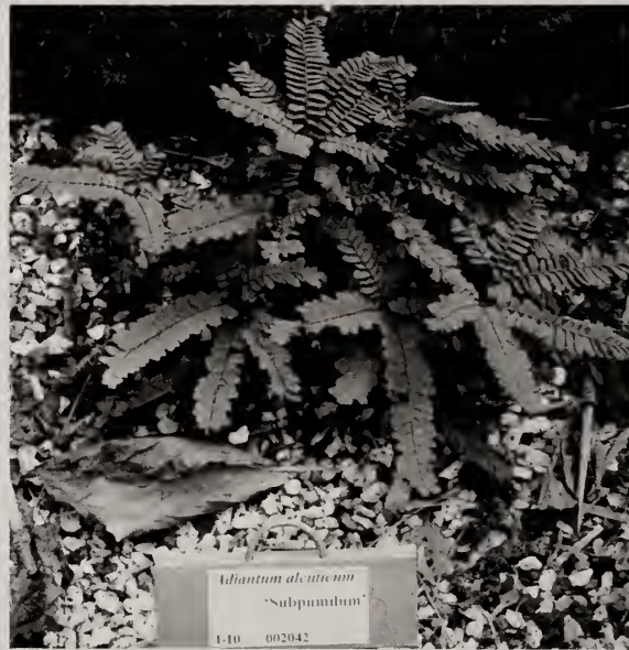
Adiantum aleuticum 'Subpumilum'

'Cruciatum' [1 ('05)]; 'Dre's Dagger' [1 ('04)];