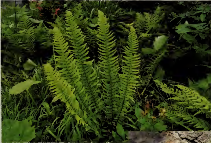
Polystichum x illyricum