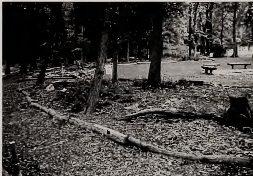
Creasey Mahan Woods - August, 2011

A hoop house and raised plant beds were constructed. A number of plants including a group of Cyrtomium species were grown to maturity and most have been moved to the garden. The planned use is to propagate additional plants over the next few years. The completed woodland garden will cover about one and a half acres. The remainder will be planted with small trees and wild flowers preferring sun. When the trees mature, it will be planted with woodland plants. In the remaining, unplanted woodland area, we plan to use a variety of native wildflowers along with locally native ferns. This area will feature mass plantings of such plants as foam flower, bloodroot, trillium and Virginia bluebells along with masses of ferns.