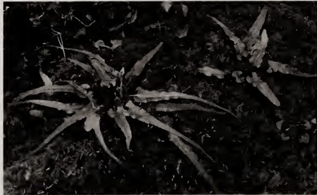
Camptosorus rhizophyllus