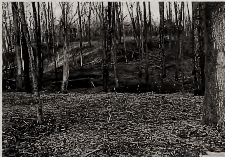
Creasey Mahan Woods - March 4, 2011

The major activity this past summer and early fall was the completion of a re-circulating water feature. It simulates a hillside spring feeding a stream lined with rock leading to a pond. Two bridges were installed across the stream. The rock areas along the stream