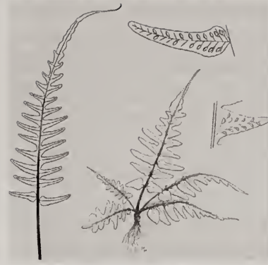
Asplenium tutwilerae

This is a first rate field guide. An emphasis on plain English is notably successful.