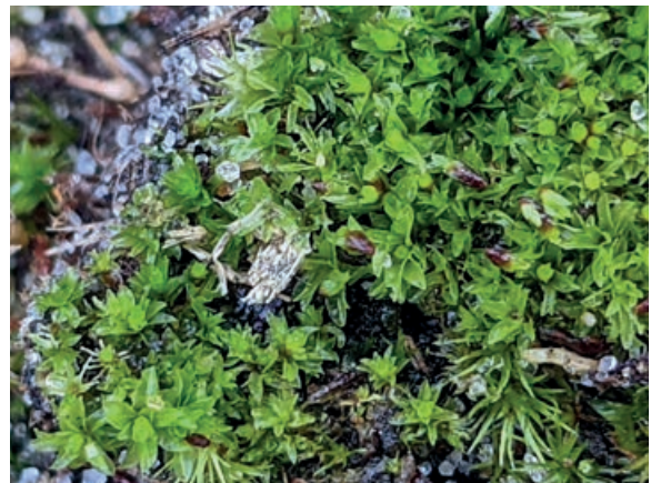
Leptodontium flexifolium, Shortheath Pond.