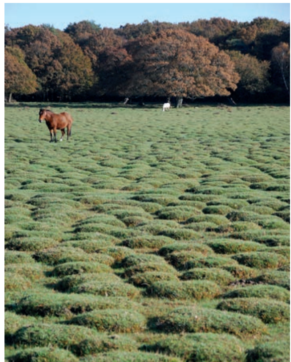
Balmer Lawn 'moundscape', Brockenhurst.