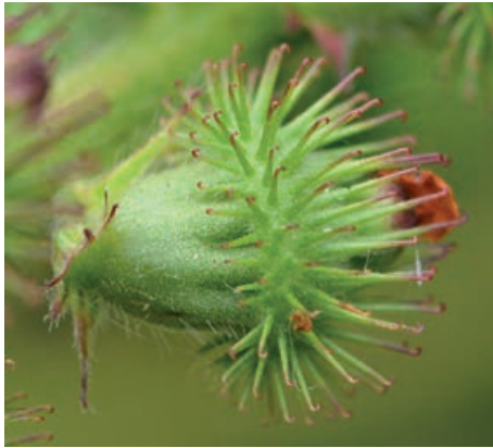
Fragrant Agrimony Agrimonia procera , Mill Field, Basing. Andrew Cleave

created by rabbits. N edge of arable headland, Tristan Norton 9 Sep 2022. Freefolk Wood, S of, SU5039 4391, two seedlings on arable field edge, growing about 20cms apart. Each has only a single stem with no flowers, Sue Bell 10 Sep 2022. Freefolk Wood, S of, SU5039 4392, two more seedlings on the arable field edge about 20cm apart, plus one other a few metres away but also within SU5039 4392. These are separate plants from those first seen on 10 Sep 2022. Each has a single stem but no flowers, Sue Bell 14 Sep 2022. Upper Cranbourne Farm SU5046 4386, one single-stemmed seedling on the eastern boundary of the arable field. No flowers or buds but the plant I recorded nearby on 9 Jul 2022 is in flower again, Sue Bell 24 Sep 2022.