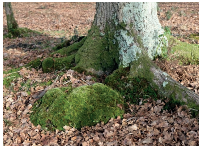
Left: a large mound of Leucobryum glaucum , Matley Bog, June 2021 (partly disintegrated and dried out during a spell of hot, dry weather); top right: Leucobryum albidum (numerous small mounds which have coalesced) growing over an old stump in beechwood, Wooson's Hill, New Forest, December 2018; bottom right: small mounds of L. albidum on roots of Pedunculate Oak, White Moor, Lyndhurst, January 2022. John Norton