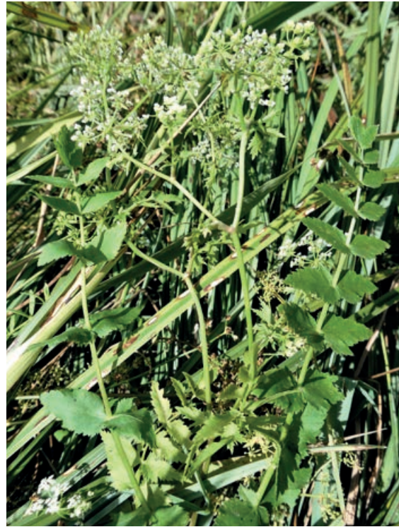
Blunt-flowered Rush Juncus subnodulosus (left) and Lesser Water-parsnip Berula erecta (right). Tony Mundell

been busy in this area, and it was very apparent that when it comes to a comfortable lie-down, they much prefer Juncus subnodulosus to the Pond-sedges!