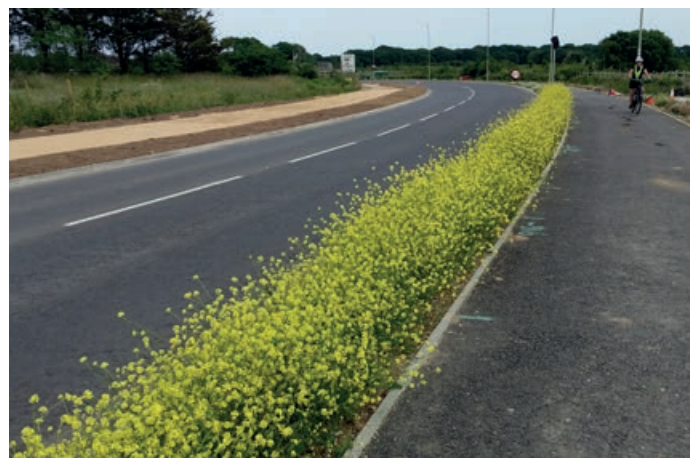
Bastard Cabbage Rapistrum rugosum proliferating along a newly landscaped verge on the new Stubbington bypass, June 2022.