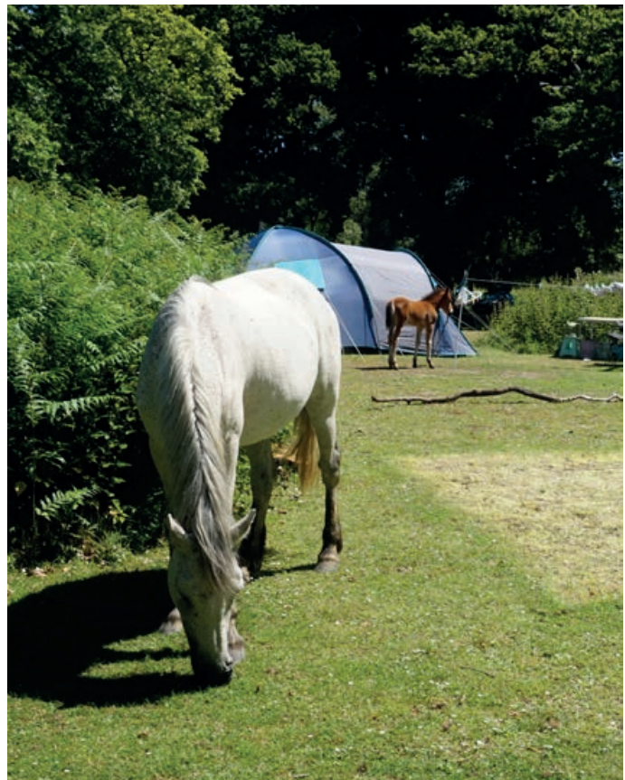
Jo-jo-weed habitat created by tents, Hollands Wood campsite. Clive Chatters