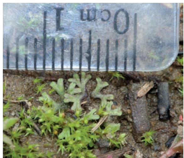
Riccia huebeneriana from Avon Heath CP (top) and Hogmoor Inclosure (bottom, with Pseudephemerum nitidum).