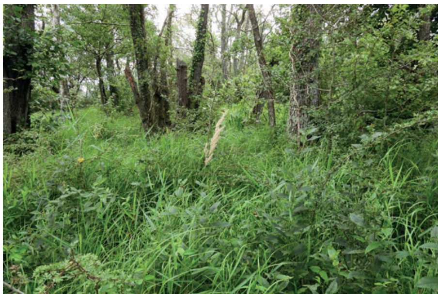
Habitat at the second site, with abundant Calamagrostis canescens plants with a single flowering stem. Neil Sanderson