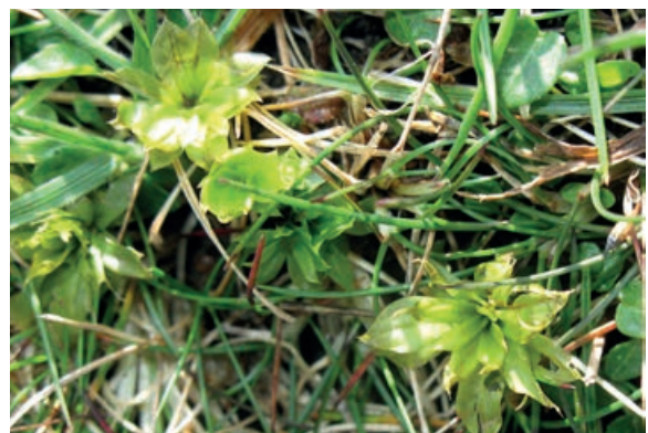
Rhodobryum roseum growing on the side of an anthill at Butser Hill, March 2022. Debbie Allan