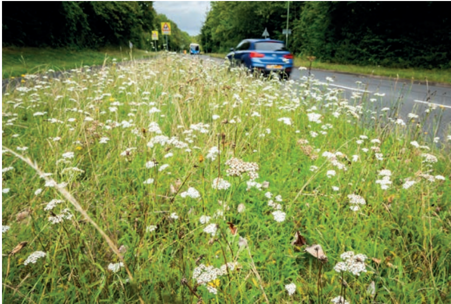
Hatch Warren and Beggarwood Biodiversity Improvement Zone.

Cephalanthera damasonium , Violet Helleborine Epipactis purpurata , Broad-leaved Helleborine E. helleborine , Pyramidal Orchid Anacamptis pyramidalis and Common Spotted-orchid Dactylorhiza fuchsii .