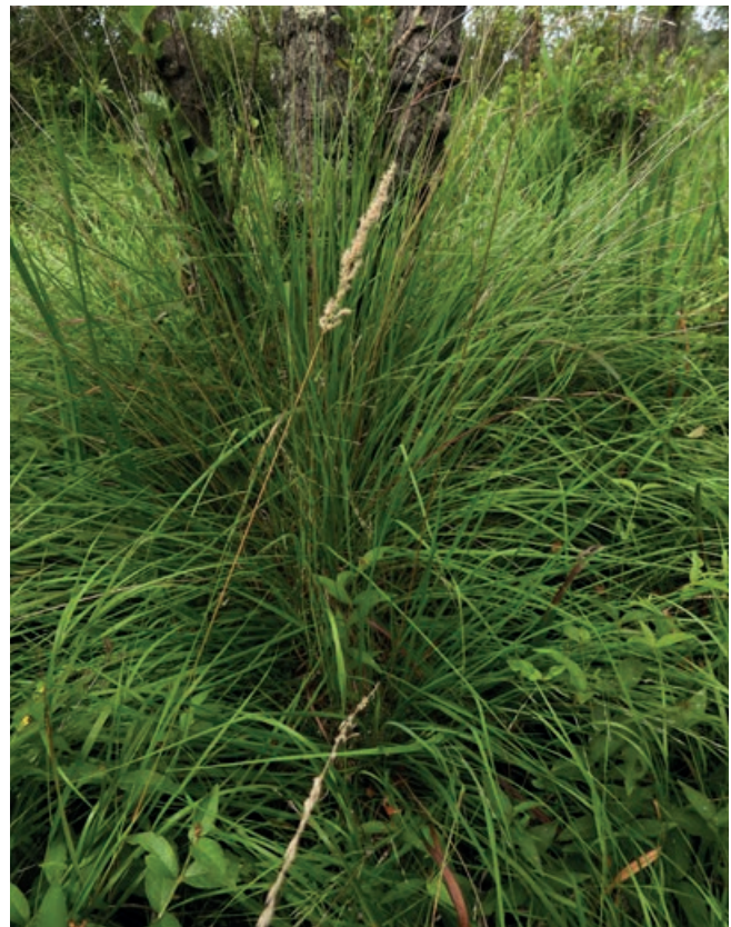
Purple Small-reed Calamagrostis canescens at the first site. Left: non-flowering stems with their elegant arching form. Right: a single flowering stem of C. canescens in front of a Molinia tussock. Neil Sanderson