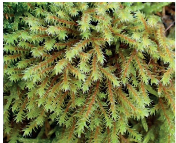
Hedwigia ciliata var. ciliata , Alresford, January 2023. Pete Flood