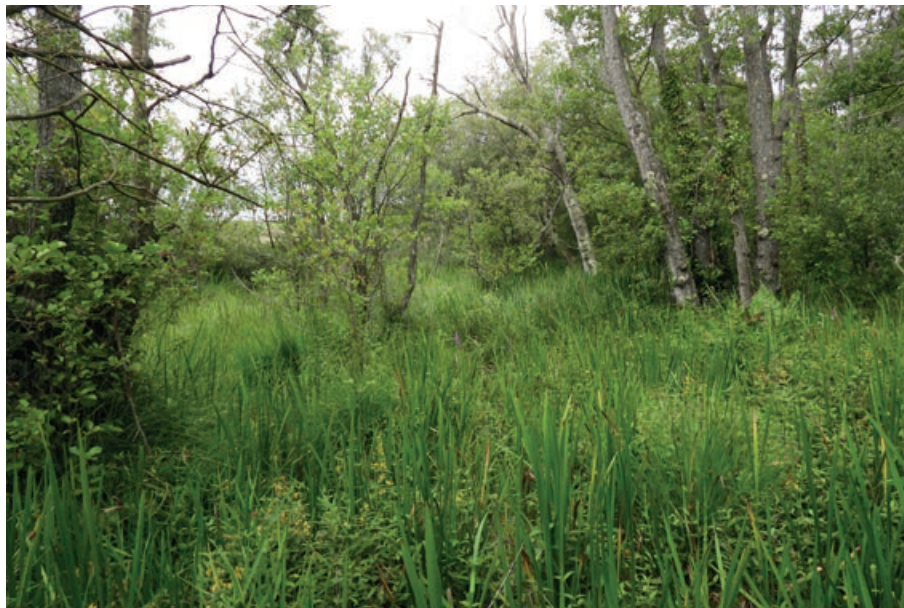
Habitat at the first site – an open glade with a patch of Calamagrostis canescens . Neil Sanderson

We found the original patch (SU 3580 0455) to be abundant in about 3 × 5 m and included a single flowering stem. It was in a recently opened-up glade on a flowline from the bog. It was growing through a tall stand with Greater Tussock-sedge, Purple Moor-grass Molinia caerulea , Branched Bur-reed Sparganium erectum and Yellow Loosestrife Lysimachia vulgaris with the bog moss Sphagnum palustre below. We then found a larger stand nearby in an open Alder Alnus glutinosa stand (SU 3582 0454), abundant in an area 5 × 6 m with a single flower stem, but then extending thinly towards the bog for another 4 m. This was on a drier bank of peat in a tall stand with Yellow Loosestrife, Purple Moor-grass, Water Mint Mentha aquatica and Common Reed Phragmites australis , again with Sphagnum palustre below. There was a bit of Bramble Rubus fruticosus and some Hawthorn Crataegus monogyna saplings in this drier stand. Finally, at SU 3583 0455, a single plant of Calamagrostis canescens was spotted in a Sphagnum palustre lawn with Yellow Loosestrife and Purple Moor-grass.