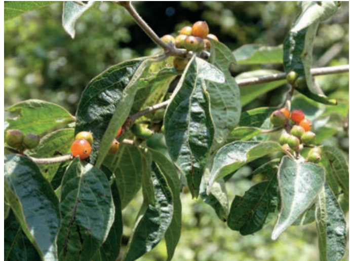
Amur Honeysuckle Lonicera maackii