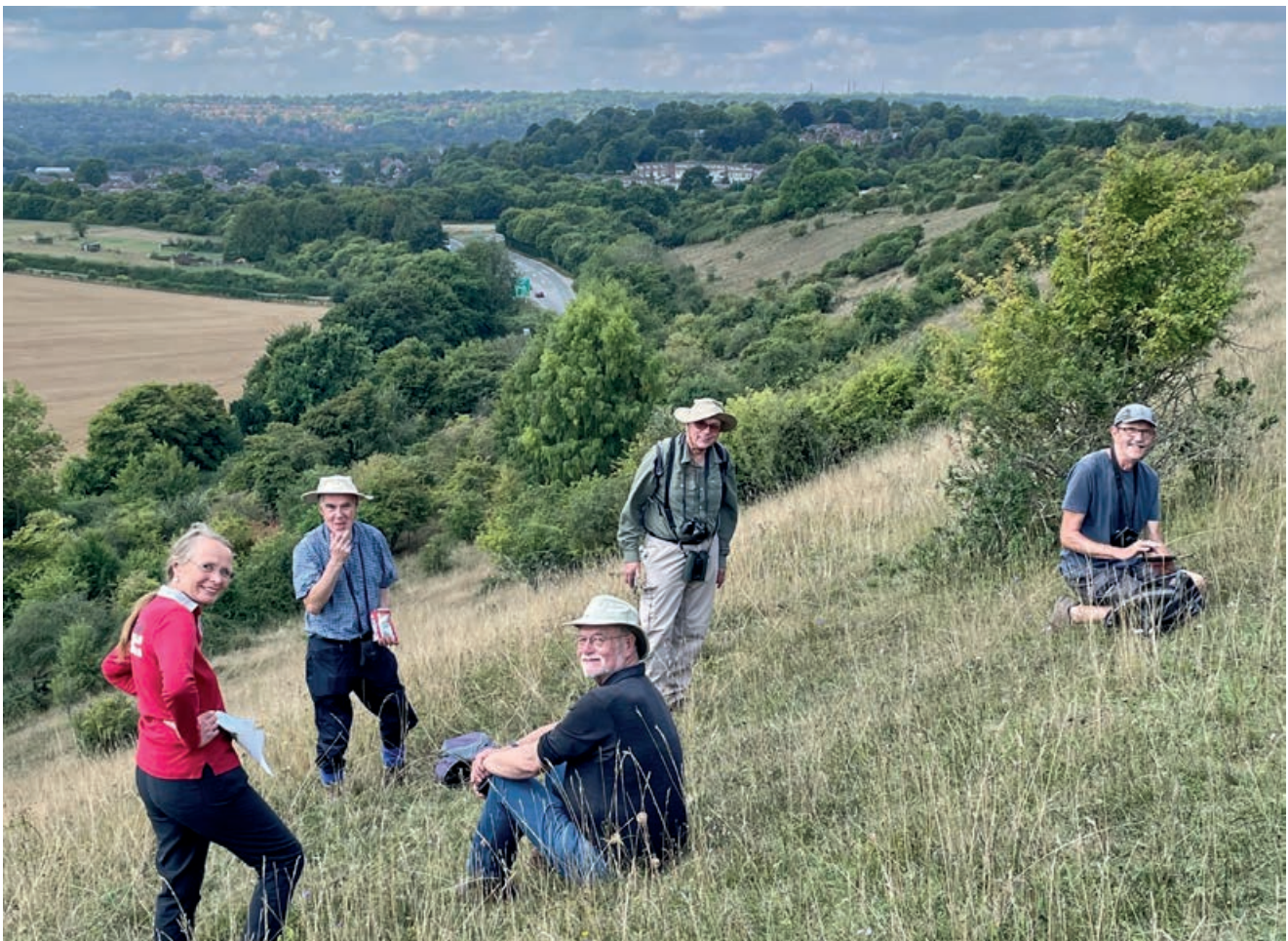
Flora Group members on the old down, Magdalen Hill Down, 27 August 2022.