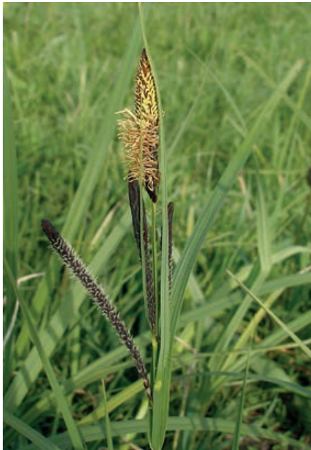
Slender Tufted-sedge Carex acuta . Martin Rand

*NA Carex acuta (Slender Tufted-sedge): Winchester College NR, SU482 283; 07 Jun 22; MR, BSBI/HFG survey party. At and near SU4823 2830, locally plentiful in rough meadow. 1st for SU42Z.