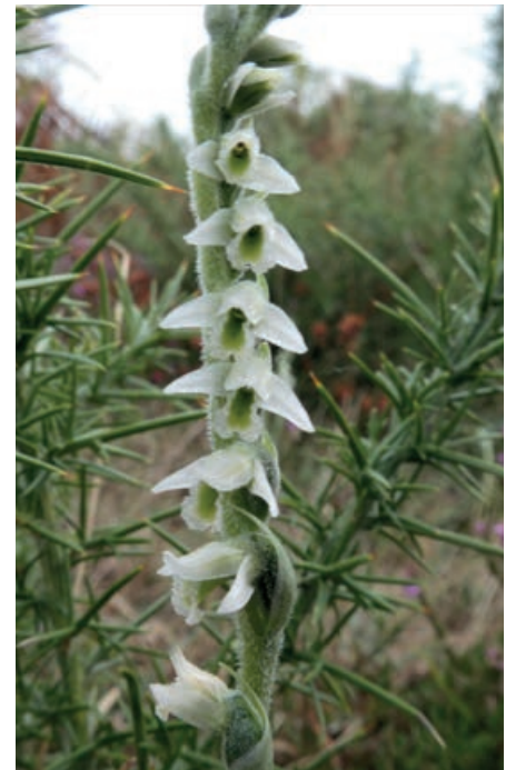
Autumn Lady's-tresses Spiranthes spiralis , near to Hatchet Pond. Tony Mundell

The calcicole species seen along the roadsides included Kidney Vetch Anthyllis vulneraria , Wild Basil Clinopodium vulgare , Blue Fleabane Erigeron acris (all new to monad, first seen in July by Alison Bolton); Greater Knapweed Centaurea scabiosa , Salad Burnet Poterium sanguisorba , Sweet-briar Rosa rubiginosa and Pale Flax Linum bienne (all new to the monad); Dwarf Thistle Cirsium acaule (one previous unlocalised record) and a lot more Autumn Lady's-tresses. A first monad record of Heath Dog-violet Viola canina in the same general area rounded off the day very nicely. During the two visits we accumulated 170 localised records of species most of which had not been recorded in the last decade, if at all.