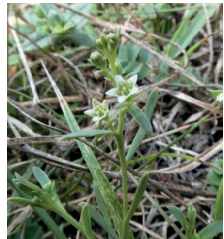
Bastard-toadflax Thesium humifusum.