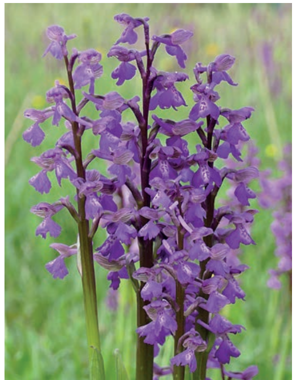
Green-winged Orchid Anacamptis morio.

The morning will be spent at Testwood Lakes Education Centre going through the form with some examples, and there will be plenty of time for discussion and questions as