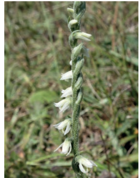
Autumn Lady's-tresses Spiranthes spiralis