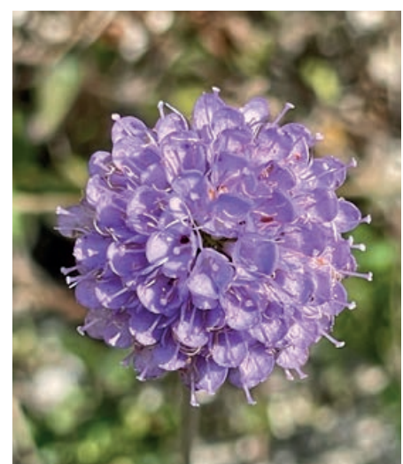
Devil's-bit Scabious Succisa pratensis