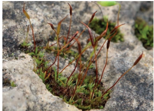
Aloina ambigua, Haslar Lake, Gosport, December 2022.