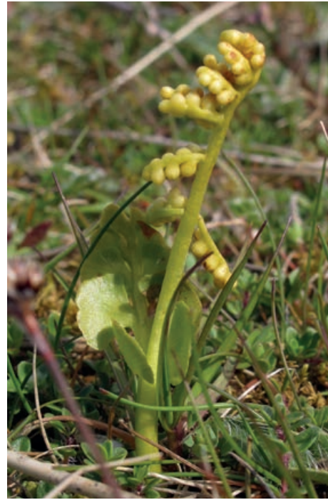
Moonwort Botrychium lunaria.

**NA Botrychium lunaria (Moonwort): Markway Inclosure (the edge, where the fence finishes), SU251 022; 17 May 22; ALe. At least 110 plants. Markway, SU25143 02251; 07 Jun 22; AHP, EJC. SU25143 02251. 1st for SU20L.