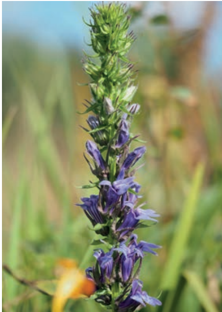
Great Lobelia Lobelia siphilitica , St Cross, Winchester, August 2022. Tristan Norton

*NA Lotus subbiflorus (Hairy Bird's-foot-trefoil): M27 Junction 9 (Central gyratory), SU5270 0850; 03 May 22; TN. Gyratory interior island. Part wooded with rough grassland/scrubby margins. One large flowering plant noted on bare sandy/gravelly verge edge at SE edge of main gyratory island. 1st for SU50J.