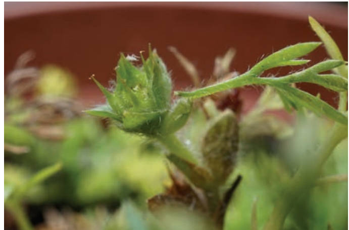
Jo-jo-weed Cotula sessilis in cultivation, showing developing spines. Clive Chatters

There were native bonuses to be found, such as the populations of Mossy Stonecrop Crassula tillaea at Ashurst and Hollands Wood along with a fine range of parched acid grassland Clovers at Denny Wood, including Hairy Bird's-foot-trefoil Lotus subbiflorus , Clustered Clover Trifolium glomeratum and Subterranean Clover T. subterraneum . Roundhill supported Coral-necklace Illecebrum verticillatum in seasonally wet hollows and drier patches with Small Cudweed Logfia minima . The uneven lawns of the lightly used Aldridge Hill site were exceptionally rich with Coral-necklace, Slender Marsh-bedstraw Galium constrictum and Small Adder's-tongue Ophioglossum azoricum .