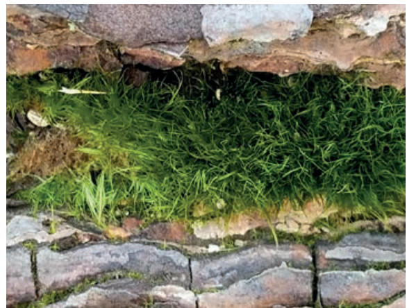
Dicranum tauricum, Fort Brockhurst, Gosport, April 2022.