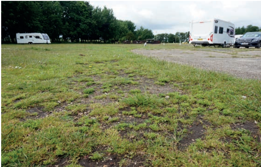
Jo-jo-weed habitat created by caravans, Holmsley campsite.

It falls to Forestry England and their campsite managers to address the challenges of recreational use being a vector for invasive non-native species. The 2022 survey helps to define those challenges and will contribute to the wider debate as to how recreation is to be managed in a place as beautiful, biologically diverse and as vulnerable as the New Forest.