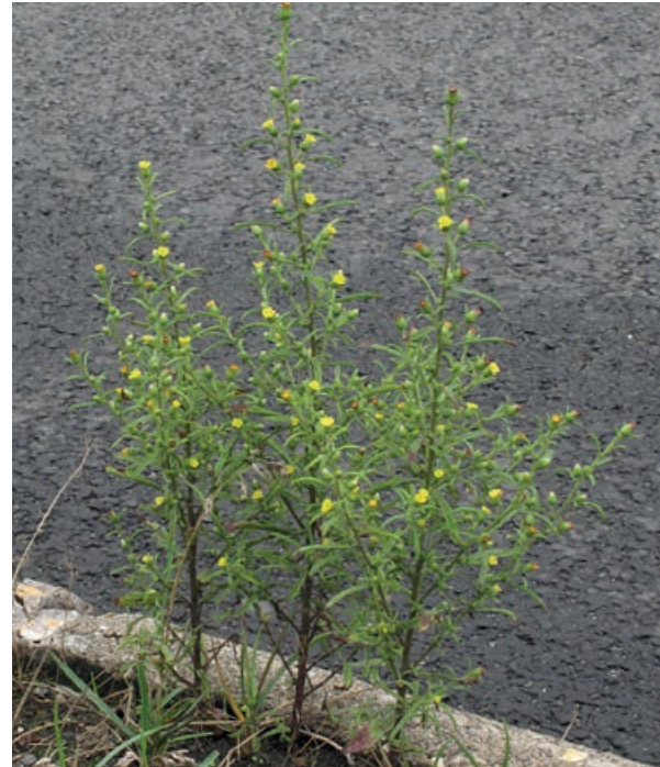
Left: Woody Fleabane Dittrichia viscosa ; right: Stinking Fleabane Dittrichia graveolens