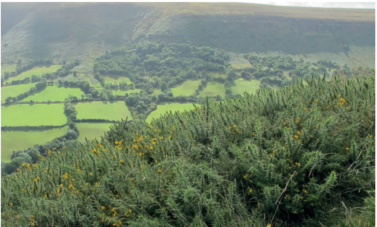
Ulex gallii in the west – Black Mountains, Herefordshire.