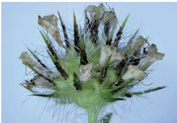
Small Teasel Dipsacus pilosus , Malshanger. Mike Hackston

Dipsacus pilosus (Small Teasel) Overton SU5182 5072, Station Approach, three large flowering plants in scrubby edge of car park, Tristan Norton 18 Aug 2022. Malshanger SU5717 5291, two plants, both in flower, in woodland north-east of Malshanger House, Mike Hackston 20 Aug 2022.