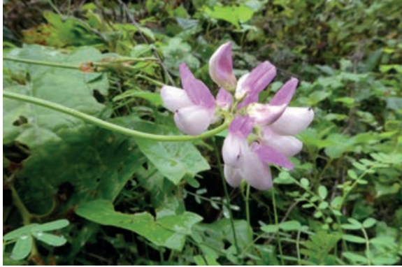
Crown Vetch Securigera varia , Micheldever Wood. Tony Mundell

Securigera varia (Crown Vetch) Micheldever Wood, still in flower and in extraordinary abundance all over the more northern tumulus, covering SU5320 3679, SU5320 3680 and SU5321 3680. Also flowering in abundance around the southern tumulus at SU5332 3658, SU5333 3660 and to SU5331 3658, Tony Mundell & Sue Bell 13 Sep 2022.