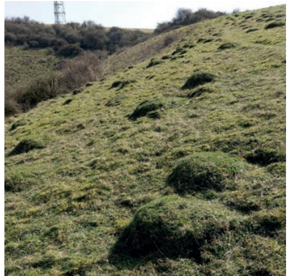
Rhodobryum roseum habitat at Butser Hill, March 2022.