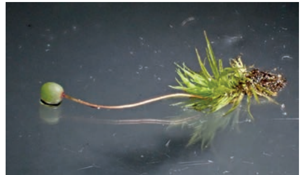
Bartamia pomiformis (Common Apple-moss) specimen.

I have been slowly adding records of new bryophytes to my local area of Gosport. Of note over the past year or so are Pleuridium subulatum , Hennediella macrophylla (in two places), Bryum pallenscens , Dicranum tauricum