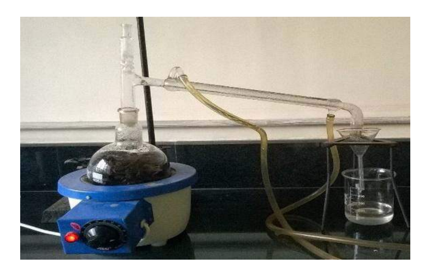
Figure 2: Extraction of cinnamon oil from whole dried cinnamon barks using distillation flask.

GCMS method of analysis: The components of cinnamon oils were separated and identified on Perkin Elmer Clarus 600 C mass spectrometer. Separation of a mixture of compounds present in the cinnamon oils was achieved on GsBP-5ms (30m x 0.25mm ID x 0.25µm film thickness) capillary column. This column has the composition of 5% diphenyl and 95% dimethyl poly siloxane (non- polar) with the temperature range of -60°C to 350°C. For analysis using mass spectrometer as a detector, Helium (He) gas was used as carrier gas. The flow rate of carrier gas was set to 1ml/min. The injector was maintained at 220°C whereas MS source and Inlet line temperature was set at 280°C. All the three cinnamon oils were injected as neat samples. 0.2µl of cinnamon oil samples were injected with a split ratio of 50:1 to prevent the capillary column from overloading. The column oven was temperature programmed by