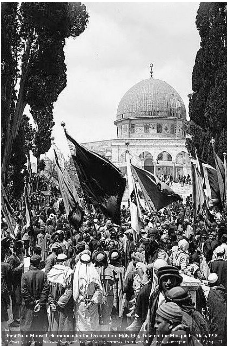
First Nebi Mousa Celebration after the Occupation. Holy Flag Taken to the Mosque El-Aksa, 1918.