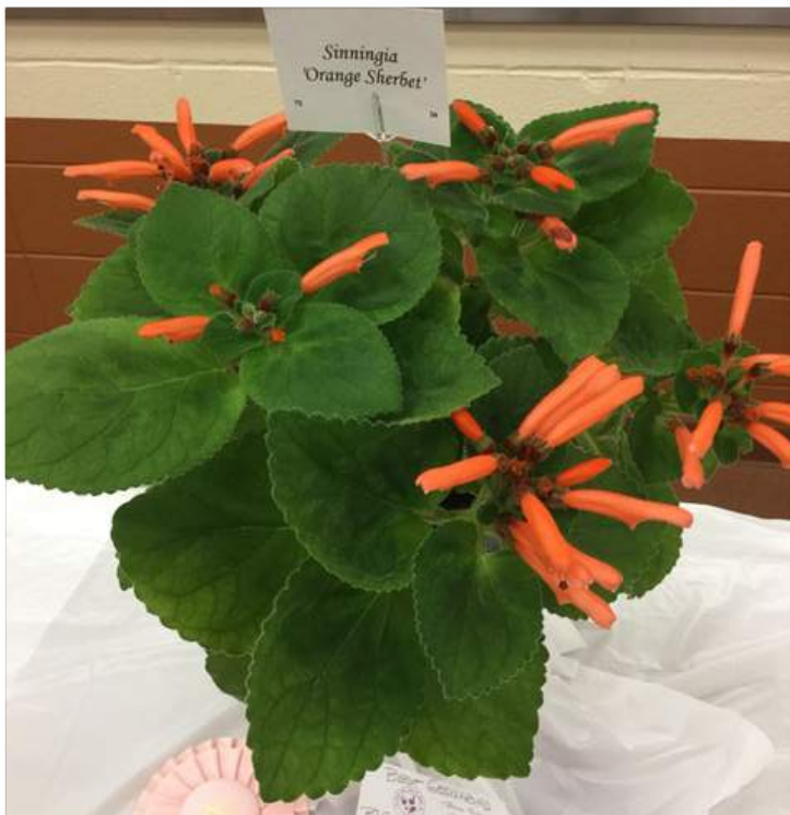
Sinningia 'Orange Sherbet'