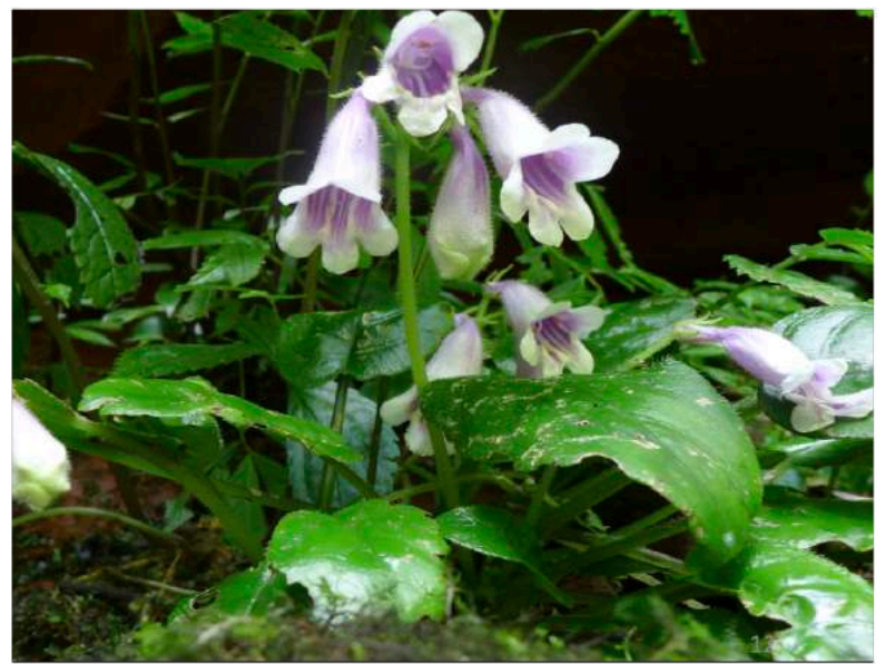
Briggsiopsis delavayi