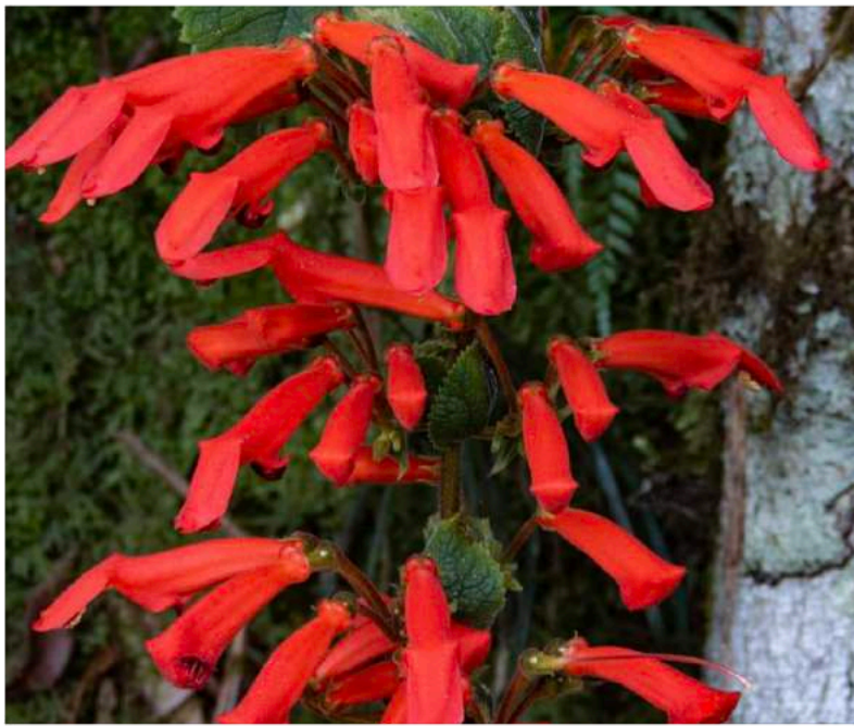
Sinningia cooperi , Nova Friburgo, Rio de Janeiro state