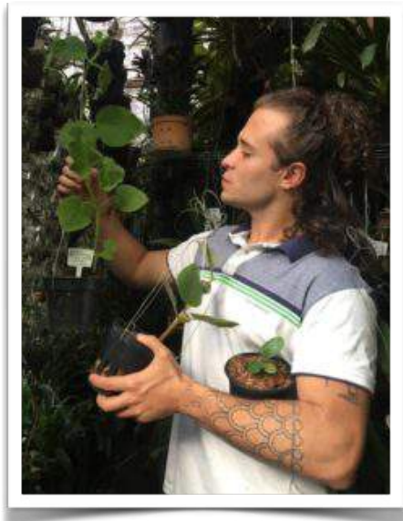
Sinningia cochlearis Nova Friburgo, Rio de Janeiro state