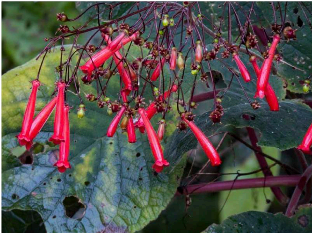
Sinningia gigantifolia , Nova Friburgo, Rio de Janeiro state