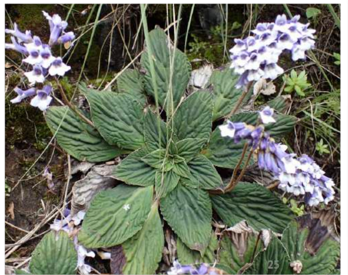
Corallo-discus kingianus