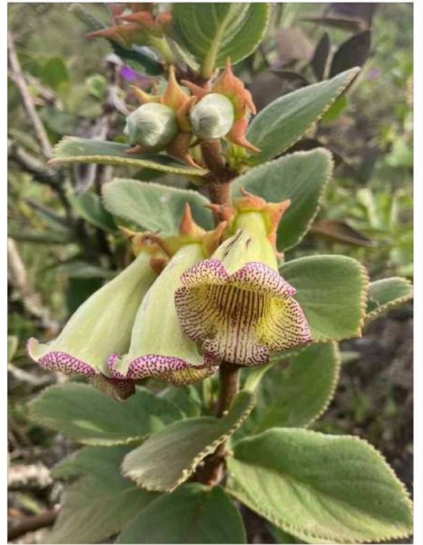
Paliavana sericiflora , Congonhas, Minas Gerais