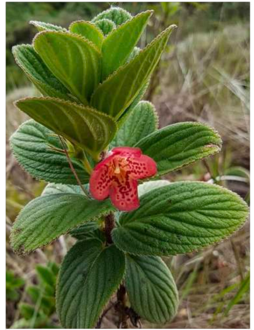
Vanhouttea hilariana , Conceição do Ibitipoca, Minas Gerais