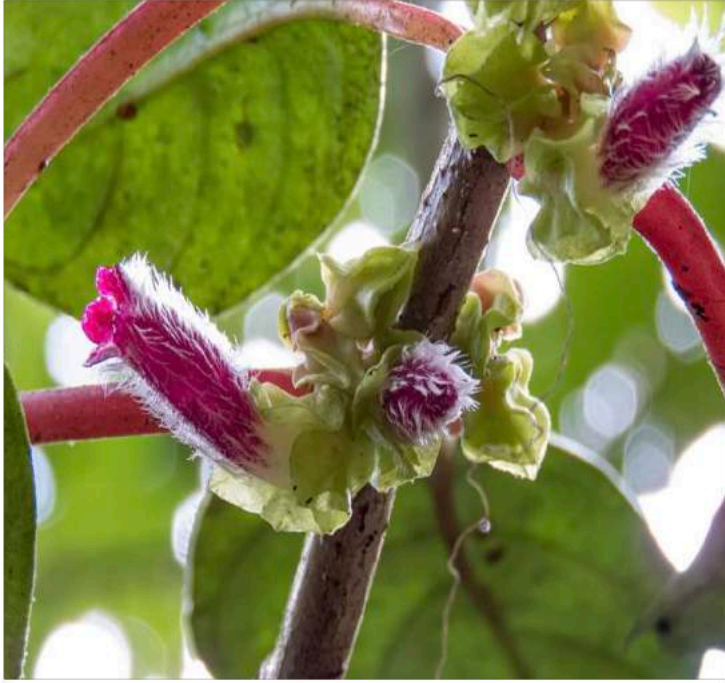
Nematanthus hirtellus , Nova Friburgo, Rio de Janeiro state