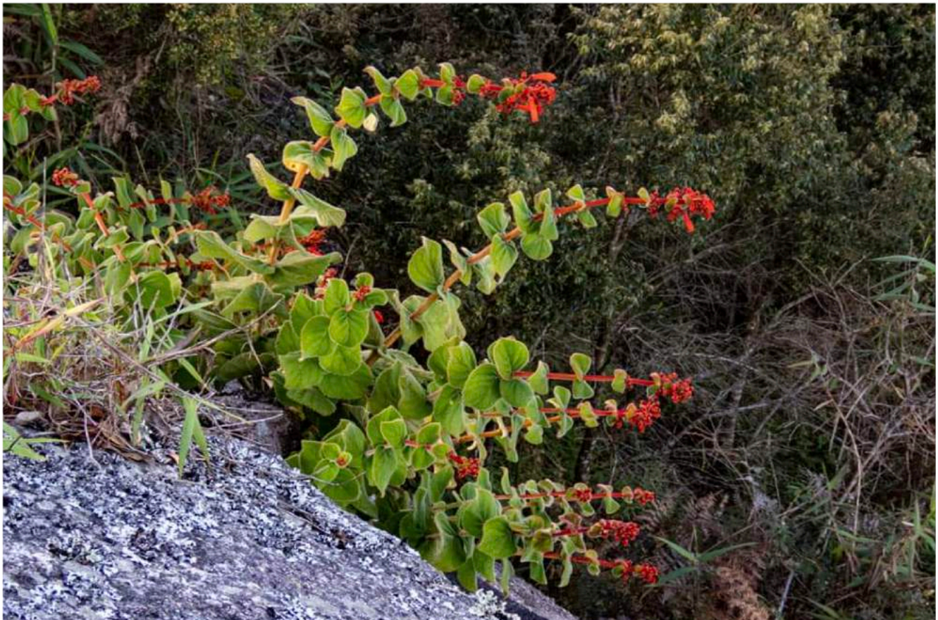
Sinningia magnifica - Nova Friburgo, Rio de Janeiro state