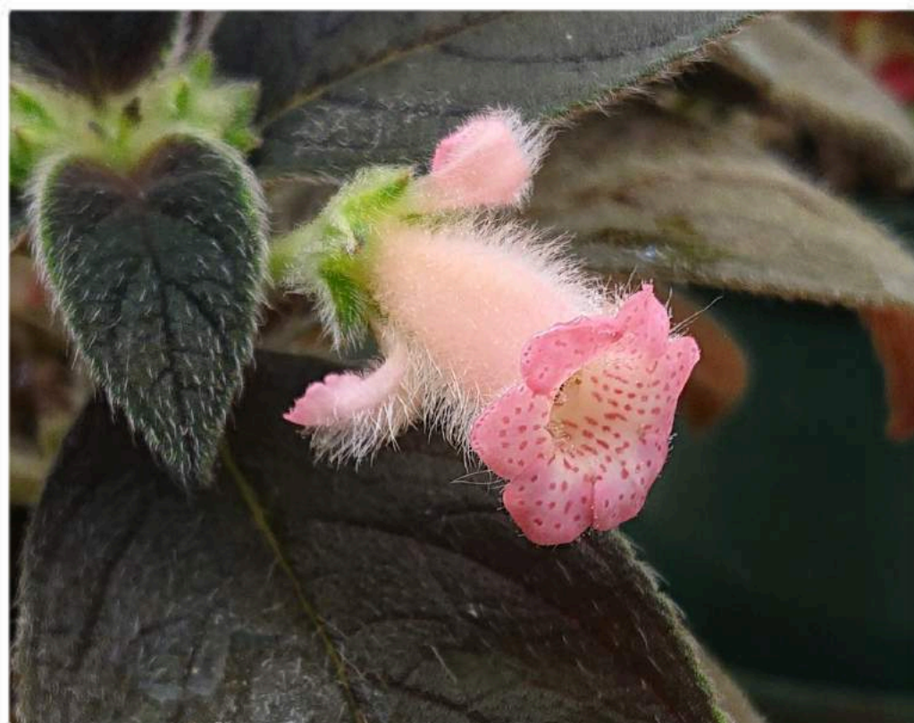
Kohleria 'Bud's Little Pig'