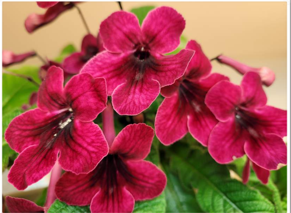
Streptocarpus 'Bristol's Cherry Bomb'