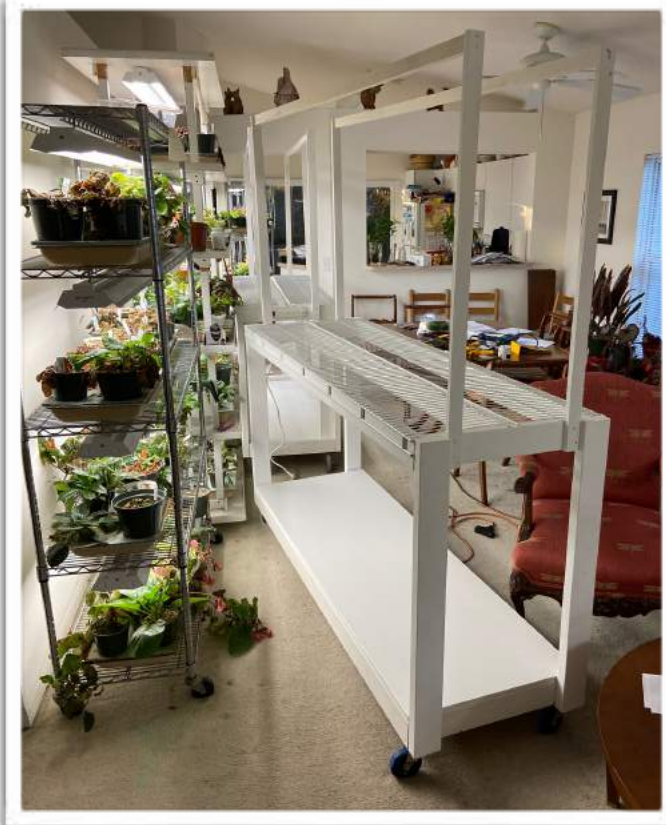
The shelves were two different heights when I received them. Now, they match almost perfectly.