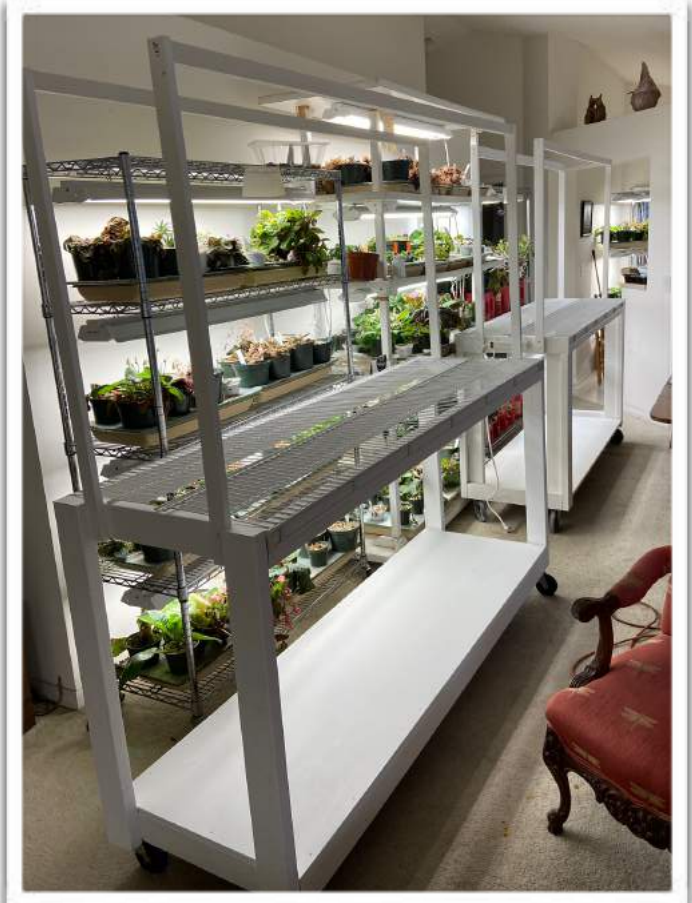
The second level shelving is open wire racks.