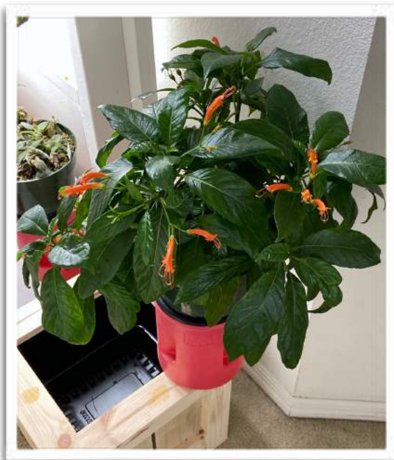
Large specimen plants like Gesneria pedunculosa need a constant supply of water.

I thought the shelves could use some accessories. Although they are unpainted at this point, they work well at both ends of the shelving wall.