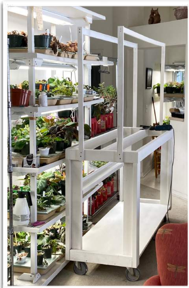
Painting is done and final assembly begins.