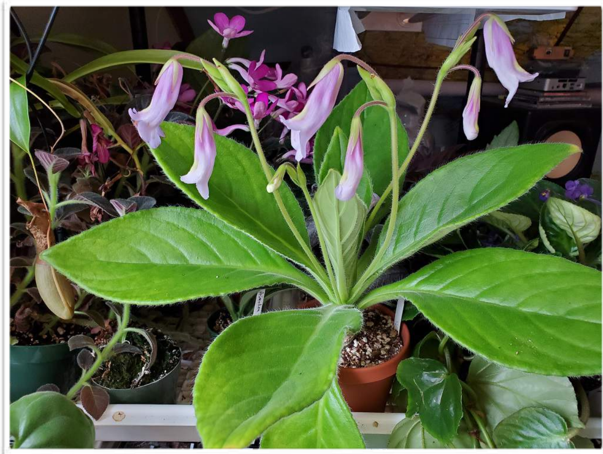
Primulina flavimaculata