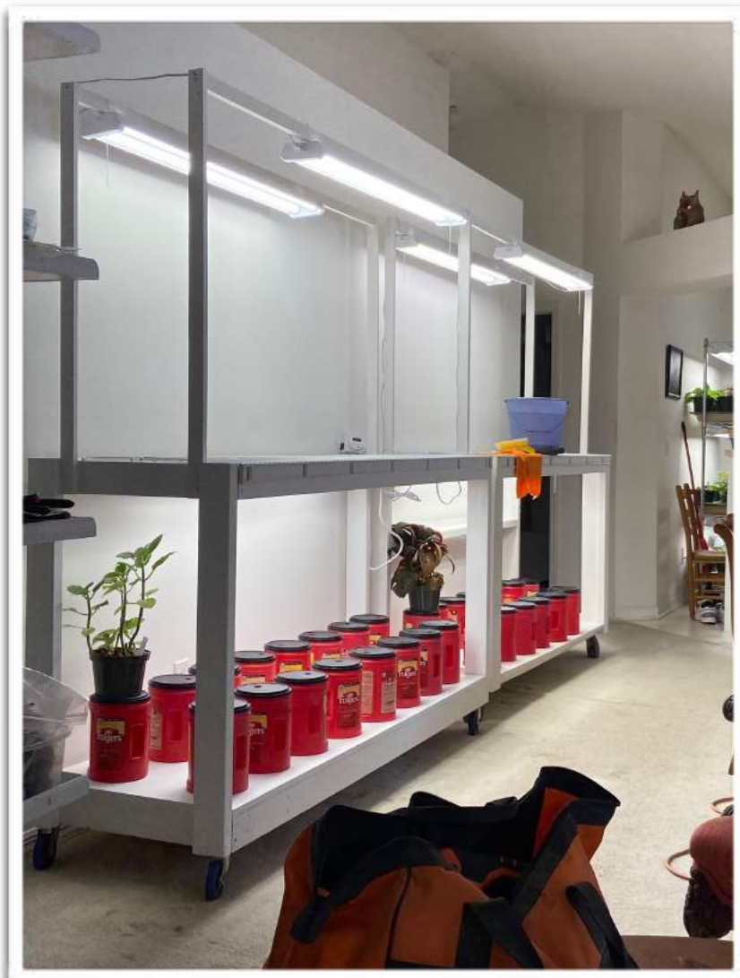
The lights are suspended over the top of the second shelving and functioning on all levels.

The decision about what kind of lighting to use was an easy one to make. I have used LED lighting for many years now, due to their high efficiency output and their low cost of energy use. A longer distance between the lighting fixtures on the top of the plants makes the LED lighting a better choice because they don't have as much light fall off with distance compared to fluorescent tubes. I ended up using my favorite shop light fixture, available at Costco from the Feit company. These units can supply 4000 lumens of cool-white light at 4000K of spectrum with no noticeable heat discharging from the fixture. They are very light in