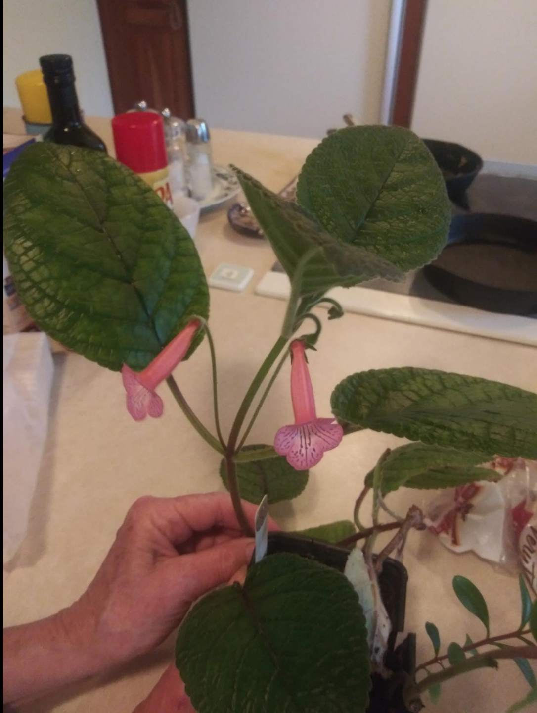
Sinningia 'Bubbling Butter'