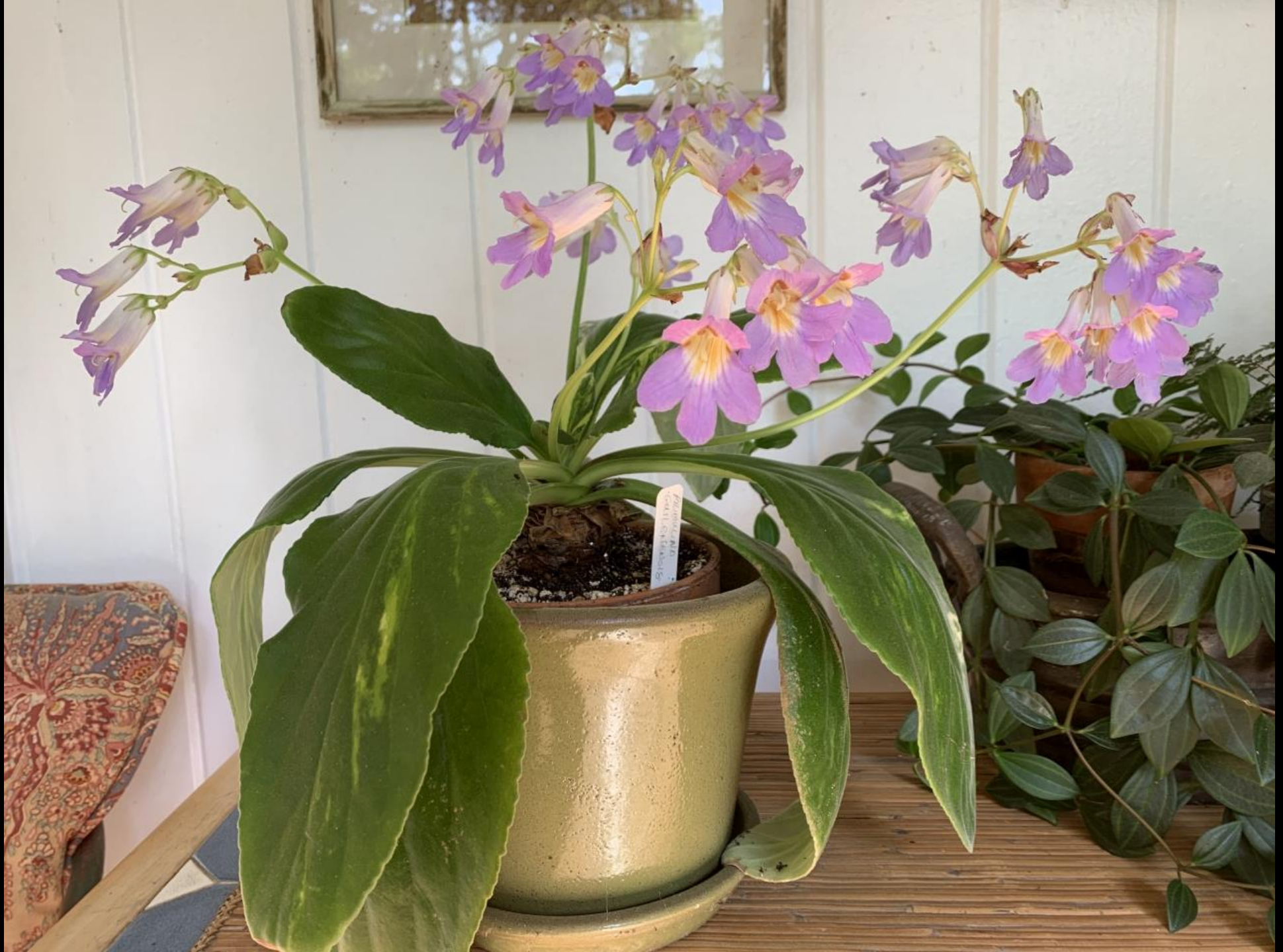
Primulina guelinensis