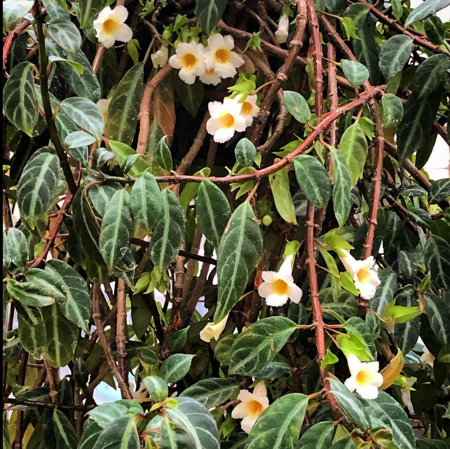
Drymonia sp. 'Cuyabenensis'