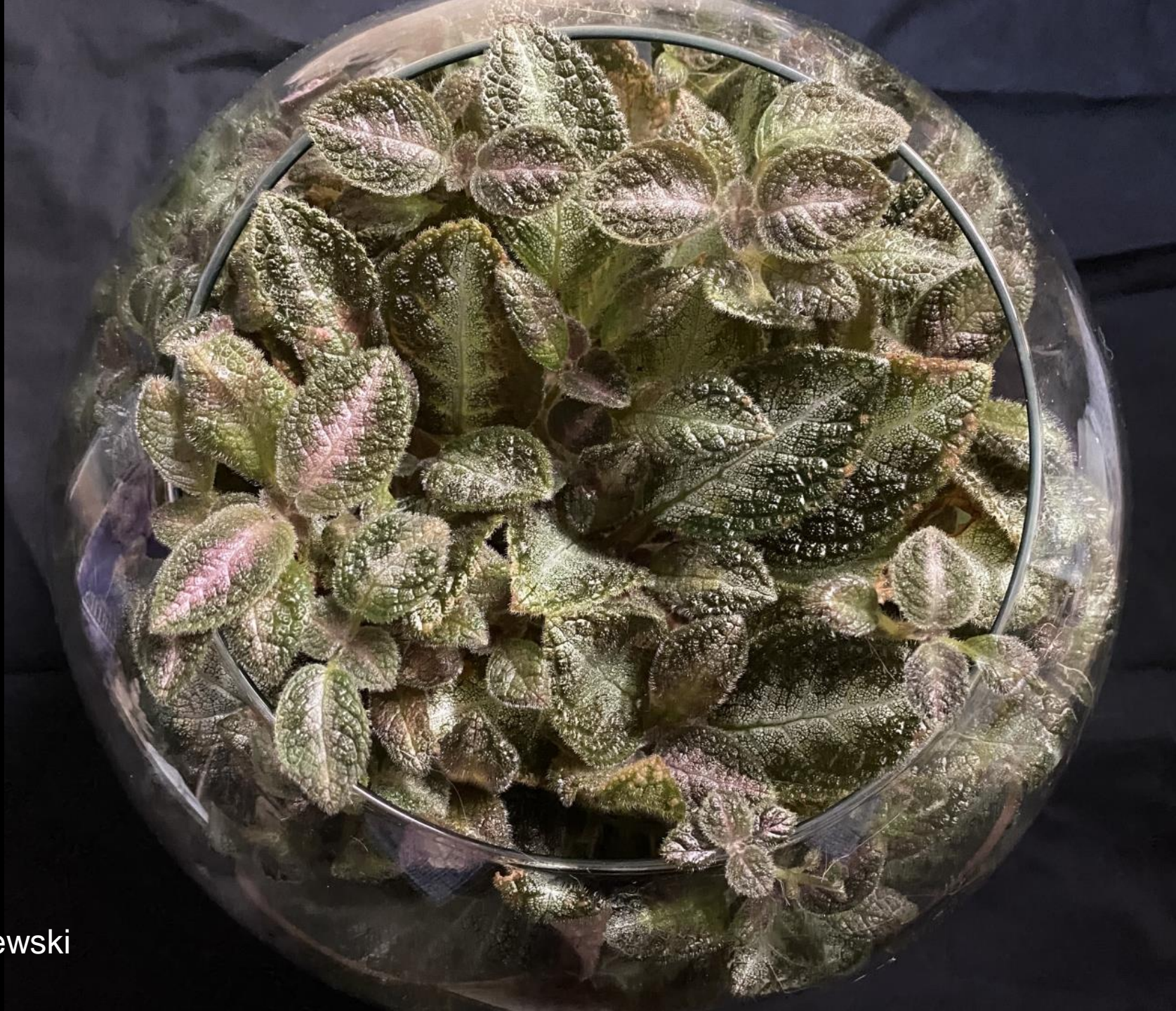
Episcia hybrid.