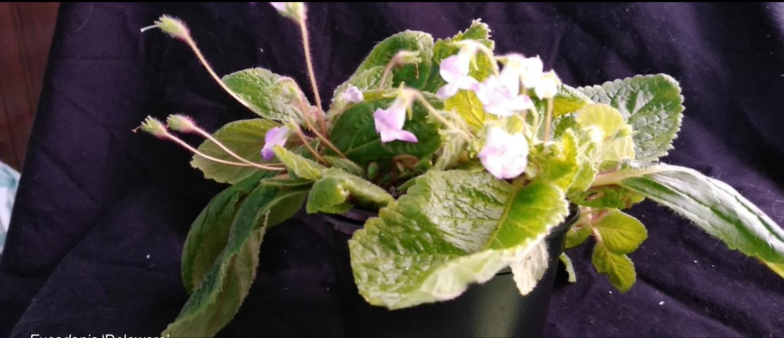
Eucodonia 'Delaware' Lindee Vaught