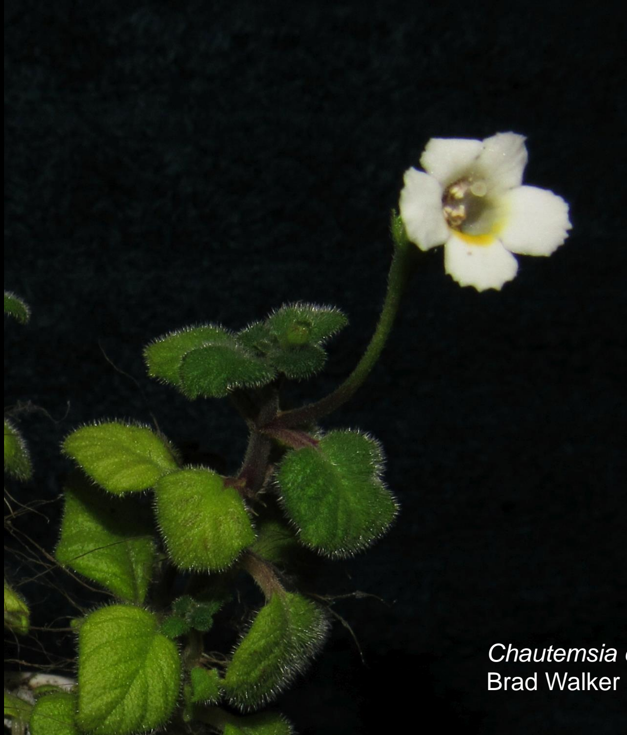
Chautemsia calcicola