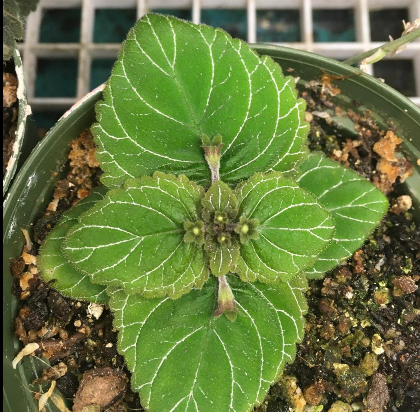
Diastema latiflorum