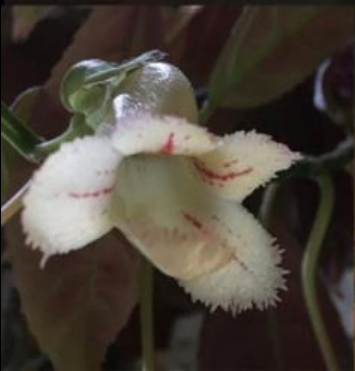
Drymonia serrulata 'Maranguape'