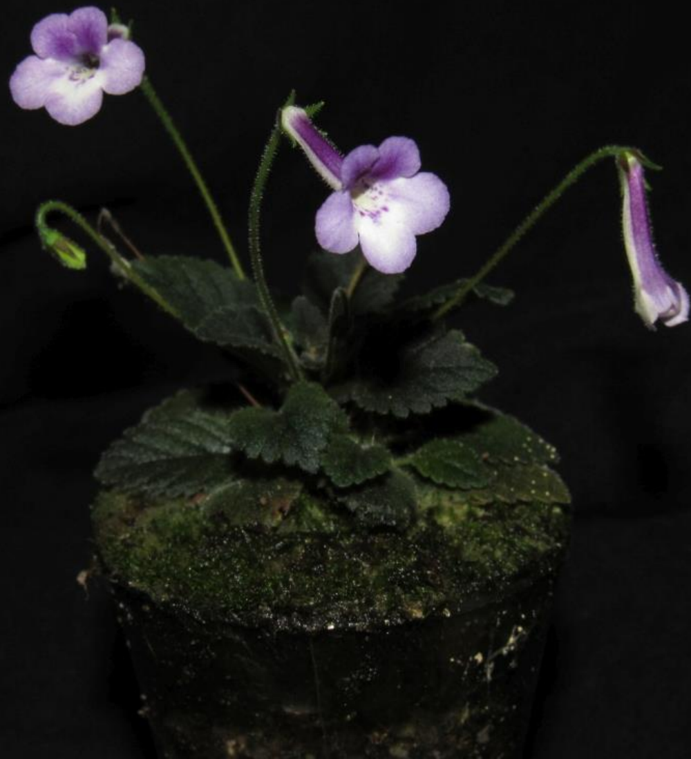
Sinningia 'Lil' Georgie'