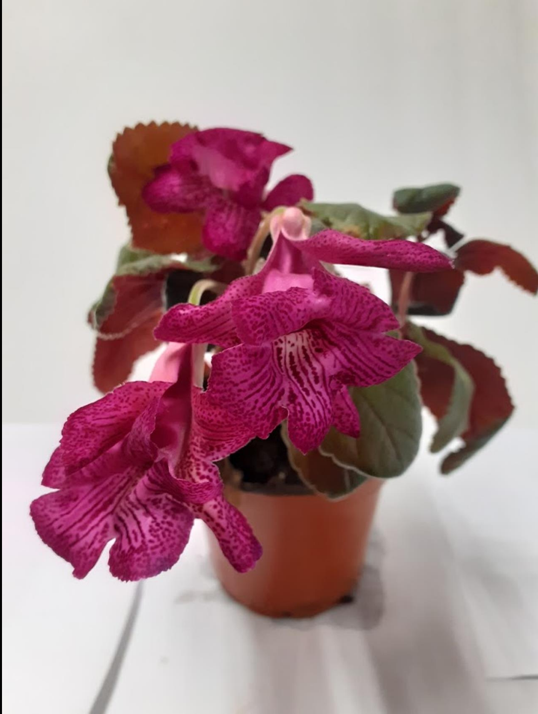
Sinningia Isa's Gorgeous Kathy Spissman