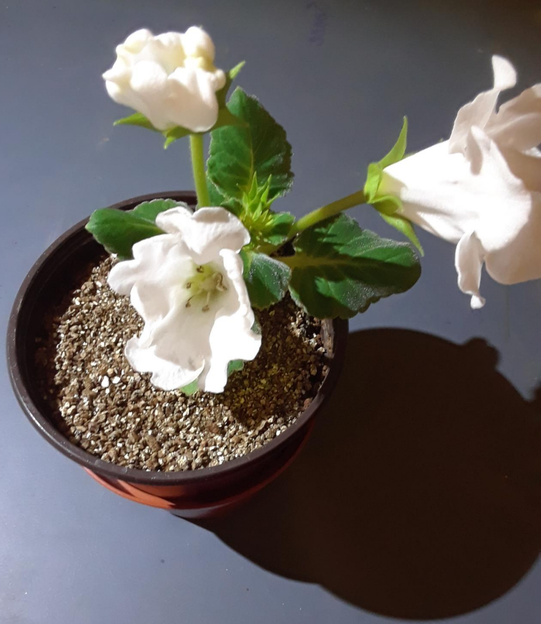
Sinningia hybrid white Johnnie Berry