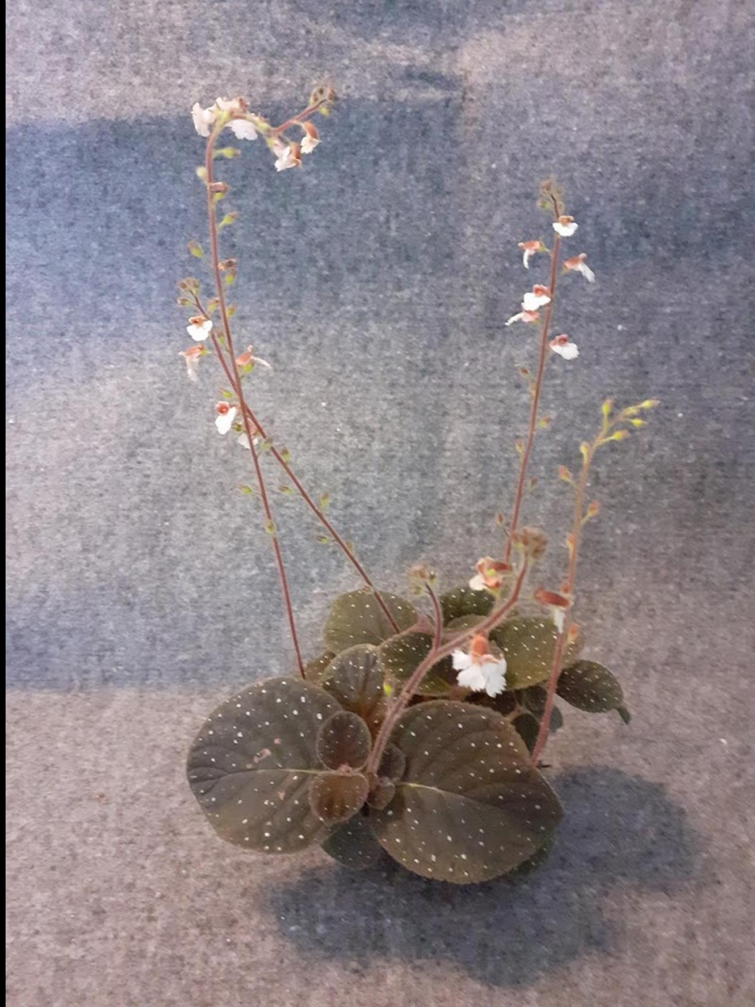
Gloxinia erinoides 'Terezina de Gejas'