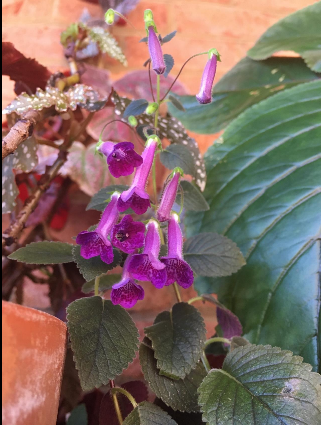
Sinningia 'Deep Purple Dreaming' Sally Miller