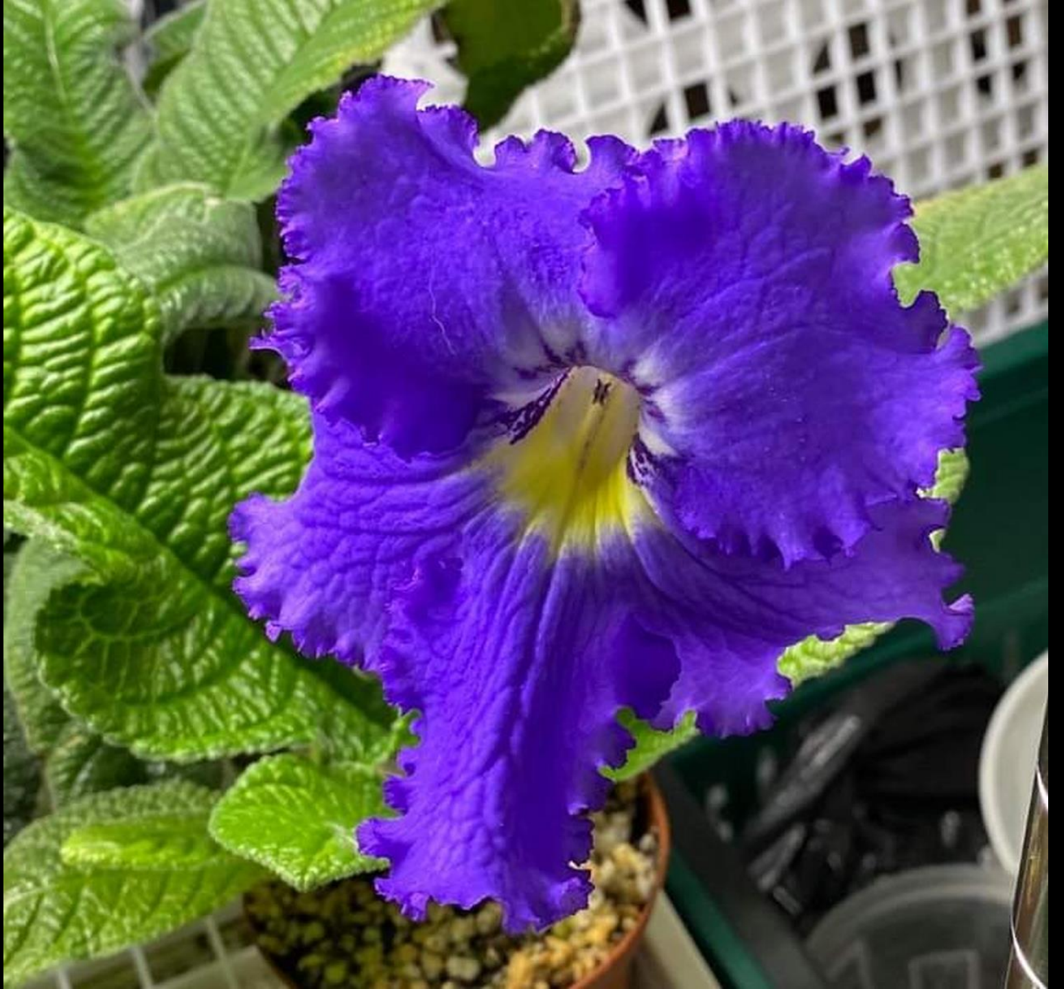
Streptocarpus 'Neils Big Blue' Teri Copeland Wilson