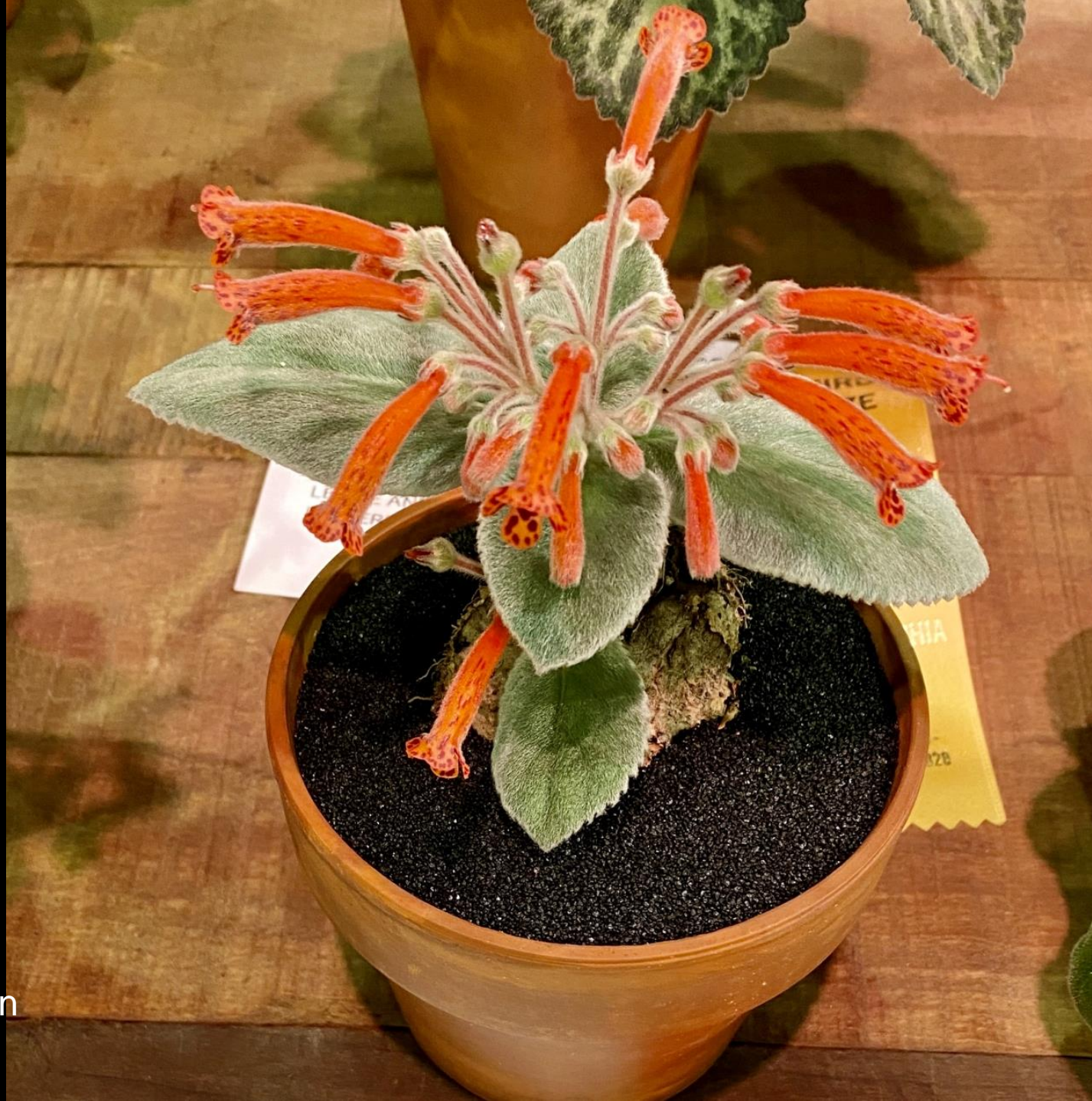
Sinningia hybrid