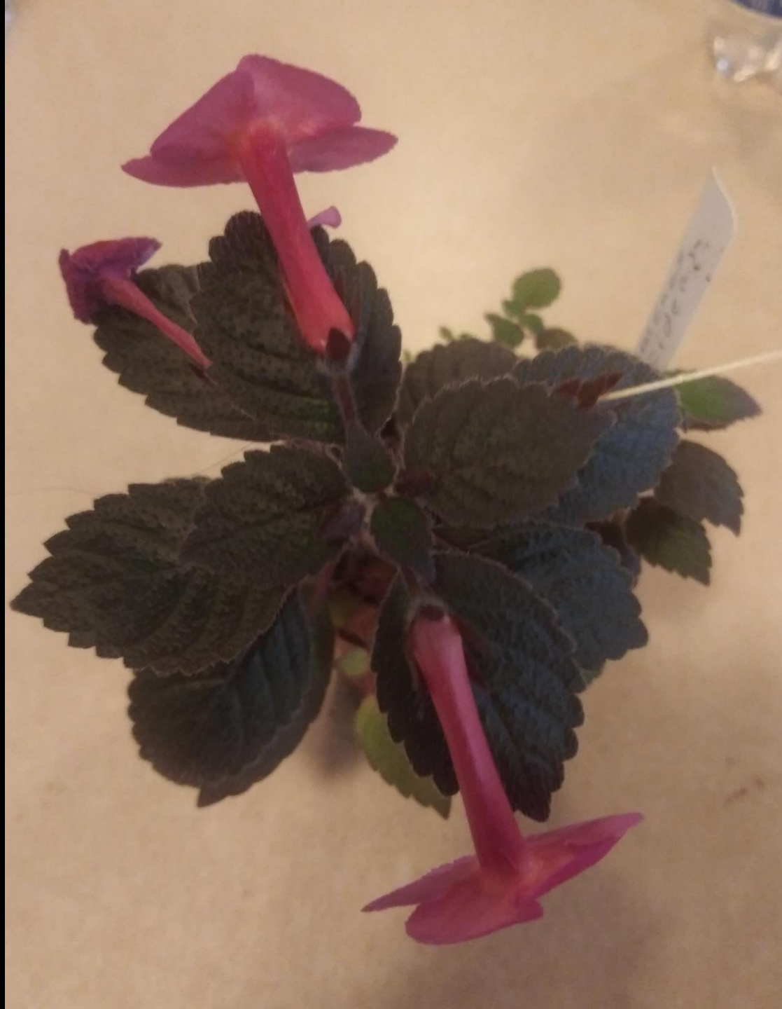
Achimenes 'Apple Cider' Pam Braun