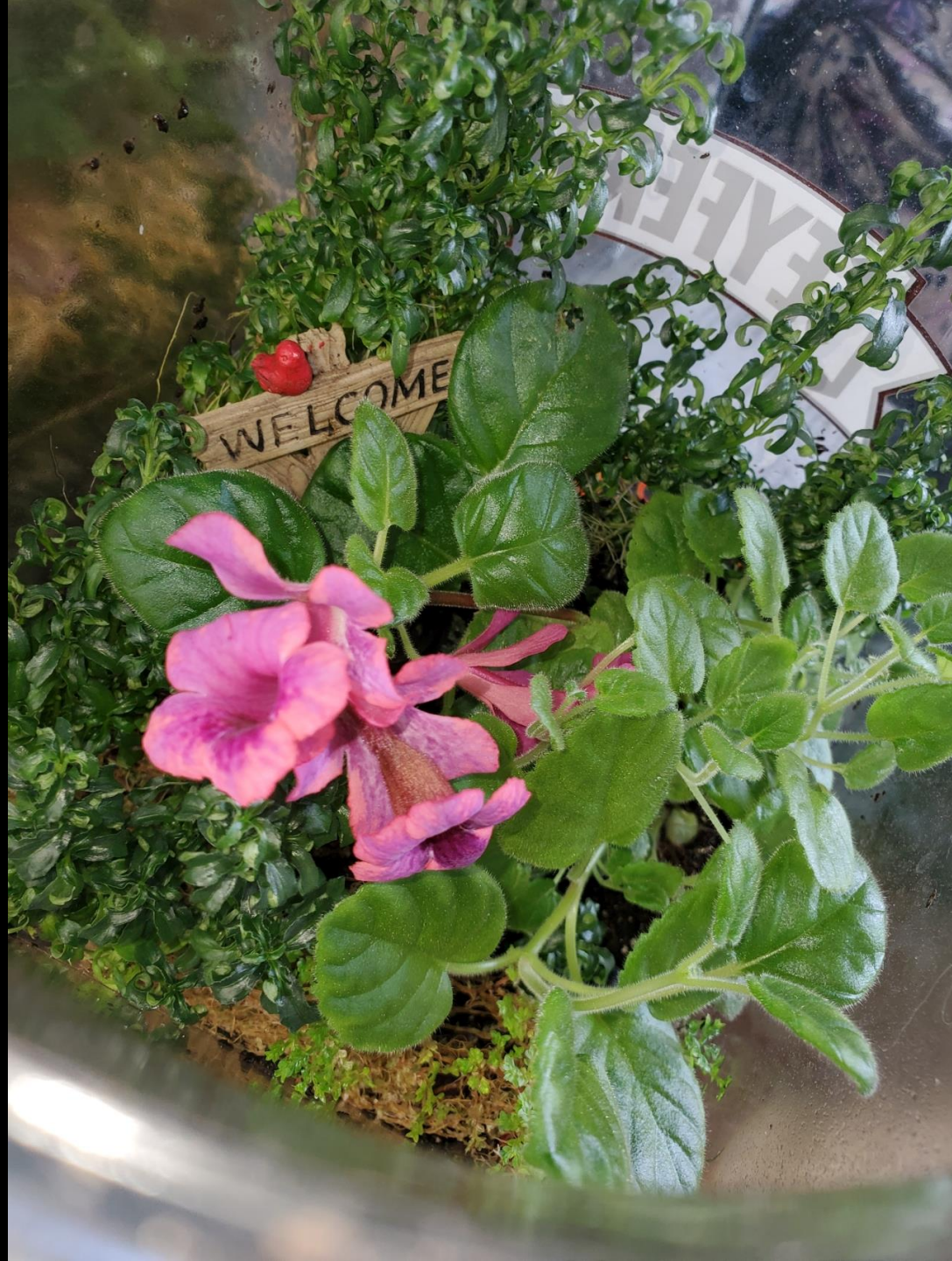
Sinningia hybrid Amanda Overla