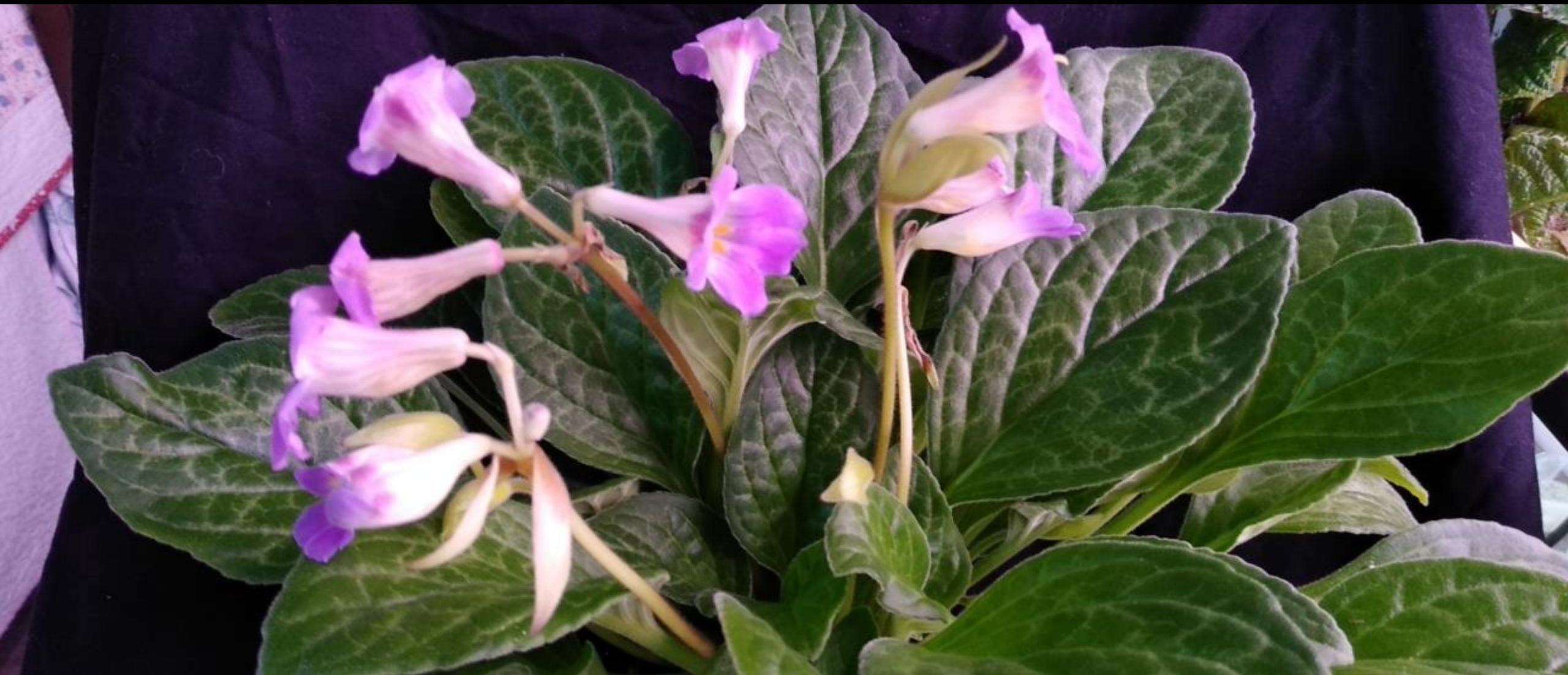
Primulina 'Moonlight' Lindee Vaught