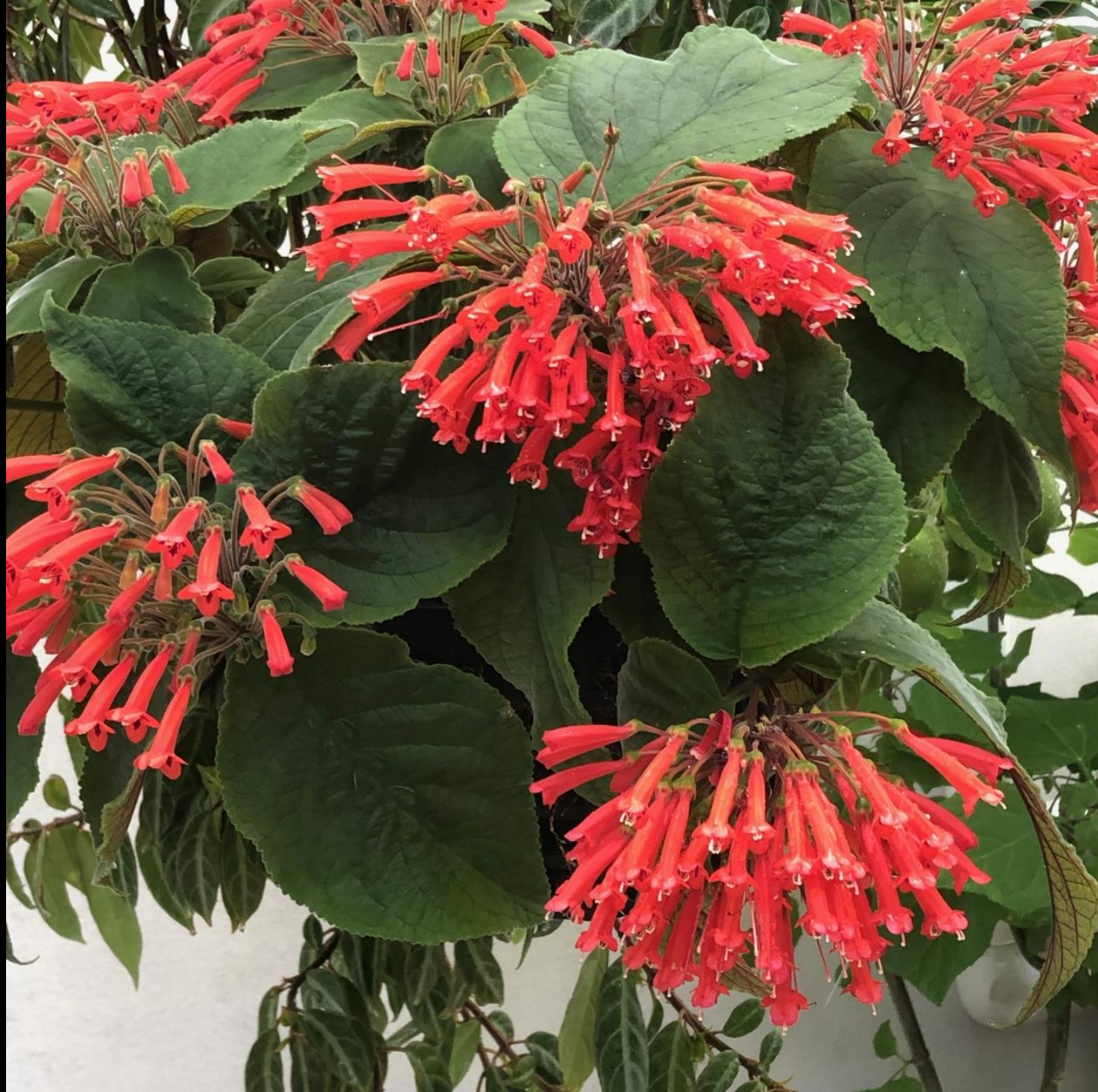
Sinningia leopoldii