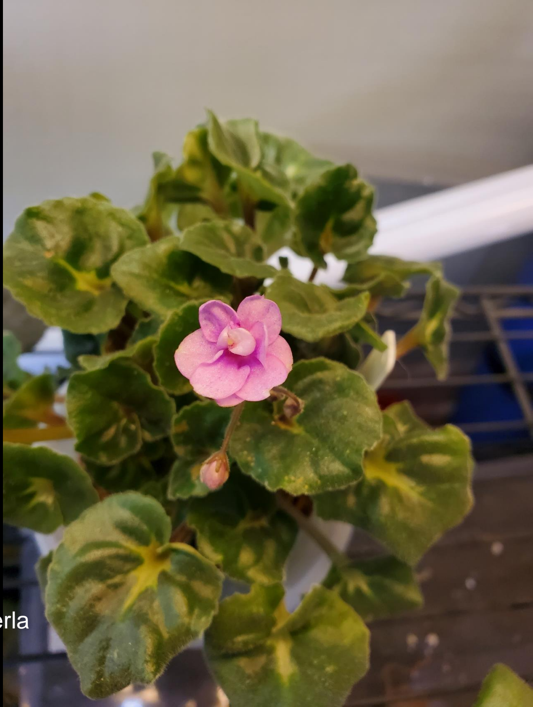
Saintpaulia hybrid Amanda Overla