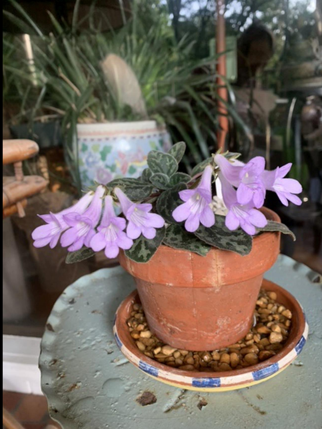
Primulina yungfuensis