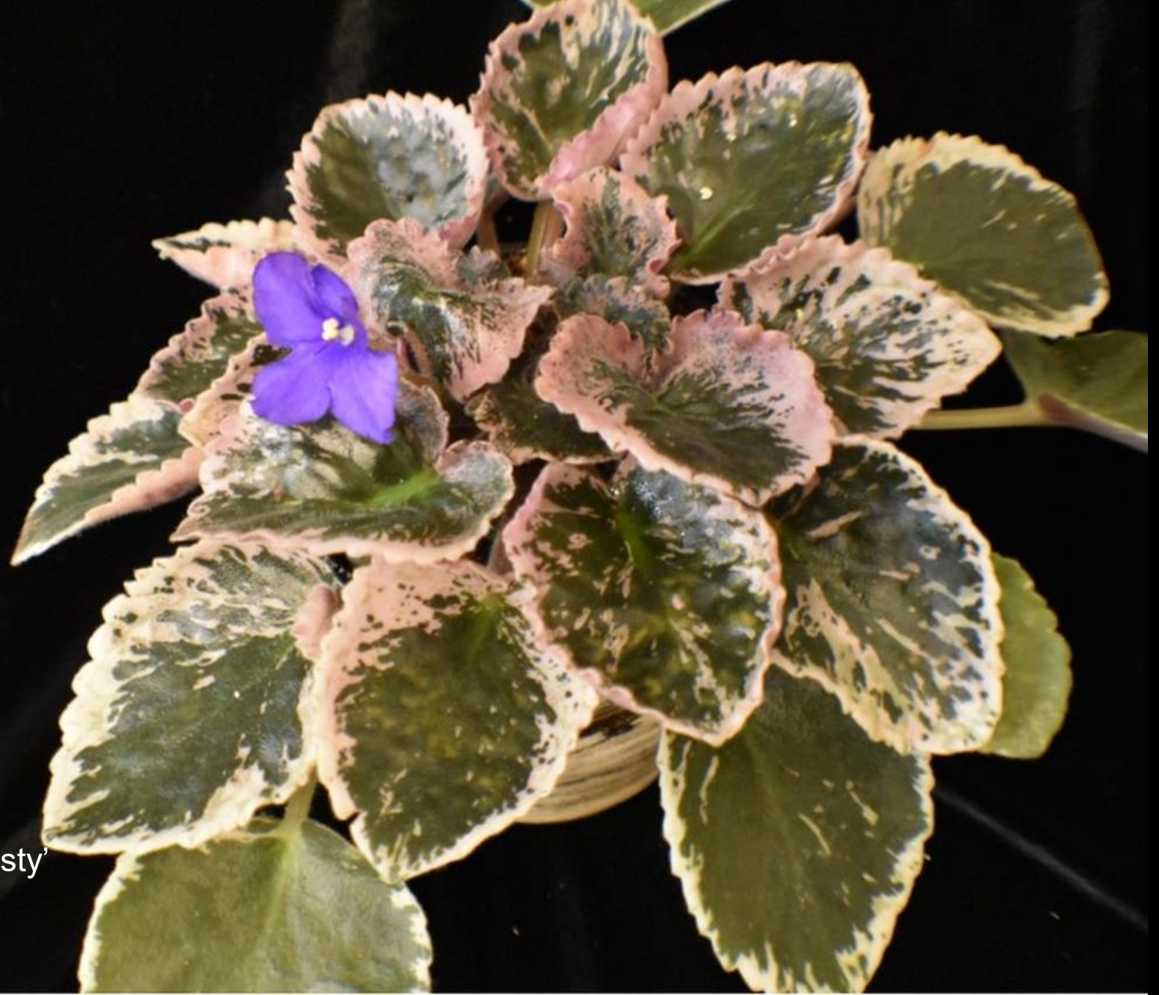
Saintpaulia 'Optimara Modesty' Celeste Matthews