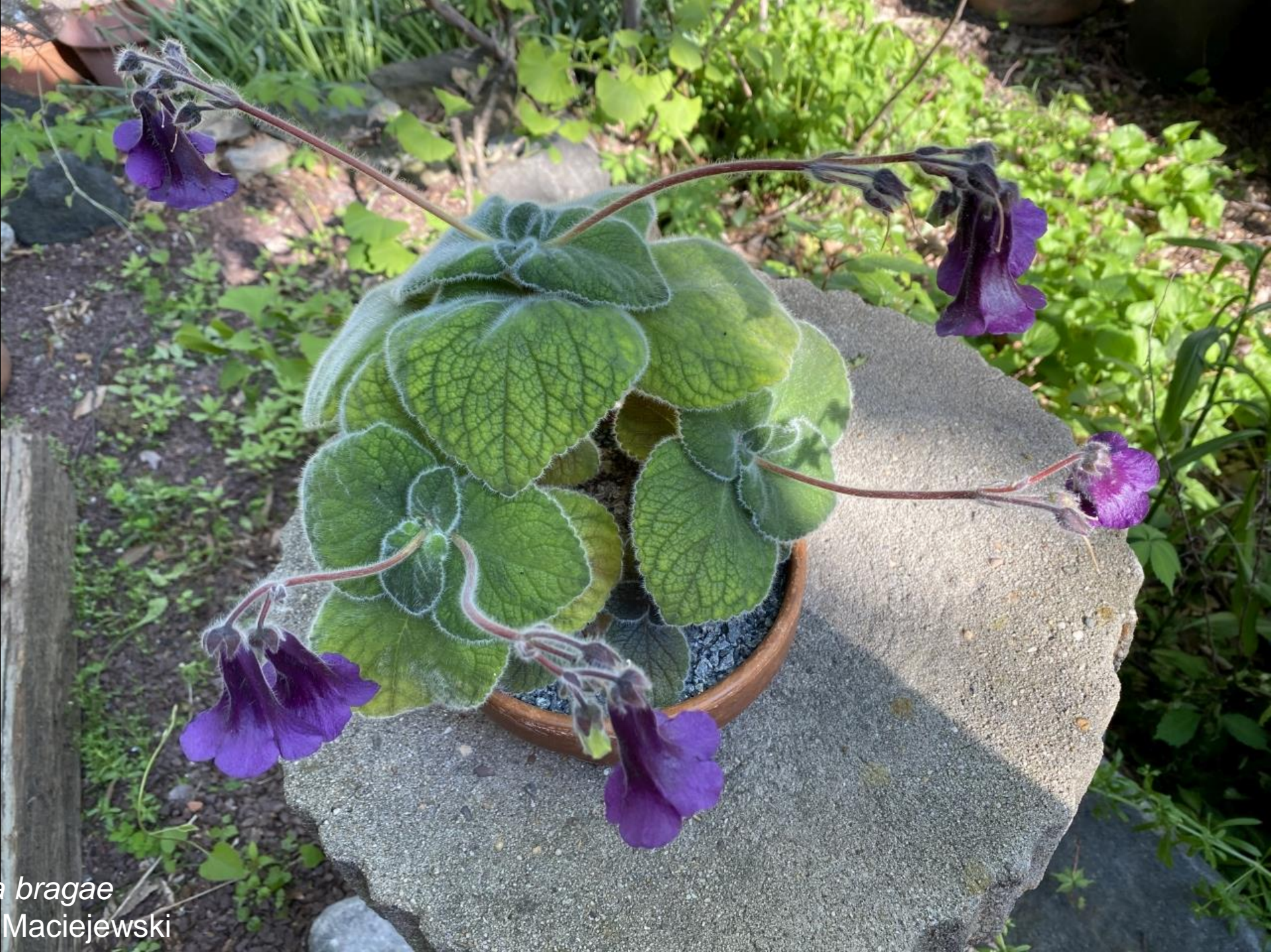
Sinningia braggae