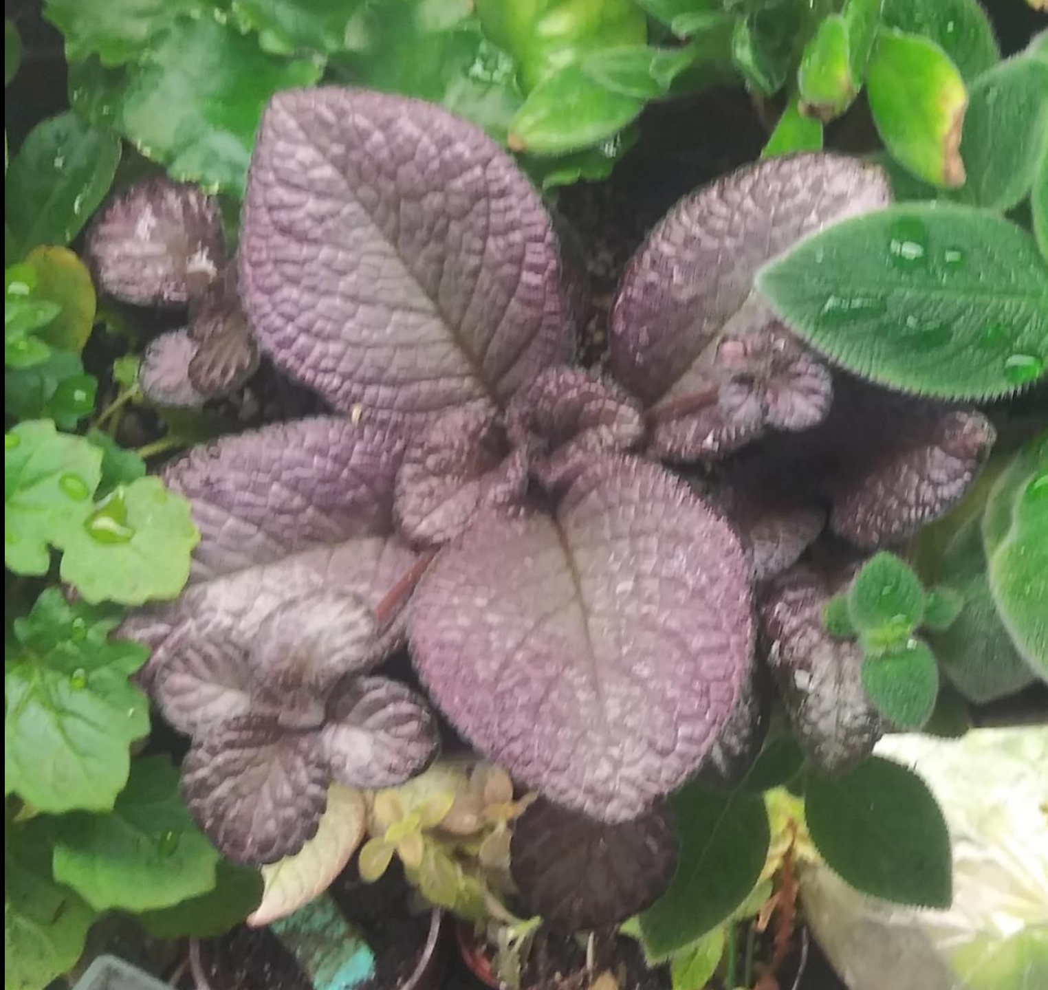
Episcia 'Party Girl' Pam Braun