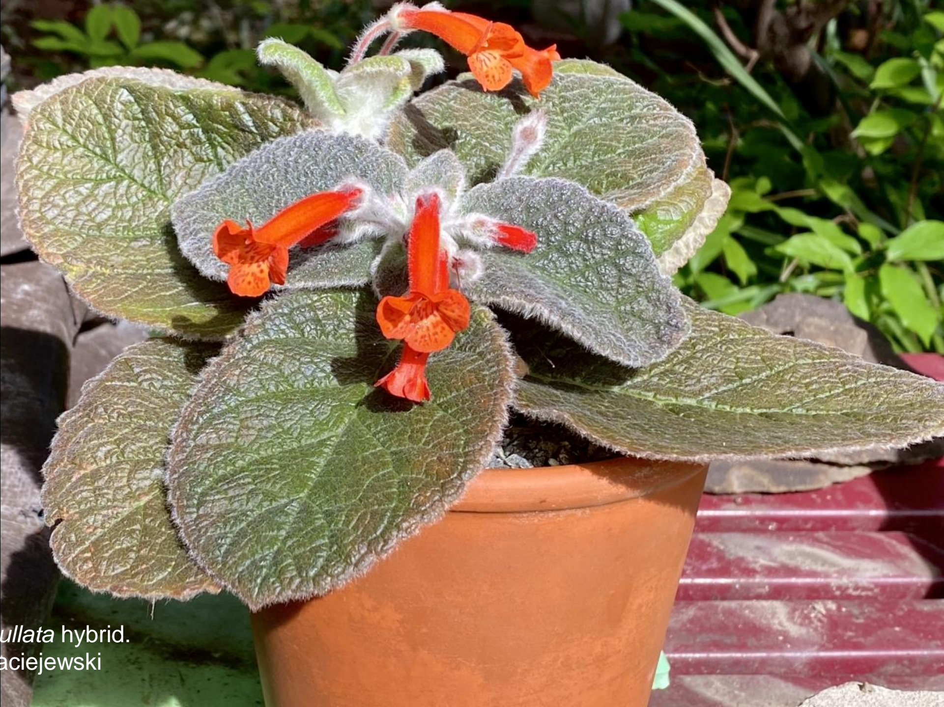
Sinningia bullata hybrid.