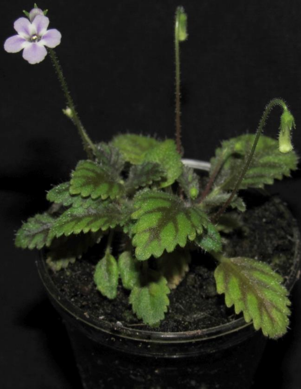
Sinningia muscicola 'Star'