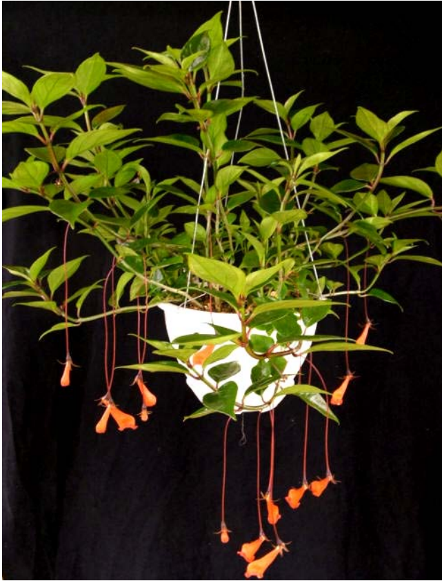
Nematanthus corticola , with peduncles up to 8" long, is the type species of the genus and was first described in 1821.

The group with resupinate flowers includes Nematanthus brasiliensis . It is very showy with large dark red star-shaped calyx accenting the red-striped yellow flowers and is also a large grower. Nematanthus crassifolius has large fiery red flowers which hang from long peduncles. Another large grower in this group is Nematanthus fluminensis . It is a rare species in Brazil and is unusual for its large yellow corollas and different shaped leaves. Nematanthus fissus is usually a more upright grower with long narrow red corolla tubes and was formerly known as Nematanthus selloanus . Nematanthus hirtellus displays attractive bright yellow flowers and very dark maroon calyces. Nematanthus jolyanus has almost the same flower color combination but is even showier. It is one of the exciting new species recently brought into cultivation. Nematanthus striatus is a very floriferous species with many calyces on the plant. Its striped flowers closely resemble those of Nematanthus tessmannii , which was formerly known as Nematanthus perianthomegus . This species was used in several early hybrids including N. 'Tropicana' .