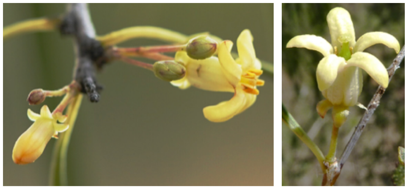
Pittosporum angustifolium : Left: Male flower. Right: Female flower.