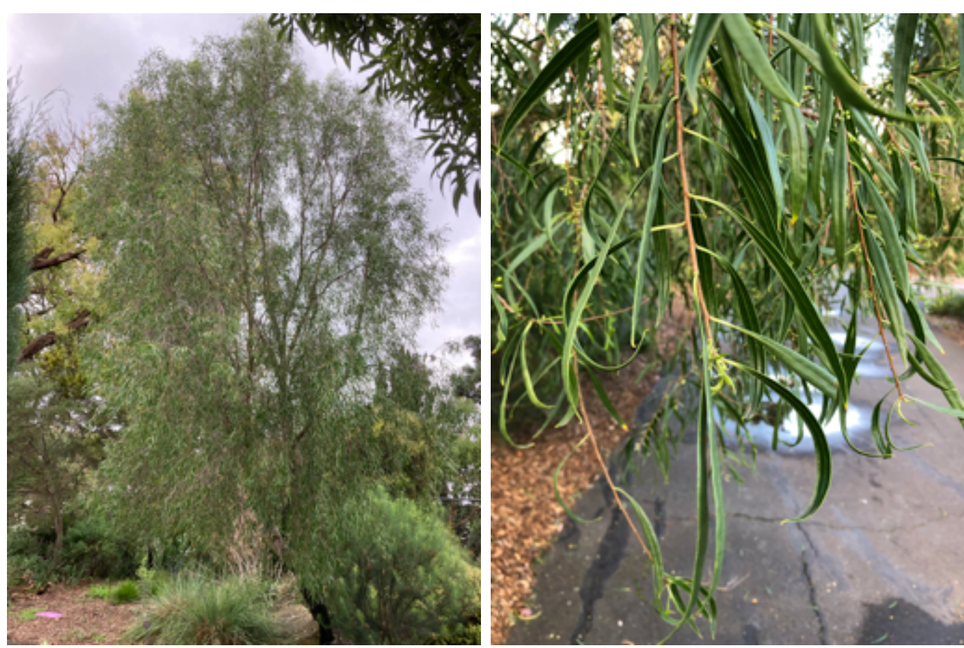
Pittosporum angustifolium in the GBG: Left: Tree. Right, above: Narrow weeping leaves. Right, below: Trunk with rough bark.

flower which become yellow as they age (Cayzer). This tree flowers between winter and spring with the mature fruit persisting over several seasons. The seed is dispersed by the birds.