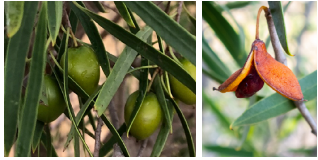
Pittosporum angustifolium : Above left: Unripe fruit. Other two photos: Although the fruit appears to have flesh and is named "Apricot", it is a hard nut. As it matures and dries, it splits to reveal sticky seeds. Above right: Below: