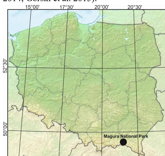
Fig. 1. Location of the Magura National Park.

The Magura National Park is situated in the Beskid Niski range in the Western Carpathians and covers an area of 19438.9 ha (Fig. 1). A major part of the Park is forested, whereas the remaining part is occupied by non-forest vegetation, mainly meadows and pastures (Fig. 2). Especially valuable for occurrence of mosses are sandstone outcrops (Fig. 3). The highest elevation, 846 m above sea level, is Mt Wątkowa. The first information about moss flora from the area of the present Park was published by Waclawska (1957), Karczmarz (1987), Brylska (1991) and Ochyra et al. (1999). The data were summarized by Stebel and Ochyra (2000) in the paper entitled 'The moss flora of the Magura National Park in the Beskid Niski Range (Western Carpathians)'. Since then, several bryological papers have appeared which brought information about several species new to the Magura National Park, for example Hookeria lucens , Lescuraea mutabilis , Niphotrichum elongatum , Orthodicranum tauricum and Orthotrichum stramineum , as well as new data concerning the distribution of some rare mosses of this area (Stebel 2003, 2011; Bednarek-Ochyra et al. 2011; Ochyra et al. 2011; Stebel et al. 2011, 2014; Górski et al. 2015).