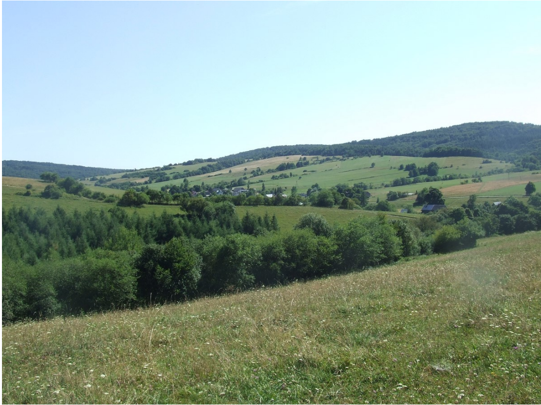
Fig. 2. Magura National Park – view from Mt Suchania (4 August 2014).