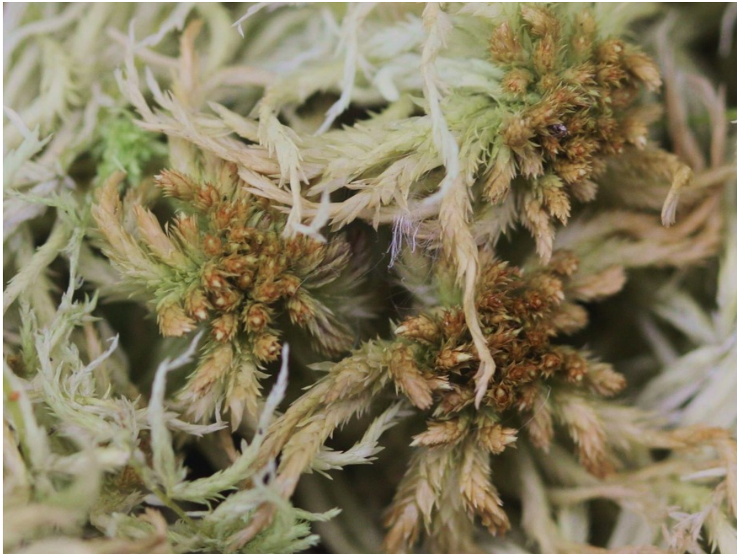
Fig. 4. Sphagnum fallax – very rare bog species in the Magura National Park. (photo by A. Stebel).