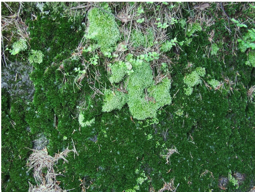
Fig. 5 Leucobryum glaucum (bright turfs) and Campylopus flexuosus (dark turfs) on sandstone in the ‘Diabli Kamień’ sandstone outcrop (photo by A. Stebel, 11 May 2016).