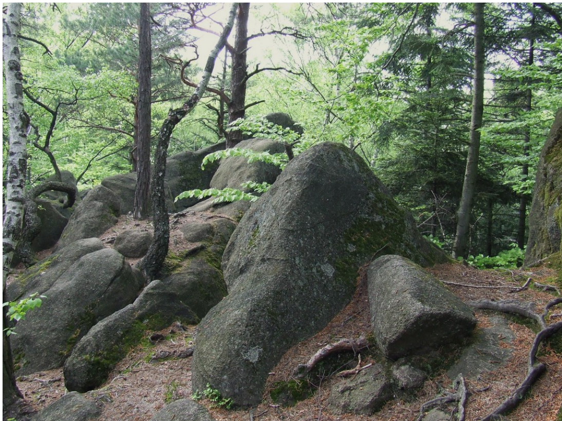
Fig. 3 ‘Diabli Kamień’ sandstone outcrop – place of occurrence of interesting epilithic moss flora.