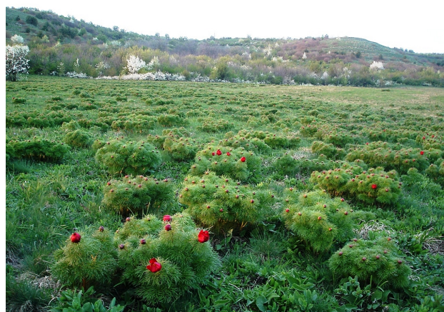
Steppe with spring aspect of Paeonia tenuifolia at Gorna Studena village in the