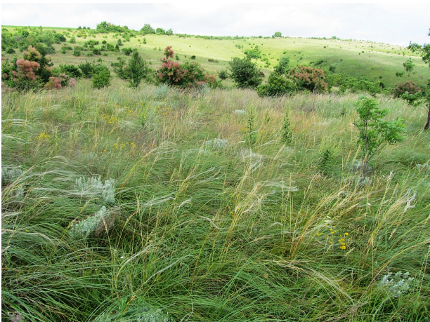
Loess steppe in Nikopol Plateau in the Pleven region, Bulgaria