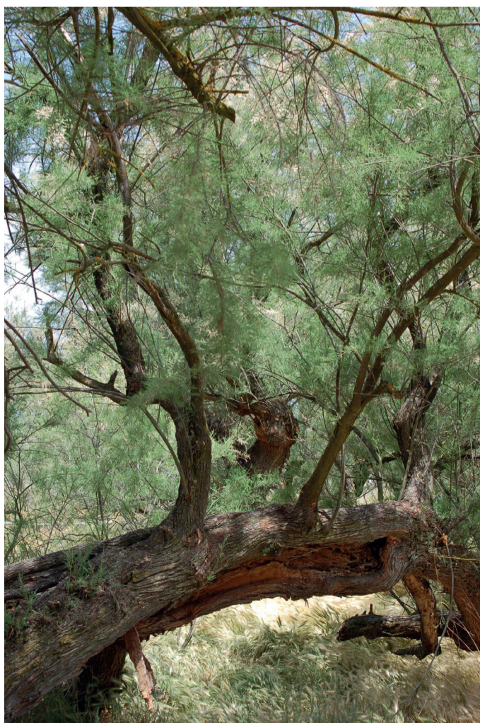
Trunk of old tamarisk hybrid ( Tamarix gallica x canariensis ).

This is an extended summary of the chapter. The full version of this chapter (revised and peer-reviewed) will be published online at https://w3id.org/mtv/FISE-Comm/v01/e011f06 . The purpose of this summary is to provide an accessible dissemination of the related main topics.