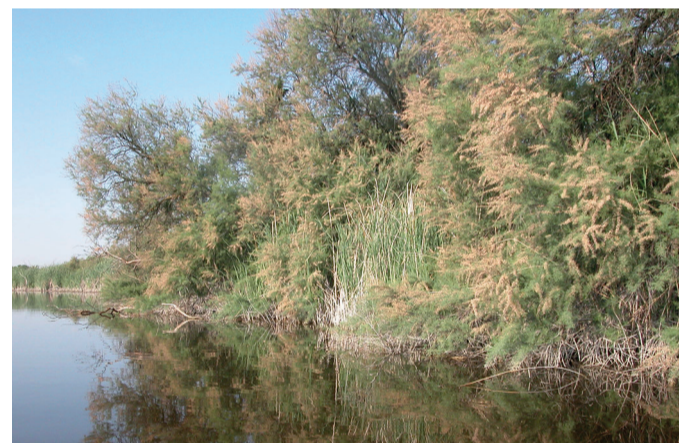
Fluvial vegetation with Canary Islands tamarisk ( Tamarix canariensis ).

Three species of fungi, Botryosphaeria tamaricis , Diplodia tamarascina and Leptosphaeria tamaricis , can form cankers and cause branch dieback on tamarisks. The latania scale ( Hemiberlesia lataniae ) and oystershell scales ( Lepidosaphes ulmi ) are two insects which frequently infest these species 20 . Some species, principally salt cedar ( Tamarix ramosissima ) Chinese tamarisk ( Tamarix chinensis ), small-flower tamarisk, French tamarisk and their hybrids, are considered as invasive weeds in the United States, and have been the target of many control programmes since the 1960s 21 .