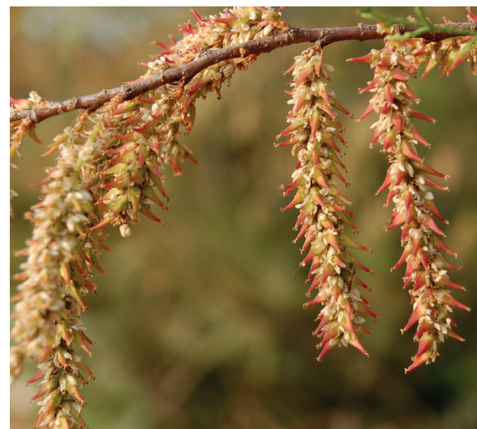
Reddish-orange inflorescences of the African tamarisk ( Tamarix africana ).

They also have other important properties, being classified as medicinal plants. The galls and bark are used as astringent. Many species, such as the French tamarisk, also have tonic, diuretic, stimulant and stomachic action 17 . They are also used for tanning and dyeing purposes 5, 18, 19 . Some tamarisks are melliferous and are used as a sugar substitute 5 .