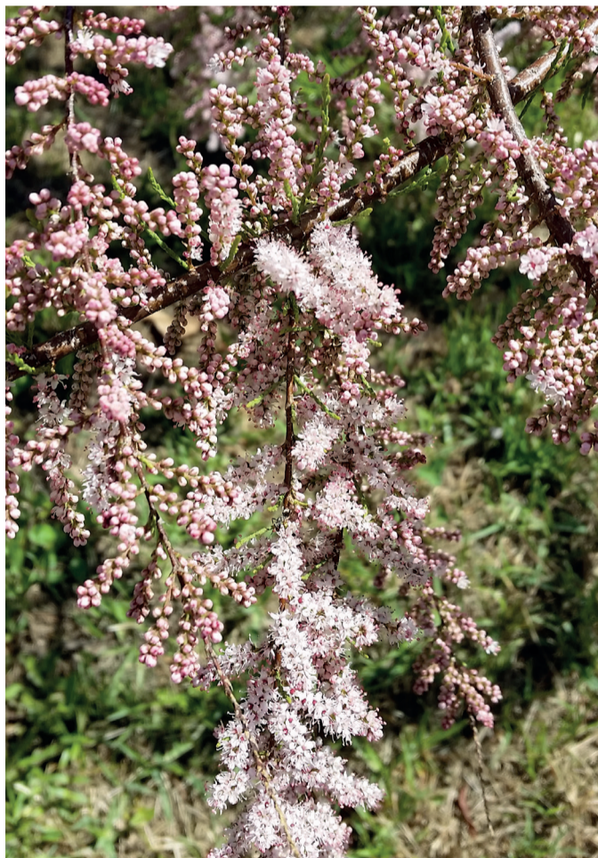
Pink flowers of an ornamental French tamarisk ( Tamarix gallica ) in a garden.

waterways and on sandy floodplains, especially where their roots can access underground water 9 . They grow best in alkaline soils, but also tolerate acidity 12 . These plants are found on non-rocky silt loams and clay loams of high organic matter along streams, bottomlands, pond margins, banks of drainages and washes and other wet environments in arid and semiarid regions 13, 14 . Tamarisks are not shade-tolerant 14 .