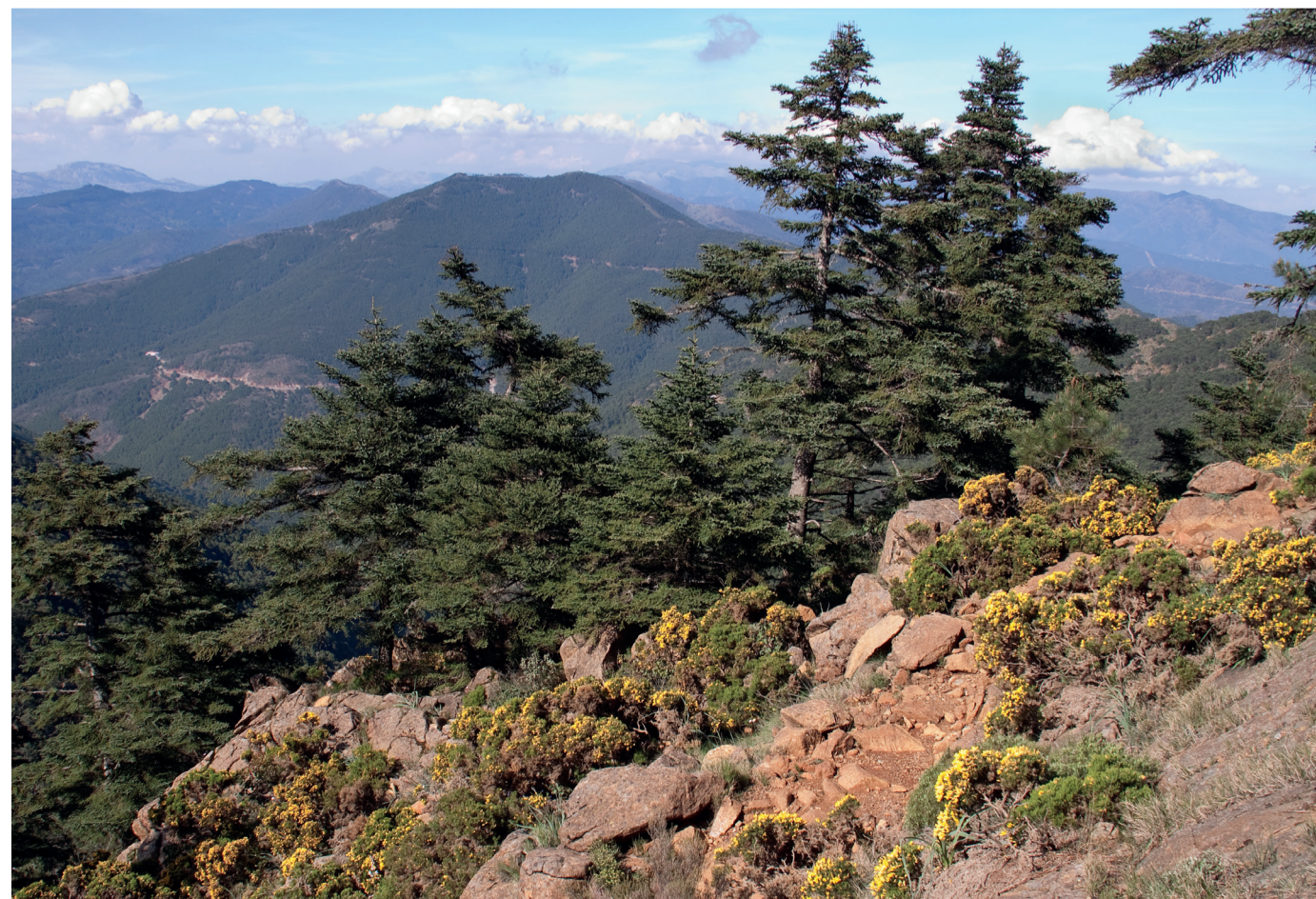
••• Forest of Spanish firs ( Abies pinsapo var. pinsapo) in Sierra Bermeja (South Spain).

The isolation of populations due to fragmentation could give rise to a low genetic flow and therefore genetic diversity, which may represent another important factor weakening populations