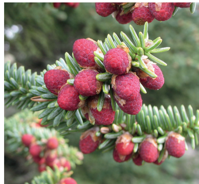
Reddish pollen cones of Spanish fir ( Abies pinsapo var. pinsapo ).

interest and due to the threats, endemism and geographically scattered distribution, their preservation as genetic resources is a major challenge. Diverse genetic conservation strategies have been elaborated, complementing the protection of natural stands (national or local parks and reserve) with the conservation of genetic resources outside their natural habitats (plantations, orchards and conservation of genetic material in vitro and with cryopreservation 30, 31 ). Southern fir populations deserve special attention under global warming conditions, particularly in regard to their genetic characters, which may be relevant for future adaptation processes of firs 30 .