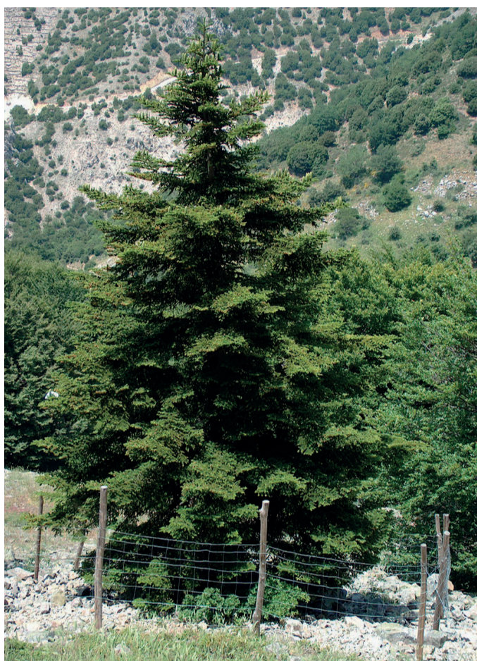
••• The total Sicilian fir ( Abies nebrodensis ) population counts 24 mature trees which are protected by fences.

accidental fires represent the major cause of forest loss. Firs are particularly sensitive to excessive ( anthropogenic ) fire disturbance, which is pervasive in most Mediterranean areas. When severe, wild fires can destroy entire stands and degrade the habitat, making it less suitable for firs, so that post-fire regeneration is not always guaranteed 12, 16, 34-37 . Goat and cattle grazing activity can be particularly destructive when intensive, damaging seedlings and young shoots of juvenile plants and limiting forest regeneration. Now in most fir forests pasturing continues under control, but in some isolated A. cilicica stands livestock grazing is still one of the main threats 13, 18, 33 . Forests degraded by fire and grazing activity are more susceptible to pathogens. A. pinsapo has seen an increase in attacks of the root rot fungus Heterobasidion spp. and the coleopteran Cryphalus numidicus in recent decades, especially in drought periods 34, 38, 39 .