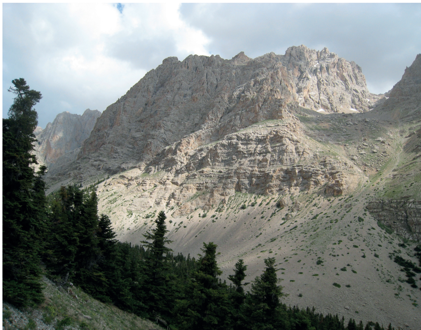
••• Syrian fir forest ( Abies cilicica ) in Western Taurus Mountains (South Turkey).

and making them more susceptible to diseases. This is the case for A. nebrodensis , which is currently one of the rarest conifer species in the world, counting a population of just 24 mature trees 14 . This fir is under an extensive conservation programme locally and abroad for its protection. However, it has not yet been entirely successful, due to the harsh summer conditions and the depleted soil of native areas. New attempts have been planned with the use of compost and summer watering 40 .