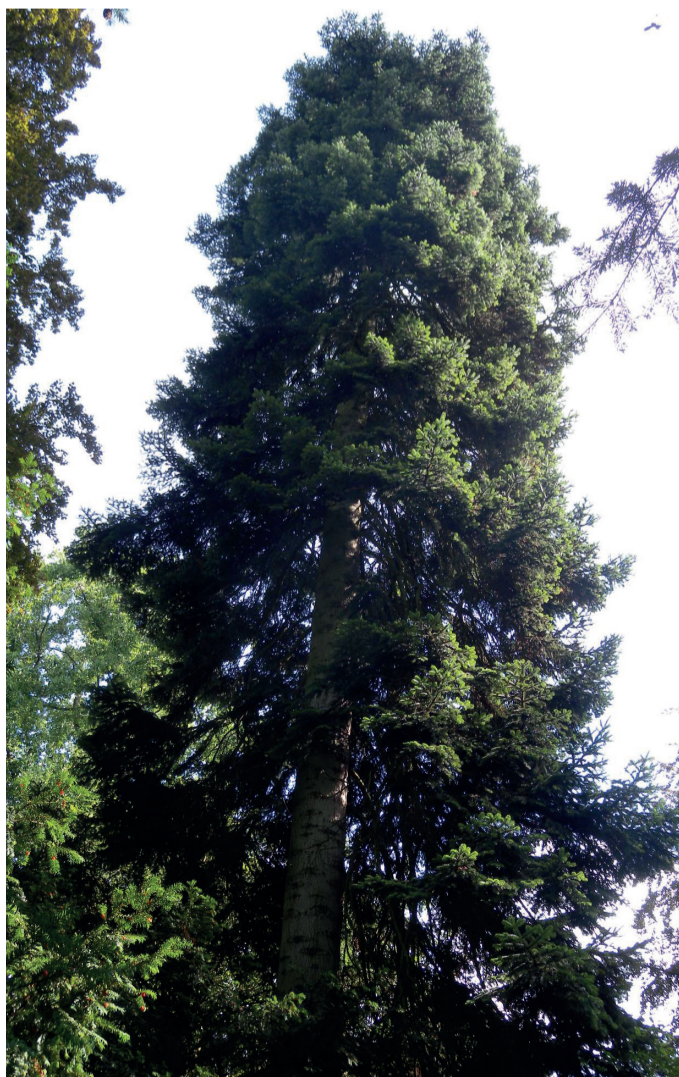
Caucasian fir ( Abies nordmanniana ) is one of the tallest European trees, growing over 60 m tall.