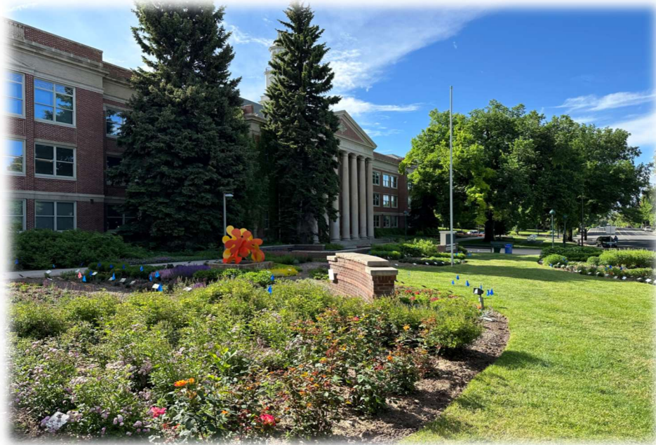
Photo of CSU Perennial Trial Gardens.

All planting beds were raked clean of old mulch, dead plant material, and weeds prior to the application of a granular fertilizer. Osmocote 17-6-12 was used at a rate of 150g per row. Empty rows were then tilled and leveled to increase uniformity.