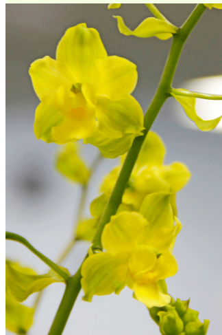
Cyrtopodium polyphyllum by Tin Ly

Please take advantage of Chuck being among us and approach him. There is so much to learn about our native orchid species. (Paul Gumos)