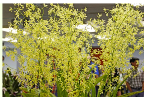
E. x profuse (natural hybrid) Roderick Lewis