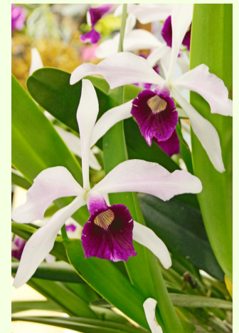
Laelia purpurata Linda Dawkins