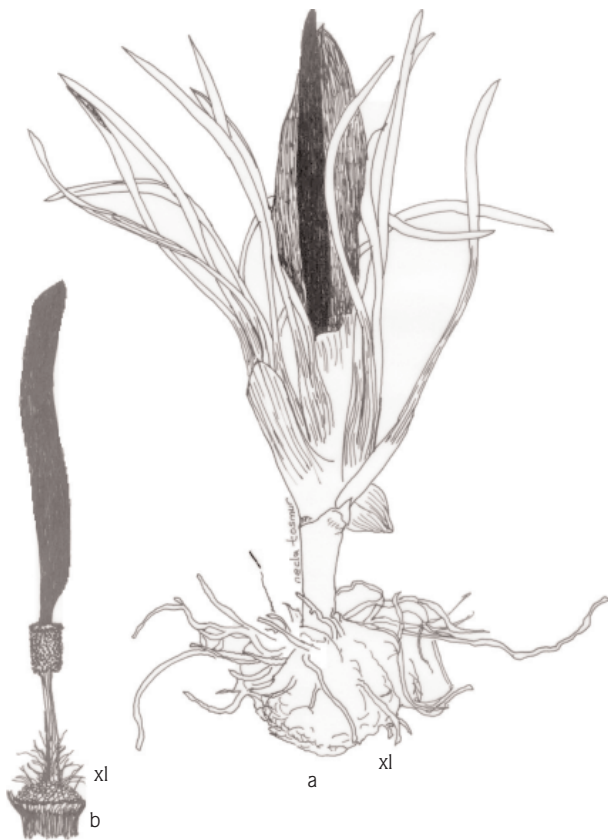
Figure 3. Biarum syriacum ; a) habitus, b) spathe, with base of spadix exposed.

The whole plant is 20-40 cm. Tuber is dorso-ventrally compressed-discoid, 1.5-4.5 × 2-5 cm, light to dark brown. Leaves 13-27, proteranthous, long-petiolate, the bases encased by 3-6 ligulate, 6.5-16 × 1.5-3 cm, sub-fleshy, later papery, whitish cataphylls and 2-3 ligulate, 6.5-9 × 1-1.5 cm, fibrous brown cataphylls. Petiole 9-15 × 1-1.8 cm, abaxial surface channelled distally, expanded into a membranous wing proximally, mid to dark green. Leaf lamina linear to linear-elliptic, the first few leaves emerging spatulate, 11-21 cm × 5-12 mm, apex acute, base long-decurrent to cuneate, 3-7 primary lateral veins per side, margins smooth to undulate, lamina mid to dark green, rarely somewhat glaucous abaxially. Inflorescence appearing in spring. Peduncle 6-11 cm × 3-6 mm, dirty white, emerging from amidst the foliage. Spathe 12-18 cm long. Spathe limb elliptic to lanceolate-elliptic, 9-14 × 3-6 cm, exterior green, heavily stained deep purple, interior deep purple. Spathe tube oblong, sub-cylindrical, moderately inflated, 4.5-7 × 1.5-1.8 cm, margins fully connate, exterior dirty white, stained purple around the