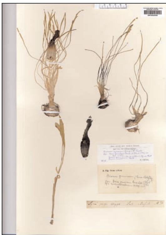
Figure 1. Type specimen of Biarum syriacum (BM000848535).

Biarum syriacum (Spreng.) H.Riedl in Aroideana 3(1): 19 (1980). Type: (Syria) prope Aleppo, Russell s.n. (holotype BM, photo!) (Figures 1-4).