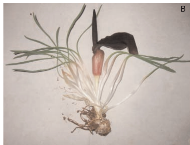
Figures 2.A and B. A view of Biarum syriacum from the field, Gaziantep, Turkey.