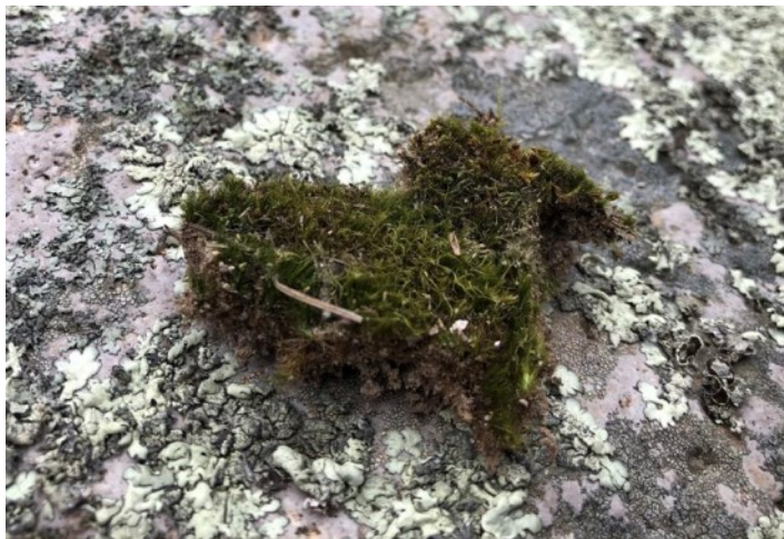
Campylopus tallulensis. This photo is not in situ, the plant was found under a large boulder.

Ptychomitrium sinense * (Mitt.) A. Jaeg.