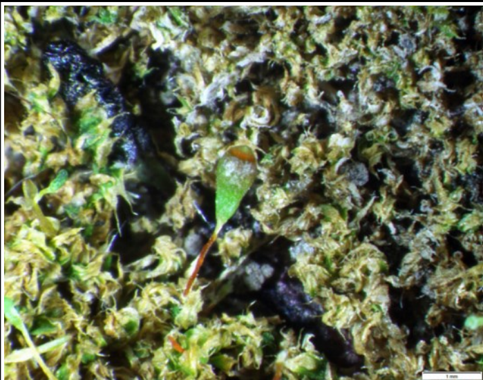
Entosthodon rubrisetus .