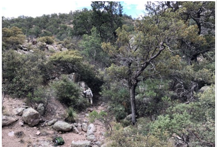
Campylopus tallulensis habitat. The plant was found under the large boulder just past the backpack.