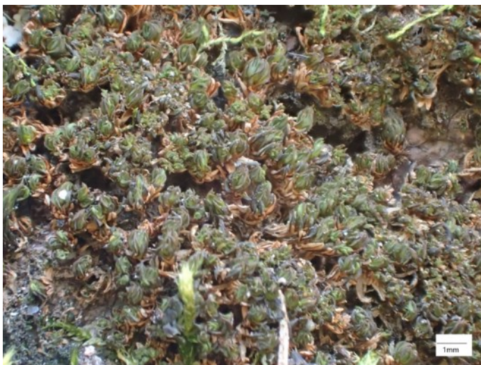
Syntrichia ammonsiana in situ on north facing rock outcrop.