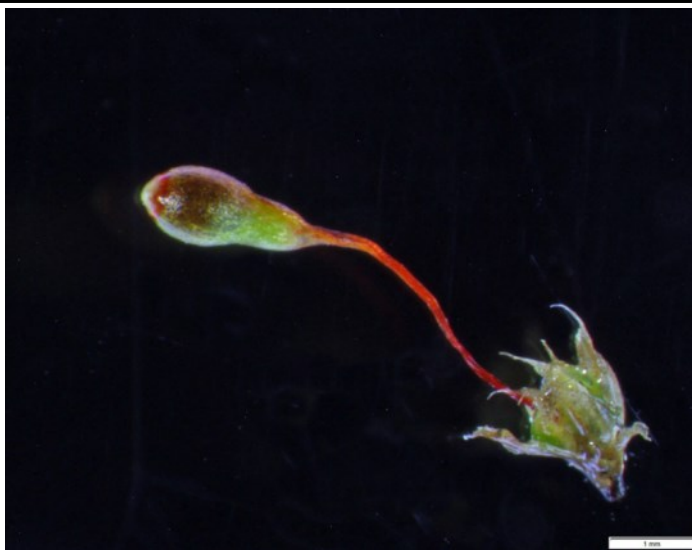
Close up of Entosthodon rubrisetus .