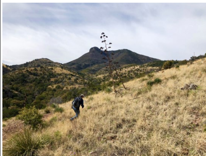
Habitat photo for both Entosthodon rubrisetus and E. sonora . Both species were found under small rocks within grassland.