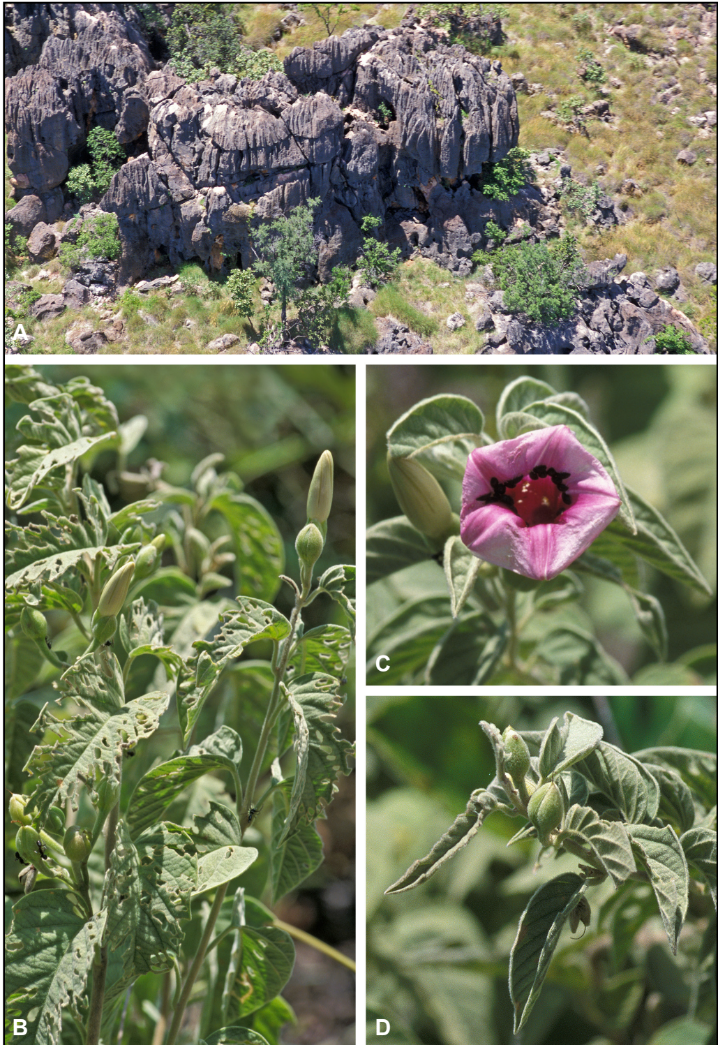
Figure 2. Ipomoea johnsoniana . A – habitat at type location; B – branches in bud (note leaves have been extensively chewed by insects); C – flower (note many beetles inside consuming anthers); D – fruit and leaves. Images from R.L. Barrett, T. Handasyde & A.N. Start RLB 2186 A.