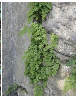
12 Adiantum raddianum PTERIDACEAE