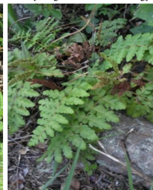
4 Anemia villosa ANEMIACEAE