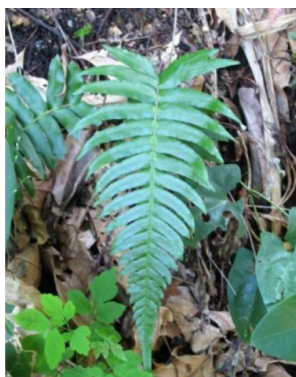
6 Blechnum occidentale BLECHNACEAE