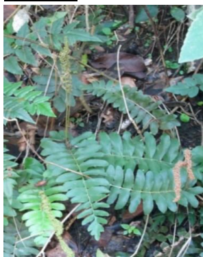
1 Anemia collina ANEMIACEAE