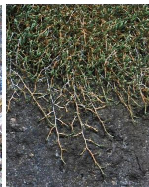
19 Selaginella sellowii SELAGINELLACEAE