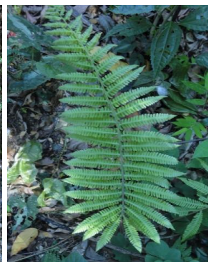
8 Ctenitis falciculata DRYOPTERIDACEAE