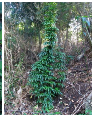
9 Lygodium volubile LYGODIACEAE