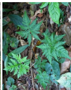
13 Doryopteris concolor PTERIDACEAE