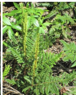
3 Anemia tomentosa var. anthriscifolia ANEMIACEAE