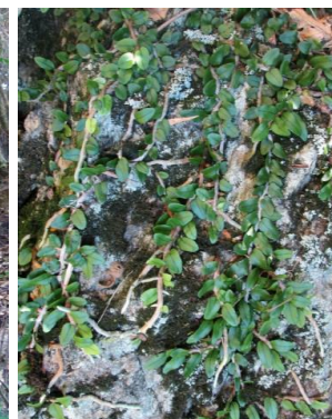
10 Microgramma vacciniifolia POLYPODIACEAE