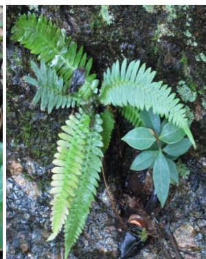
7 Blechnum polypodioides BLECHNACEAE