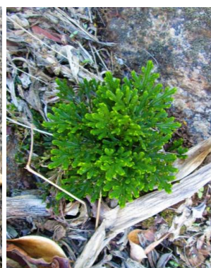
18 Selaginella convoluta SELAGINELLACEAE