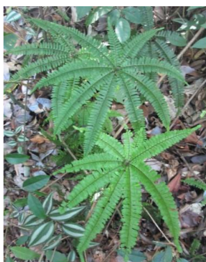
11 Adiantopsis radiata PTERIDACEAE