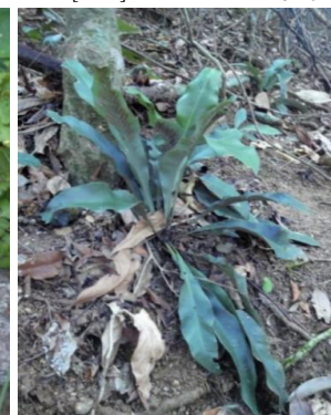
5 Asplenium brasiliense ASPENIACEAE