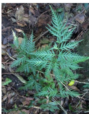
16 Pteris leptophylla PTERIDACEAE