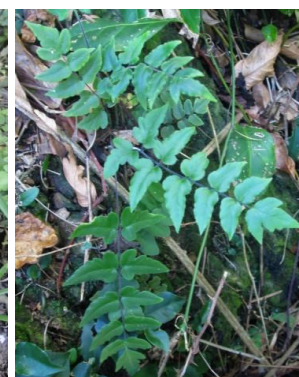
15 Hemionitis tomentosa PTERIDACEAE