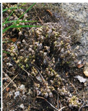
17 Selaginella convoluta SELAGINELLACEAE