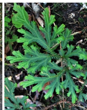
20 Selaginella sulcata SELAGINELLACEAE