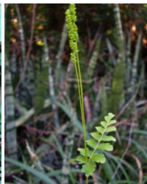
2 Anemia hirsuta ANEMIACEAE