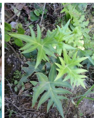
14 Doryopteris collina PTERIDACEAE