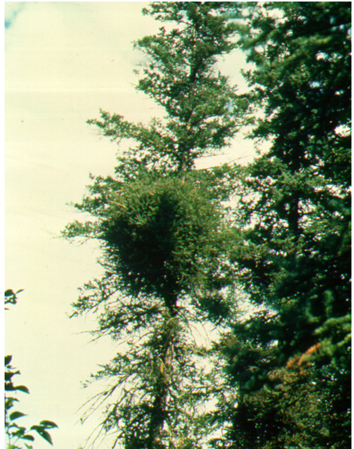
Multiple infections of true mistletoe.

For removal in lightly infested trees, infected limbs should be pruned at the nearest crotch. Heavily infested trees should be removed and replaced with trees that are not hosts. Completely removing dwarf mistletoe from a stand of trees results in control for many years since new introductions will spread very slowly. Lightly to moderately infested mature trees in which less than 50% of the limbs are infected may survive for decades. However, it is important not to plant susceptible trees under infected trees.