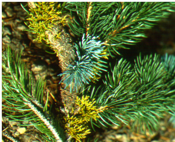
Leafless aerial shoots of dwarf mistletoe on spruce.