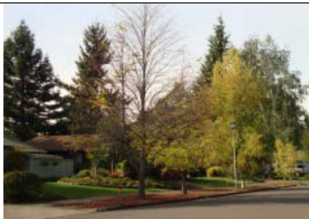
Katsura Tree, Cercidphyllum japonicum 5355 Verda Lane NE Spring new growth, fall color.