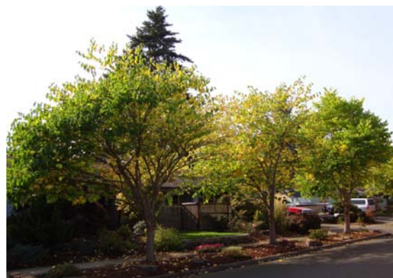
Eastern Redbud, Cercis Canadensis , 5353 Verda Lane, 5291 Arcade, and 5451 Kafir Drive NE. Spring flowers.