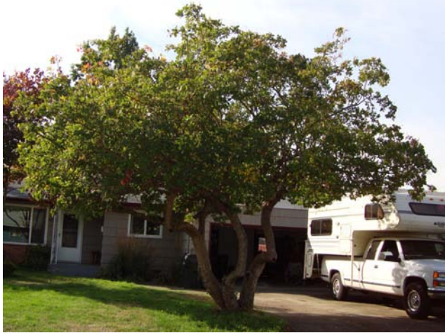
Smoke Tree, Cotinus coggygia , 4687 Rivercrest Street N Spring flowers, summer "seeds", fall color.