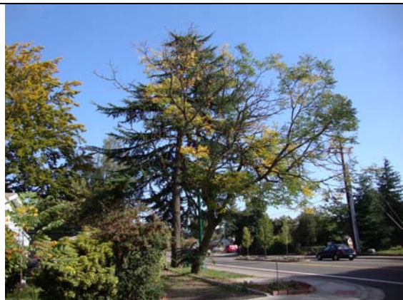
Kentucky Coffee Tree, Gymnocladus dioicus Rainbow Court @ Chemawa Road NE Uncommon, fall color.