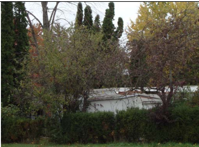
Ferrill's Crimson Flowering Crabapple, Malus 'Ferrill's Crimson' Rainbow Court, Chemawa Road NE (Locally developed and selected by Ed Ferrill, Ferrill's Nursery, Keizer, probably before 1960; not best flowering crabapple, flowers attractive)