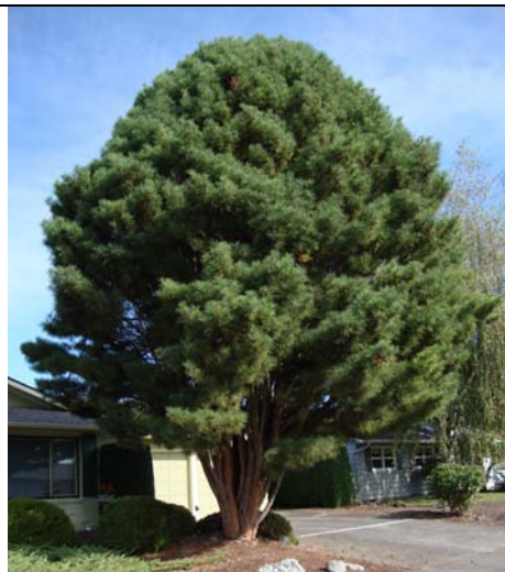
Tanyosyo Pine, Pinus densiflora 'Umbraculifera' 5394 Verda Lane NE. Interesting structure, colorful bark.

Pacific Dogwood, Cornus nuttallii 997 Dearborn, also on corner of Arcade & Kalmia. Spring & fall flowers, fall color.