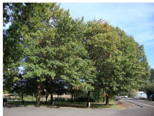
Pin Oak, Quercus palustris , Claggett Creek Park south end along Dearborn. Fine specimens, fall color.