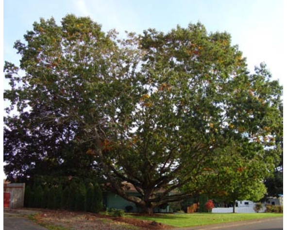
Northern Red Oak, Quercus rubra , corner Ventura Street N & Shoreline Drive N Large, beautiful form, fall color.