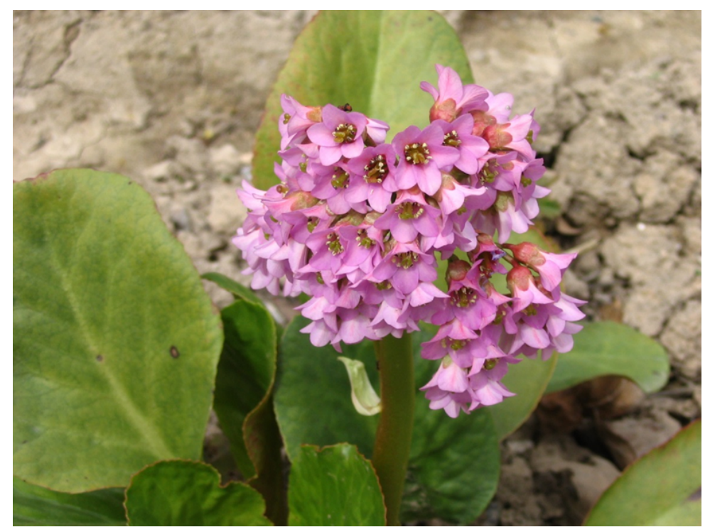
Figure 4. Flowers of Bergenia ugamica V.N. Pavlov