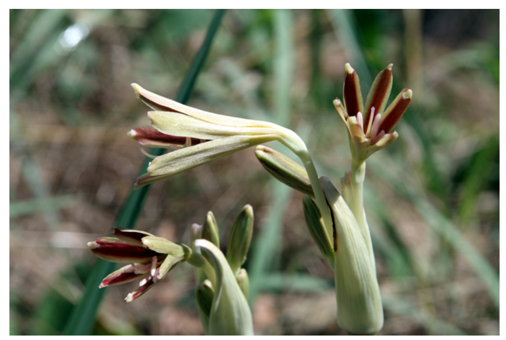
Figure 5. Flowers of Ungernia victoris Vved.

still using baked bulbs and fresh leaves for the disinfection of wounds. Local people are also still making glue from bulbs. All parts of U. victoris contain alkaloids (leaves-0,33%-1%; bulbs 0,8%-0,9%, especially galantamin 0,7%-1%, licorin 0,073%, gordenin 0.039%, tatecin 0,1%, pankratin 0,15%, narvedin 0,0054%). The maximum concentration of alkaloids in U. victoris can be found in early spring. This plant also contains cumarin (0,09%), essential oils 0,12%, resins 6%, pectin 4,9%, mucus 7%, sugars 6,1% and organic acids 8,91% (Khojimatov et al. 2009). The leaves and bulbs of the plant are now used as an industrial source of the alkaloid galantamin, which is widely used in allopathic medicine for treatment of poliomyelitis and polyneuritis.