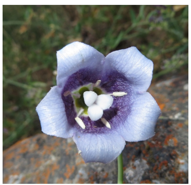
Figure 7. Flower of Codonopsis clematidea (Schrenk) C.B. Clarke