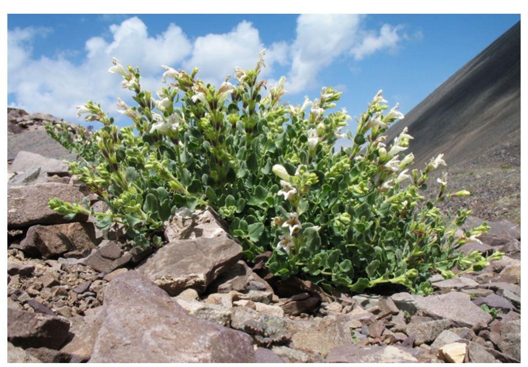
Figure 9. Dracocephalum komarovii Lipsky

In order to standardize the available ethnobotanical information, the Institute of Botany (Tashkent) has developed a database containing detailed information for each plant, e.g. scientific names (accepted name and, when necessary, main synonyms), common name used in literature, and any other names commonly in use, geographical distribution, morphological description, healing properties, traditional medicinal usage and known adverse effects, information on scientifically proven