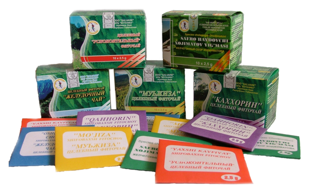
Figure 8. Species cholagogae Chodjimatovii