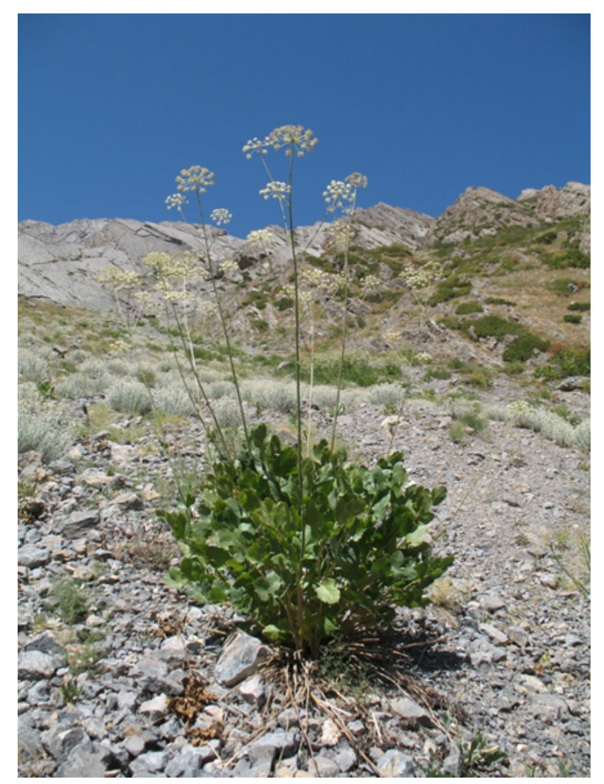
Figure 6. Mediasia macrophylla (Regel & Schmalh.) Pimenov