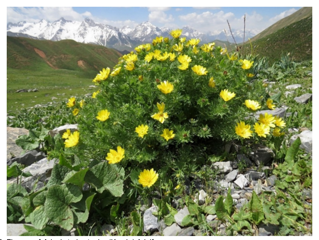
Figure 3. Flowers of Adonis turkestanica (Korsh.) Adolf.

collected during our investigation, it was found that Bergenia ugamica (Figure 4) contains substances with immuno-stimulating activity, confirming the oral information of participants, who indicated that the root of Badan ( B. ugamica ) make the human body stronger to defend against diseases.