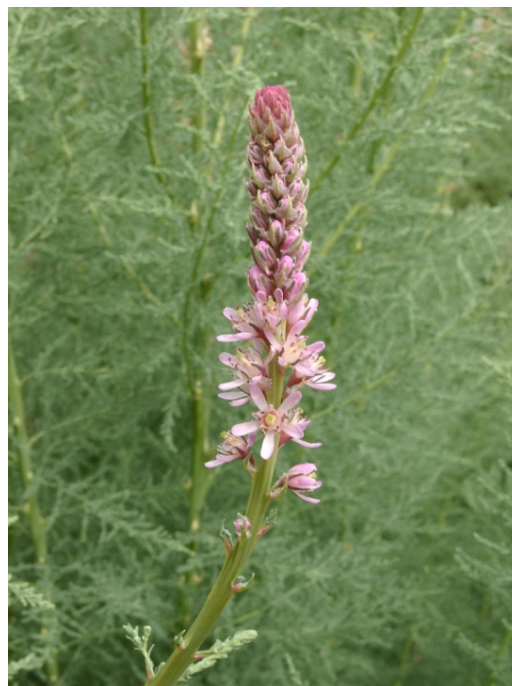
Photo 3. Blooming of terminal shoot of Myricaria bracteata (July).