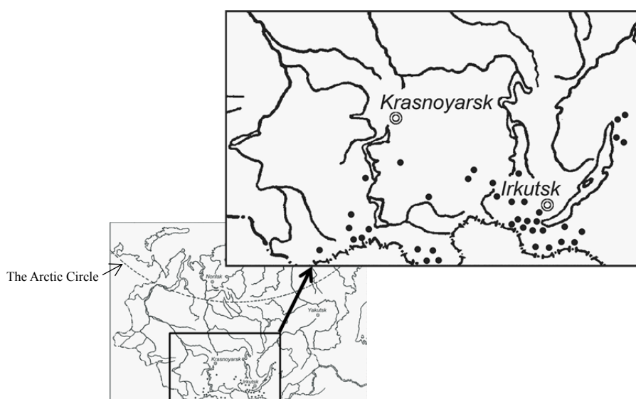
Fig. 2. The area of Myricaria longifolia in Central and Eastern Siberia.