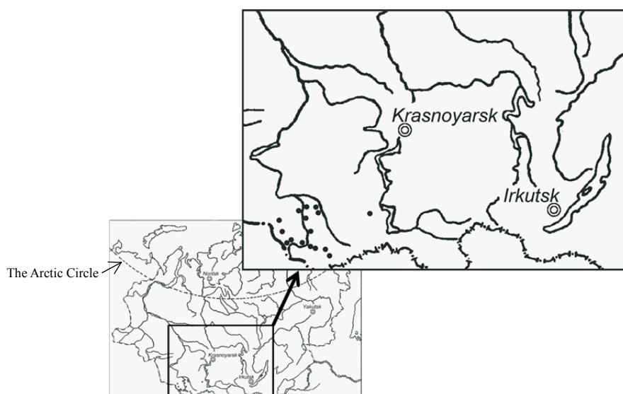
Fig. 1. The area of Myricaria bracteata in Western Siberia.

The author collected plants in the southern Siberia: in the Altay Mountains, Tyva, Pribaikalye and Zabaikalye during expeditions from 1990 to 2006. Also we collected seeds and cuttings of species of Myricaria and grew up them in the nursery of the Laboratory of Dendrology, SB CSBG RAS.