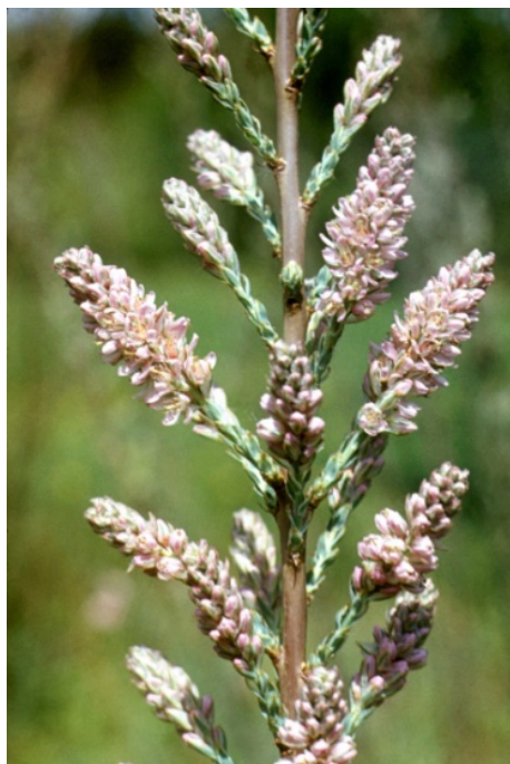
Photo 2. Blooming of lateral shoots of Myricaria bracteata (June).