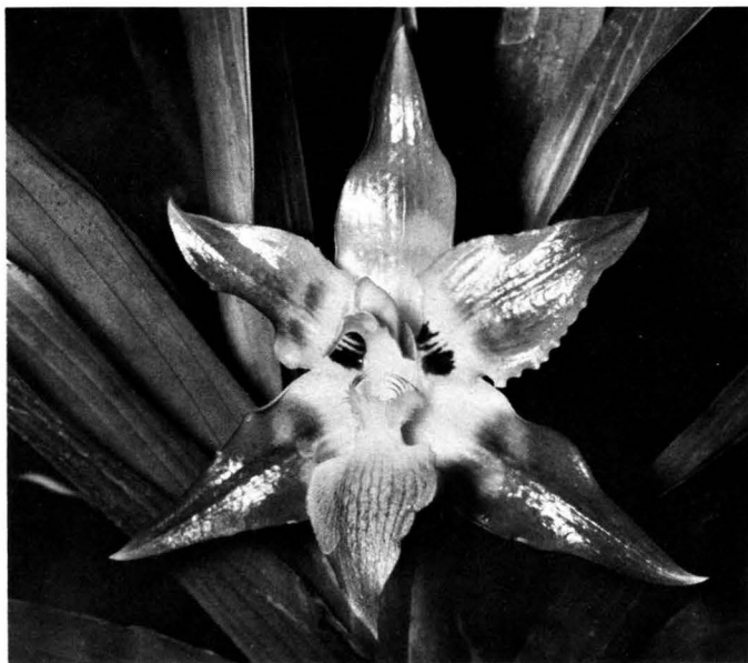
Huntleya wallisii (Rchb.f.) Fowl., comb. nov. , from a plant collected at Jardines Quebrada, 37 km. E. of Nariño, elev. 4,300 ft., Caldas, COLOMBIA FH64C52.

This species is closely related to Huntleya brevis Schlechter from Colombia from which it differs in the much longer floral peduncles, color pattern and larger, differently shaped flowers. From Huntleya lucida (Rolfe) Rolfe it is distinguished by its gently recurved apex of the labellum (not abruptly upturned at the apex as in that species), and by its petals being narrower in width than the dorsal sepal (not broader as in the latter species). Although H. lucida (Rolfe) Rolfe is cross-banded it does not reach the high degree of ornateness present in the described species. Huntleya burtii has a much broader labellum, greatly