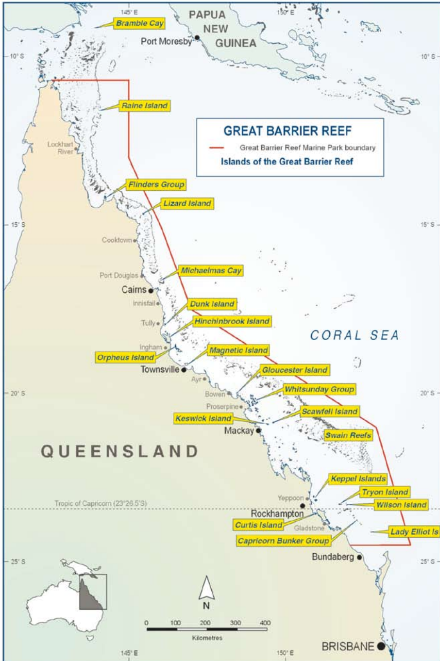
Figure 20.1 Map of the GBR region indicating key islands and their locations