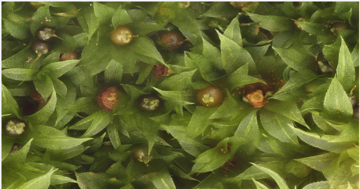
This example of Aphanorhegma serratum , a species endemic to eastern North America (and found on UConn's main campus) shows both stages of the moss life cycle, with the circular structures representing the reproductive stage along with the more familiar gametophyte stage.

Mosses are also adapted to changeable conditions, whereas very few flowering plants can survive without roots and rely solely on rain or even moisture supplied only by fog not only to water them but also to “feed” them, Goffinet says.