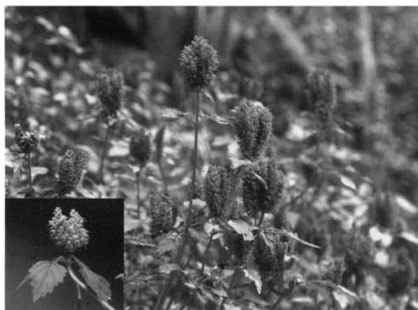
Fig. 3. Photograph of Elsholtzia splendens var. fasciflora taken on 27 Oct. 2009 in Jungmun-dong, Seogwipo-si, Jeju-do.

27 October 2009, Chung M.S. & Chung Y.S. 0910101 (EWH)