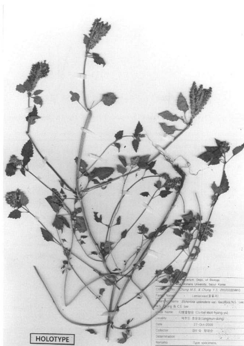
Fig. 1. Holotype of Elsholtzia splendens var. fasciflora (Lamiaceae).

Holotype: KOREA. Jeju-do, Seogwipo-si, Jungmun-dong,