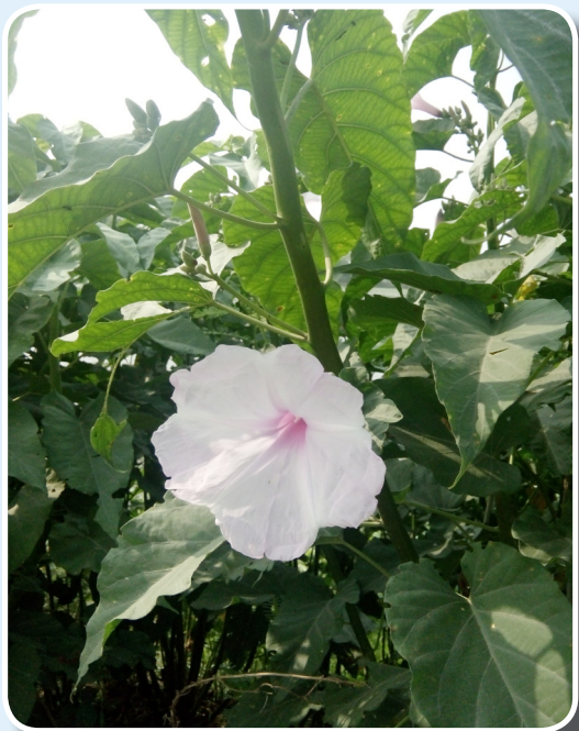
Ipomoea carnea subsp. fistulosa