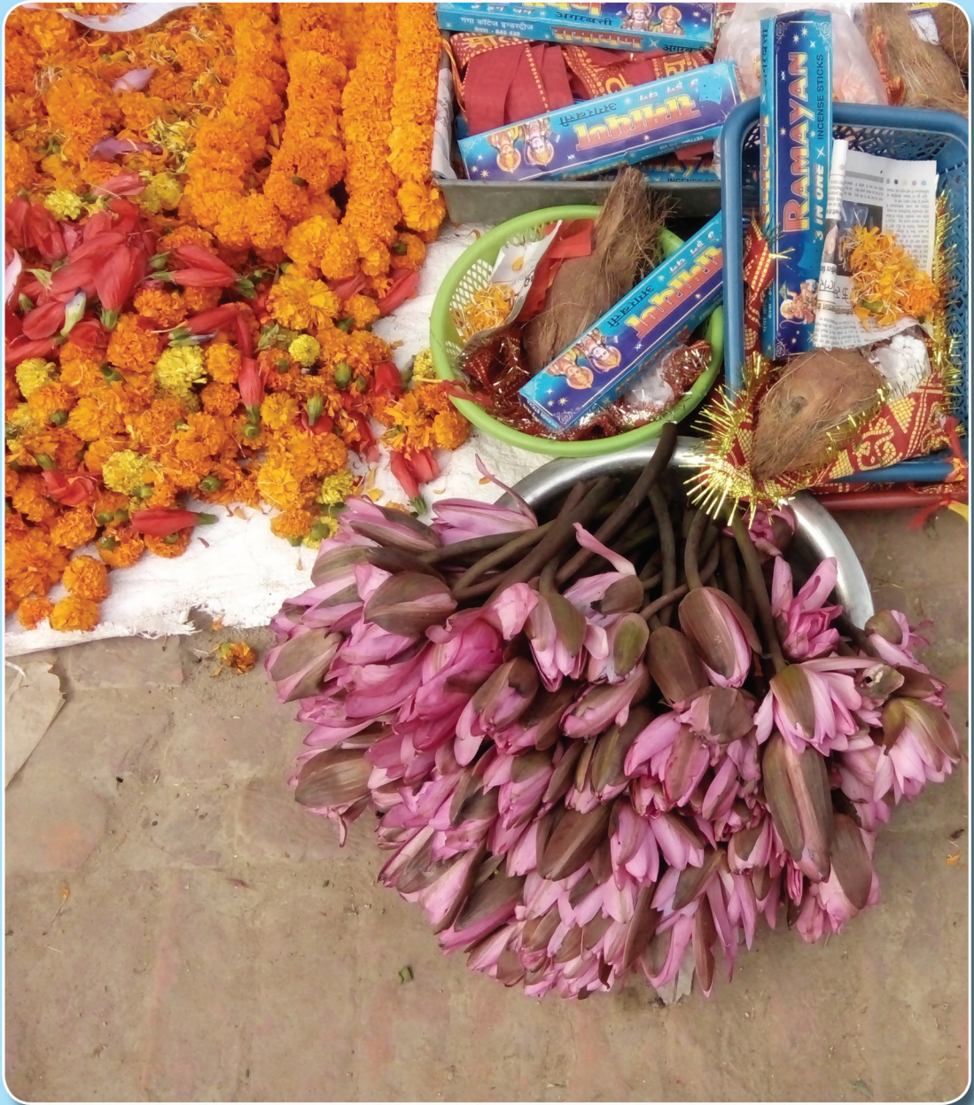
Flower of Nelumbo nucifera for selling in local market at Gadimai Bara