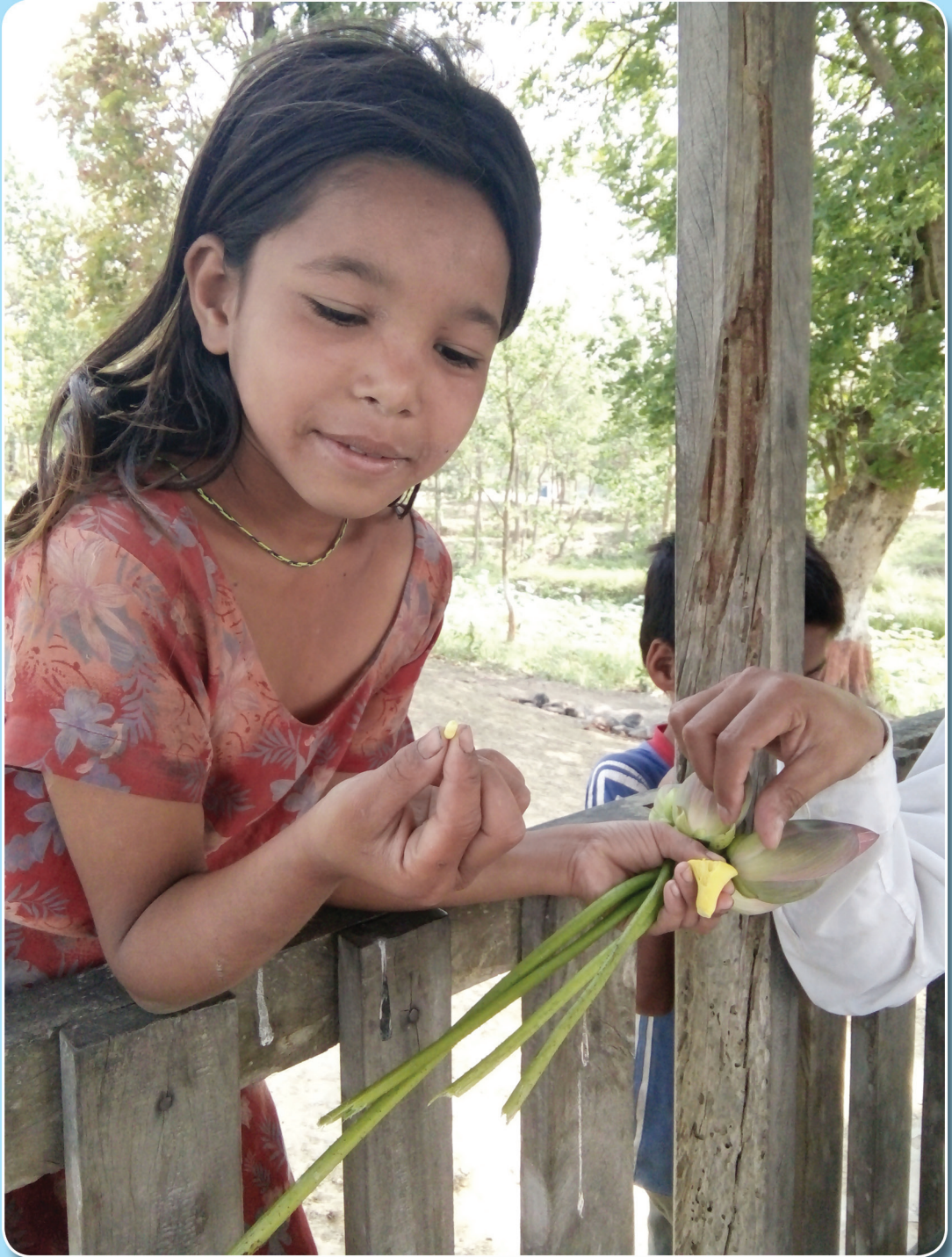
Girl eating the seed of Nelumbo nucifera in Gaidahawa, Rupandehi