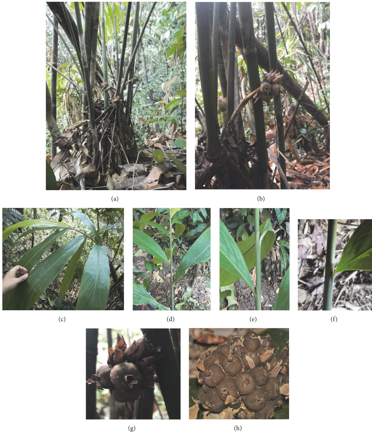
FIGURE 2: Amomum bungoensis Aimi Syazana & Meekiong. (a) Plant with stilt roots; (b) inflorescence; (c) and (d) slightly corrugate leaves; (e) and (f) ligule; (g) fruits; (h) fruits of Amomum durum .

green, adaxial dark green with slightly corrugated. Petiole sessile or very short, c. 2–3 mm long, ligule bi-lobed, longer than petiole, c. 5–8 mm long, green with black at the margin. Inflorescence from rhizome or root-stock, imbricate type, inflorescence 5–10 cm long, or longer, head c. 2–4 cm diam., flower bracts greenish cream, boat shape, c. 2.5 cm; sericea; peduncle up to 5–10 cm long, pubescent. Flower orange; petals boat shape, translucent with orange dots, apex obtuse,