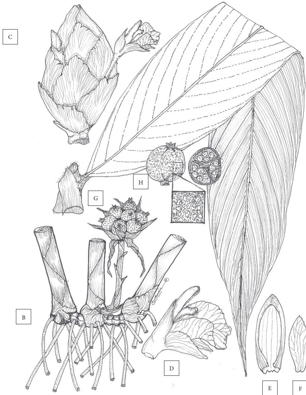
FIGURE 1: Amomum bungoensis Aimi Syazana & Meekiong, sp. nov. A: part of leafy shoot; B: rhizome and stilt root; C: head of inflorescence and flower; D: labellum; E: bract; F: side lobe; G: infructescence; H: fruit [Drawing by Meekiong K.].