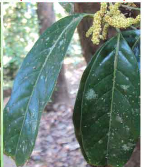
Jyeshta ( Aporosa cardiosperma )