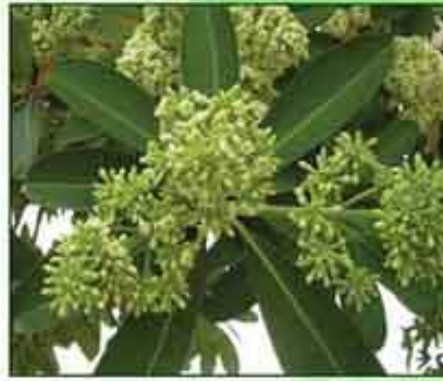
Vrishabha (Taurus) ( Alstonia scholaris )