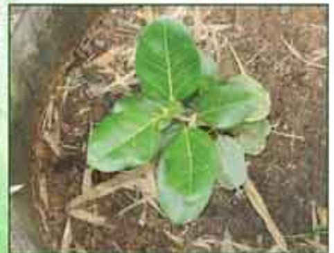
Meena (Pisces) ( Ficus benghalensis )