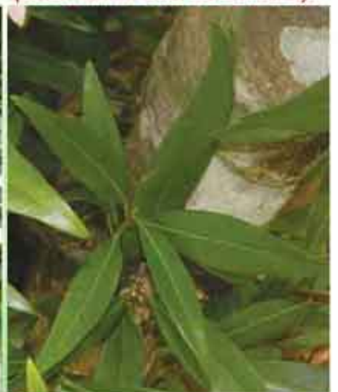
Revati (Madhuca longifolia)