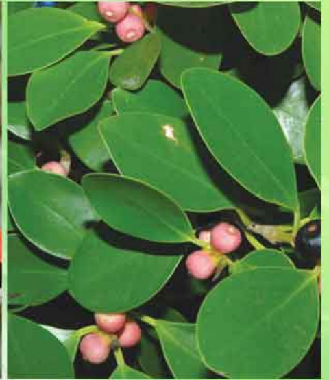
Uttara Phalguni ( Ficus microcarpa )