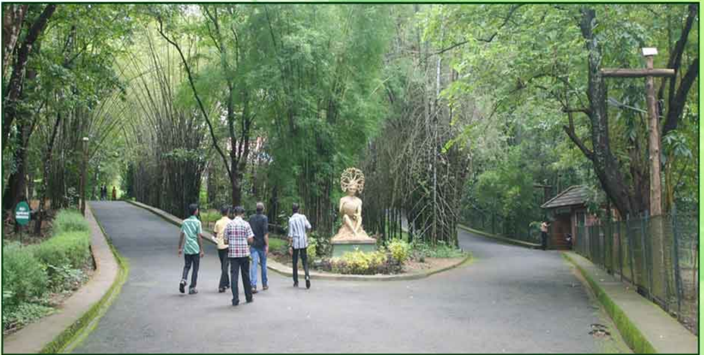
Sylvan entrance of the KFRI Sub Centre Herbal Garden