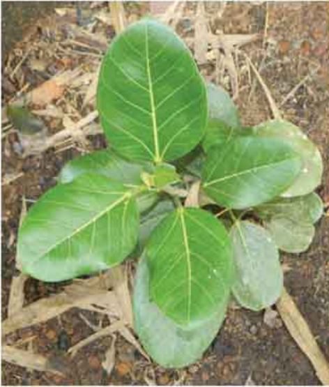
Magha ( Ficus benghalensis )