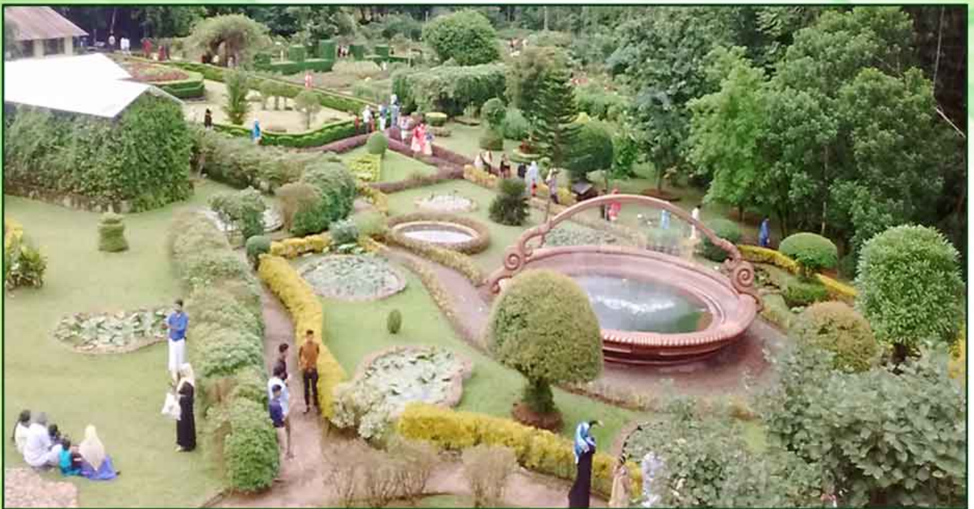
A view of the Bioresources Nature Park at KFRI Sub Centre where the Herbal Garden is located