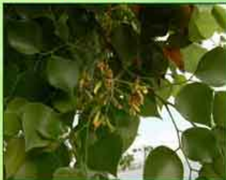
Makara (Capricorn) ( Dalbergia sissoo )