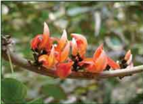
Karkataka (Cancer) ( Butea monosperma )