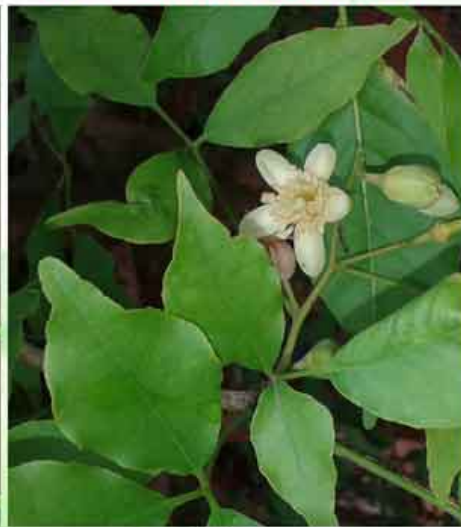
Chitra ( Aegle marmelos )