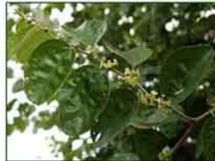
Simha (Leo) ( Ziziphus mauritiana )