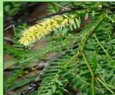
Kumbha (Aquarius) ( Prosopis juliflora )