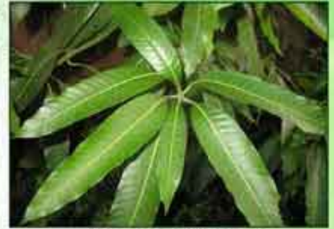
Kanya (Virgo) ( Mangifera indica )