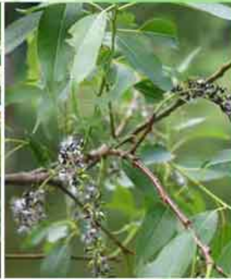
Poorvashada (Salix tetrasperma)