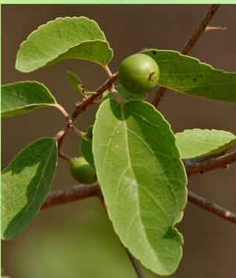
Visaakha ( Flacourtia indica )