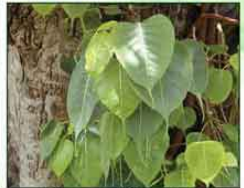
Dhanus (Sagittarius) ( Ficus religiosa )