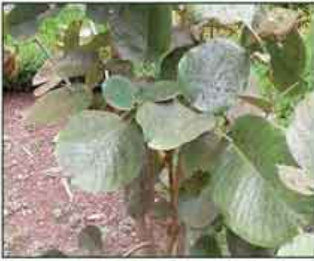
Mesha (Aries) ( Pterocarpus santalinus )