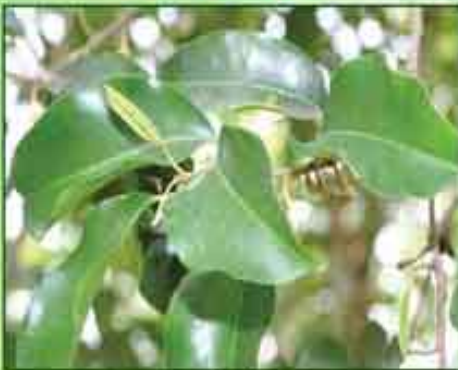
Thula (Libra) ( Mimusops elengi )