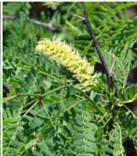
Dhanishta (Prosopis juliflora)