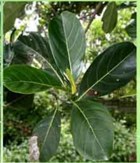
Uttarashada (Artocarpus heterophyllus)