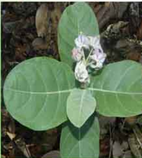
Sravana (Calotropis gigantea)