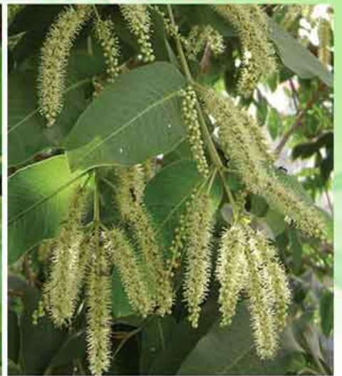
Swaati ( Terminalia cuneata )