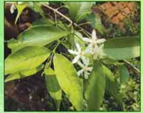
Mithuna (Gemini) ( Wrightia tinctoria )