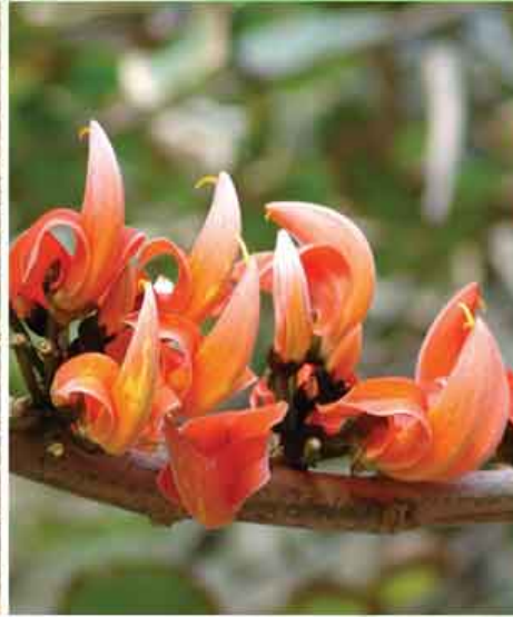
Poorna Phalguni ( Butea monosperma )