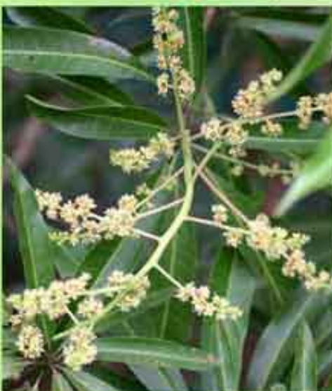
Poorvabhadra (Mangifera indica)