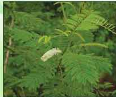
Vrischika (Scorpio) ( Acacia catechu )