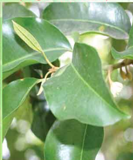
Anuradha ( Mimusops elengi )