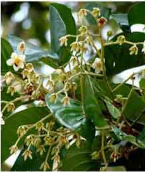
Moola (Vateria indica)