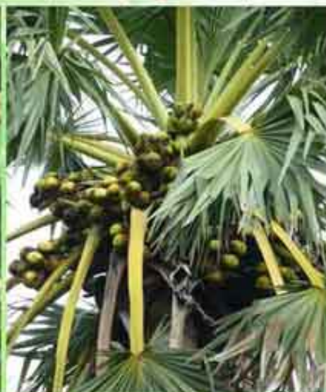
Uttarabhadra (Borassus flabellifer)