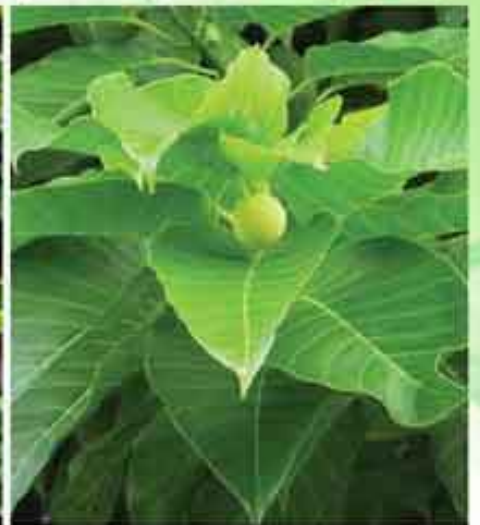
Satabhisha (Neolamarckia cadamba)