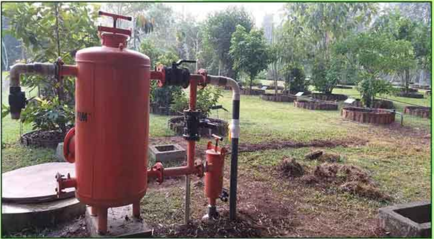
Sprinkler and drip system of irrigation