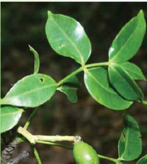
Hasta ( Spondias pinnata )