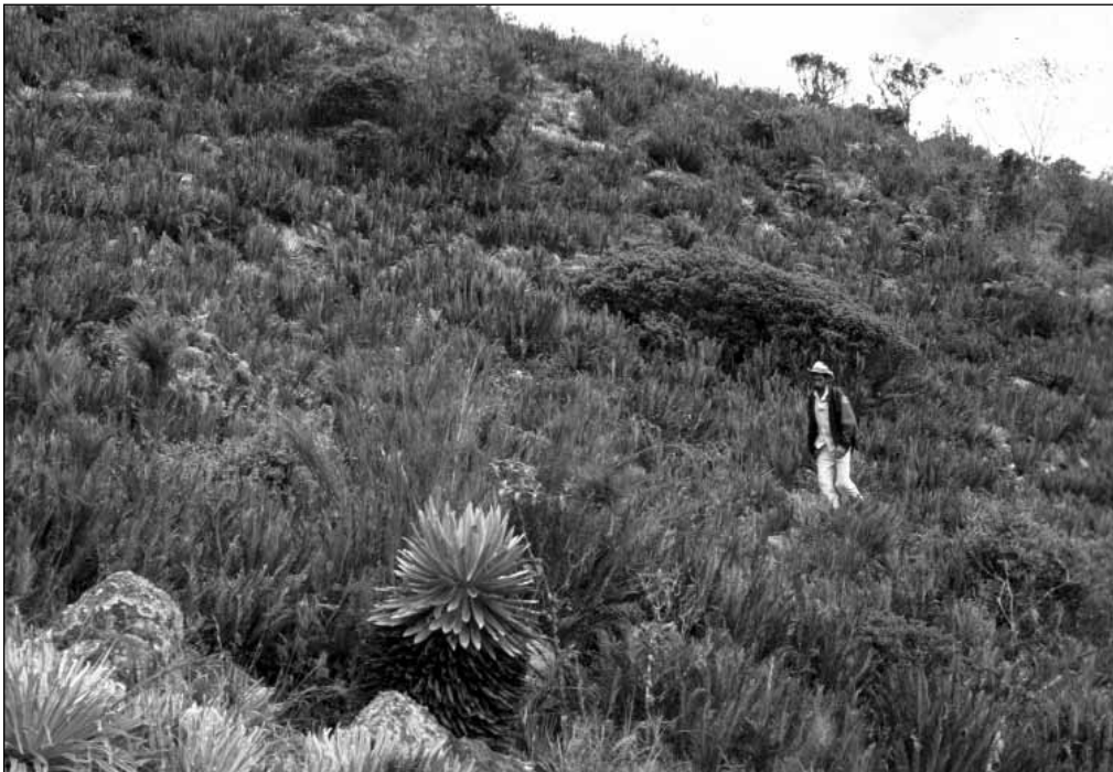
Figure 2. Subpáramo habitat of Aulonemia dinirensis , el. 2700 m, Parque Nacional Dinira, state of Lara, Venezuela, 15 Aug. 1999.

elevations of 2700 meters on the northeastern slopes of the Páramo de Cendé, in the Andes of northwestern Venezuela (Fig. 2). This is the easternmost páramo in the Andean cordillera reaching its maximum altitude at the summit of the Páramo de Cendé (ca. 3350 m). The species is not common and is apparently restricted to a small area of the Parque Nacional Dinira in the state of Lara. Associates include the endemic sundew Drosera cendeensis Tamayo & Croizat (Droseraceae); the endemic asteraceous species Ruilopezia emmanuelis Cuatrec., Ruilopezia floccosa (Standl.) Cuatrec., R. jabonensis (Cuatrec.) Cuatrec., R. vergarae Cuatrec. & López and Monticalia rigidifolia (V.M. Badillo) C. Jeffrey; various grasses ( Festuca sp., Agrostis humboldtiana Steud., Chusquea angustifolia (Soderstr. & C. Calderón) L.G. Clark, and Danthonia secundiflora J. Presl.); the bromeliad Puya aristeguietae L.B. Sm.; the fern Blechnum obtusum R.C. Moran & A.R. Sm. (Moran & Smith 2005); and Dendrophthora meridana Kuijt (Viscaceae).