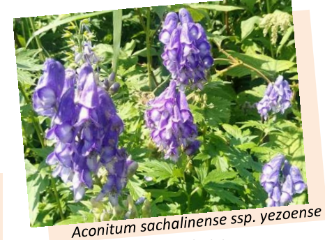
Asahidake Onsen area also has paths for exploration, such as around the Campground. You can see different wild plants and search for birds. We recommend the "Yukomanbetsu" Botanical Garden. Learn more details about the National Park at the