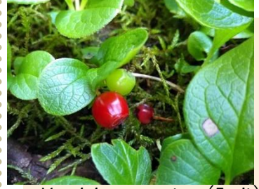
Vaccinium praestans (Fruit)