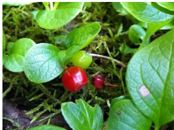
Vaccinium praestans (Fruit)