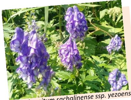
Aconitum sachalinense ssp. yezoense

Asahidake Onsen area also has paths for exploration, such as around the Campground. You can see different wild plants and search for birds. We recommend the "Yukomanbetsu" Botanical Garden. Learn more details about the National Park at the Asahidake Visitor Center. It's a beaut!