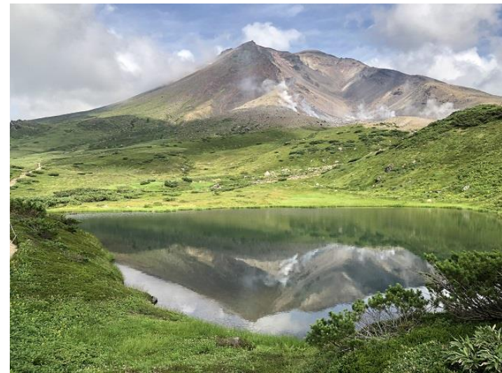
Kagami pond and Asahidake