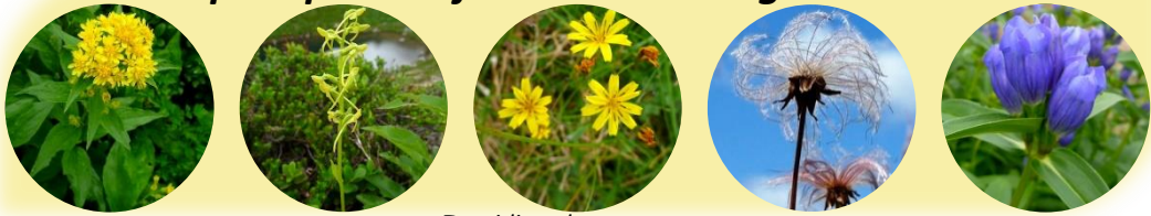
Solidago virgaurea ssp. asiatica Platanthera tipuloides ssp. tipuloides Ixeridium dentatum ssp. nipponicum var. albiflorum f. amplifolium (gutumn geums, fruits) Sieversia pentapetala var. geums, fruits Gentiana triflora var. japonica f. montana