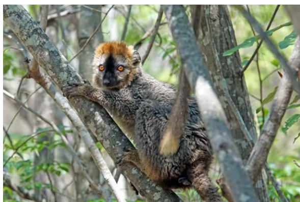
Red-fronted Brown Lemur

Setting up a personal profile at www.facebook.com is quick, free and easy. The Naturetrek Facebook page is now live; do please pay us a visit!