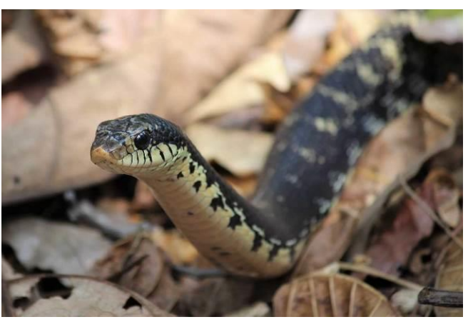
Madagascan Hog-nosed Snake