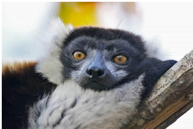
Black & White Ruffed Lemur by Ian Balmer