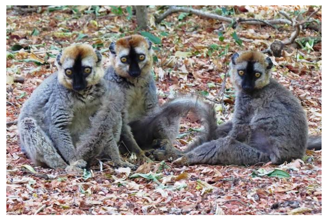
Red-fronted Brown Lemur