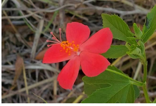
Hibiscus ferrugineus by Paul Harmes