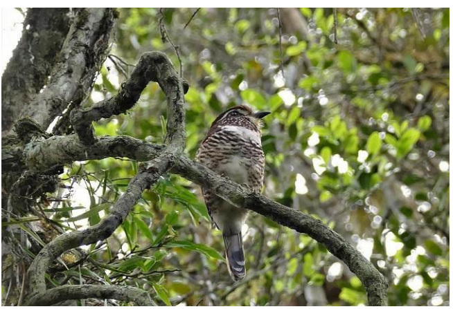
Short-legged Ground Roller