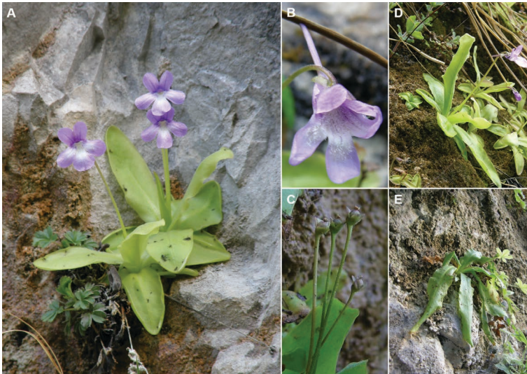
Figure 4: Pinguicula mundi Blanca, Jamilena, Ruíz-Rejón & Reg. Zamora at its type location, for comparison with P. casperiana M.B.Crespo, Mart.-Azorín, M.Á.Alonso & L.Sáez (Figs. 1 & 2). A: habit. B: three quarter view of the flower showing the long spur. C: seedpods. D: flowering plant showing the first elongated summer leaves. E: plant at the end of the growing season, showing the typical elongated summer leaves.