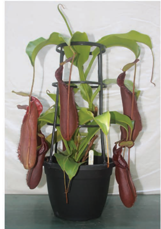
Plant not included

Ferocious Foliage P.O. Box 458 Dahlonega, GA 30533