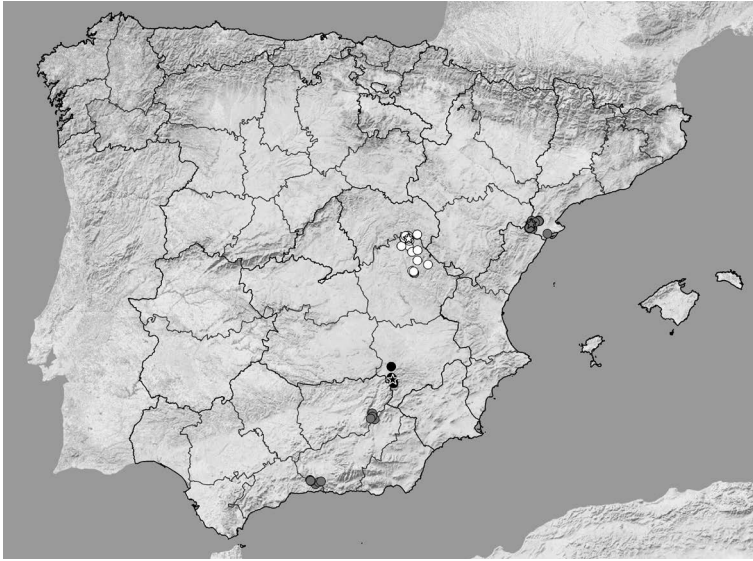
Figure 3: Distribution map of the three species treated in this study: white dot, Pinguicula casperiana M.B.Crespo, Mart.-Azorín, M.Á.Alonso & L.Sáez; grey dot, P. dertosensis (Cañig.) Mateo & M. B. Crespo; black dot, P. mundi Blanca, Jamilena, Ruíz-Rejón & Reg. Zamora. Stars indicate the type locations of each species.