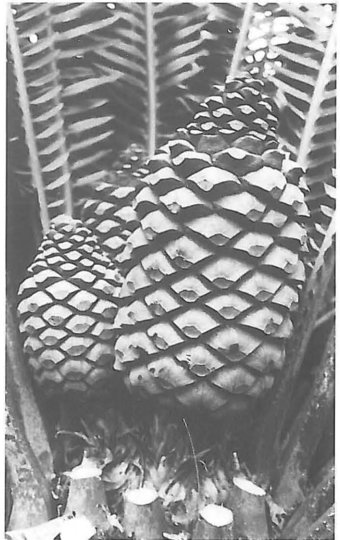
Figure 3 Encephalartos equatorialis with seriate megasporangiote strobili showing ill-defined median facets on the median megasporophylls.