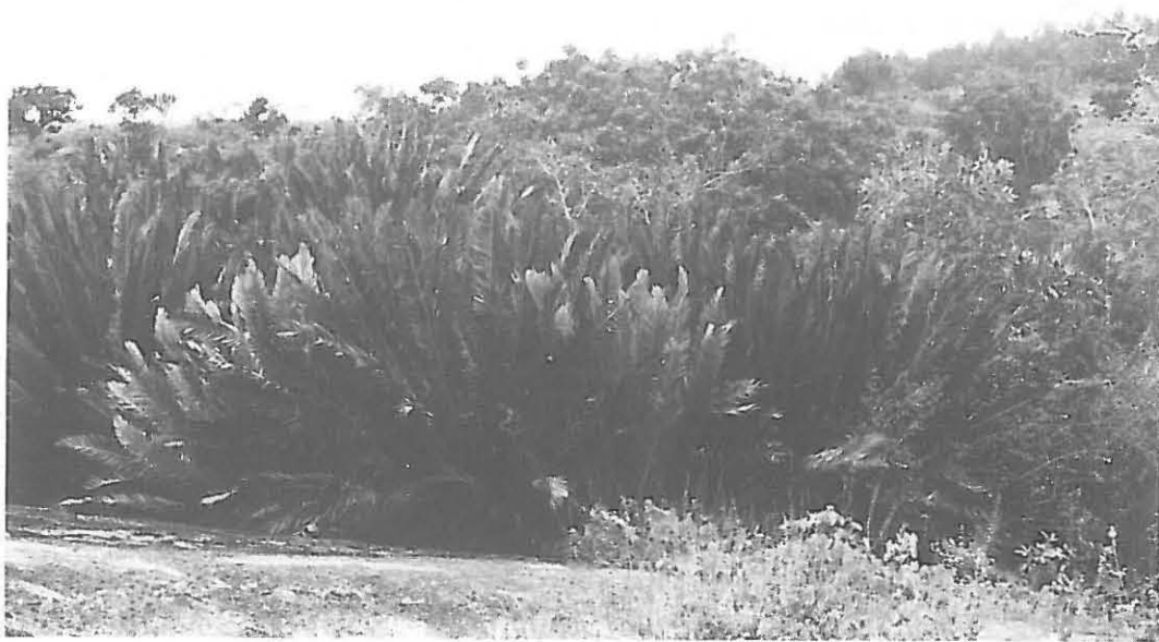
Figure 5 Encephalartos equatorialis in habitat near Thruston Bay, Uganda.

ridges. Encephalartos hildebrandtii var. dentatus Melville differs from the present species in several respects, most notably in the toothlike protrusions (hence the name) on the bullae of both megasporophylls and microsporophylls. One of us (P.J.H.H.) has seen Melville's plant in several localities in Tanzania, and concluded that they were definitely not similar to the species described here. Heenan (1977) refers to plants said to be the same as Melville's from near Jinja in Uganda. We doubt the accuracy of some details of this report, as (1) there is no Arab village, ruined or otherwise, near Fort Thruston [spelt thus in the best gazetteer available to us (United States Board ... 1964), not 'Thuston' as Heenan has it], (2) Fort Thruston has been a jail for political prisoners, not a ruin, since 1970, and (3) the cycads in the area do not match Melville's description.