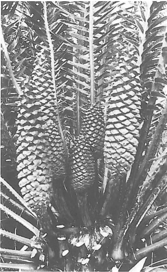
Figure 2 Encephalartos equatorialis with erect, seriate microsporangiote strobili showing microsporophylls spreading and only slightly ascending towards the apex of the microstrobili.