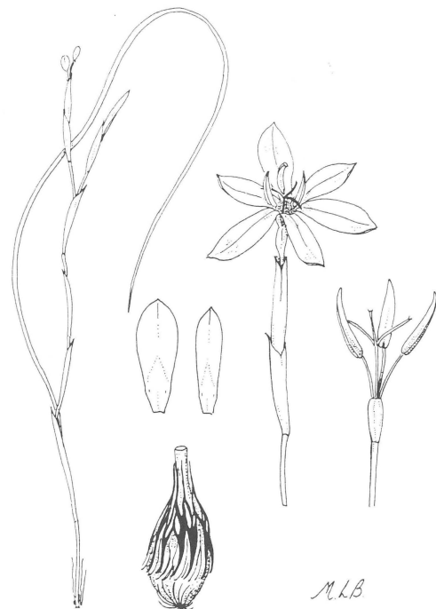
Figure 2 Morphology of Roggeveldia montana : habit \times 0.5 ; corm, whole flower and separated inner and outer tepal full size; ovary, stamens and style, \times 2 . Drawn by Margo L. Branch.

Until the generic status of Roggeveldia can be critically reassessed, and the merit of recognizing this apparent segregate of the Moraea crispa complex of Moraea section Polyanthes (Goldblatt 1991) is thoroughly evaluated, Roggeveldia will remain a rather puzzling and unsatisfactory