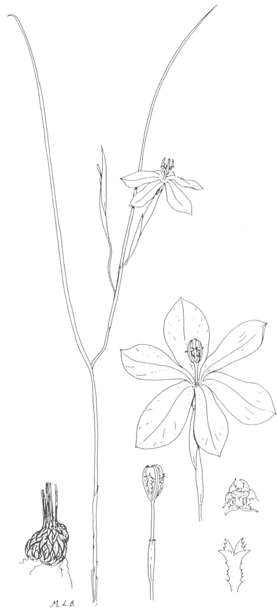
Figure 3 Morphology of Homeria serratostyla : habit \times 0.5 ; corm and whole flower full size; ovary, stamens and style branches, \times 1.5 ; top view of style branches and abaxial side of single style branch \times 4 . Drawn by Margo L. Branch.

19:30. The only wild collection consists of fruiting plants with ripe seeds gathered in mid August. The flowers (Figure 3), with a fairly well-developed cup formed by the tepal claws, ascending anthers and small, but nevertheless clearly differentiated, flat style branches with paired apical appendages, suggest that H. serratostyla is best placed in section Homeria . The insertion of the lowermost leaf some distance above the ground and inner inflorescence spathes that elongate during capsule maturation so that the capsules remain partly enclosed, also accord best with section Homeria . Particularly distinctive of the species are the serrated margins of the style branches and apical appendages. Homeria serratostyla appears to be most closely related to H. patens Goldbl. and possibly H. flavescens Goldbl., both of which occur some distance to the south in the sandstone ranges of the western Cape. If correctly placed in section Homeria , H. serratostyla is the only Namaqualand member of the section.