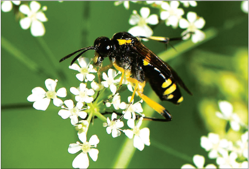
Fig. 5: Macrophya montana (Scopoli, 1763) at Hajnáčka (Ajnácskő)