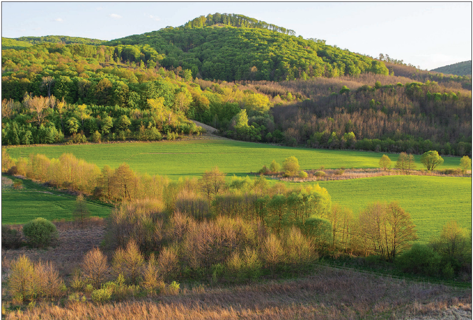
Fig. 4: Thermophilous woodlands with deciduous oaks of eastern sub-Mediterranean regions, Šurice (Sőreg), view from Pohansky castle