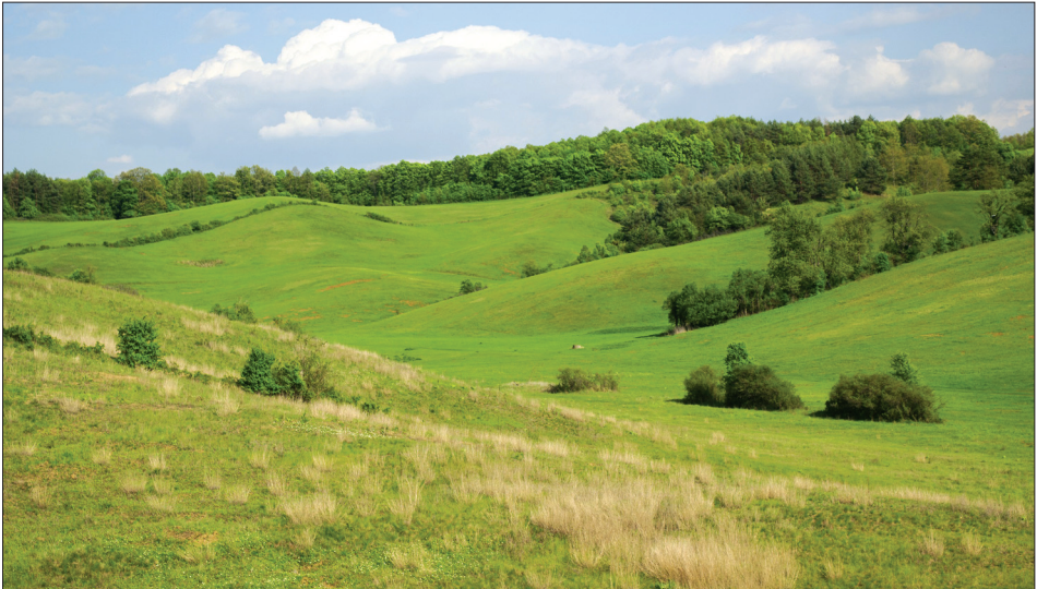
Fig. 2: Mesoxerophilous subcontinental meadowsteppes at Jestice (Jeszte), around Várhegy