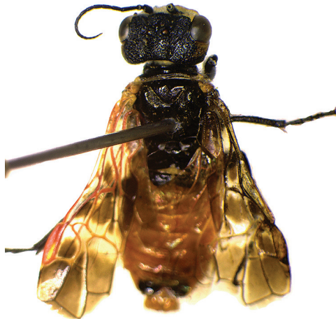
Fig. 6: Pseudocephaleia praeteritorum (Semenov, 1934) in dorsal view