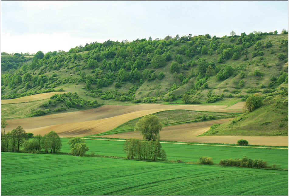
Fig. 3: Thermophilous scrub on sunny, stony slopes ( Pruno spinosae-Crataegum ) at Gemerské Dechtáre (Détér): Nagymál-Bérc