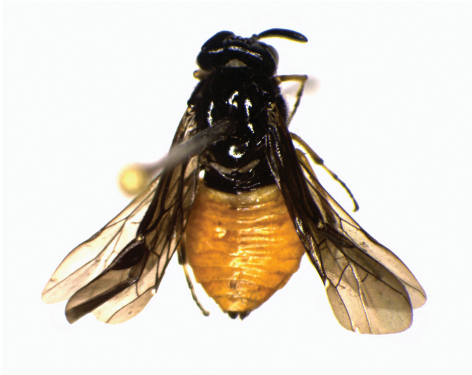
Fig. 7: Aprosthema austriacum (Konow, 1892) in dorsal view

Anthriscus silvestris and Artemisia spp.