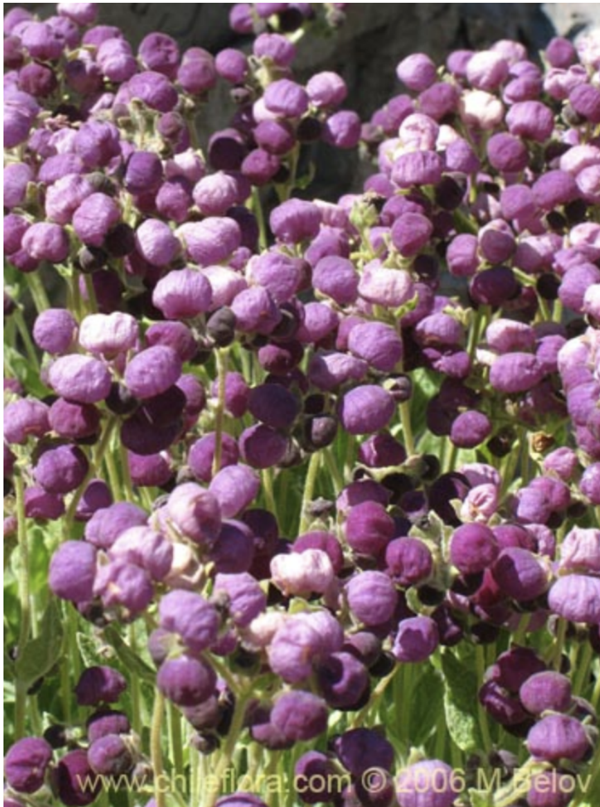
Figure 2. This picture, from Reserva Nacional Altos del Lircay , shows the Calceolaria arachnoidea in bloom.

The cultivar that is currently on the market is Graham. At its mature height, it can reach 8 to 12 inches, and it will bloom from May to June. This plant is very currently very limited on the market, so the species available are wild species. There have not been cultivars bred for the market. No information was found regarding the sources or breeding firms involved in the domestication or production of cultivars currently available on the market.