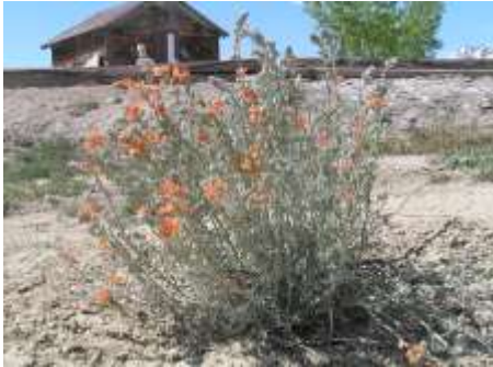
Sphaeralcea grossularifolia Gooseberry Globemallow

This is a tall native perennial with gray green finely cut foliage with neon orange flowers.