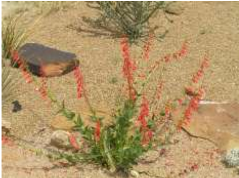
Penstemon eatoni Fire Cracker

This is a tall slender Penstemon with shiny blue green foliage and bright red flowers in early summer.