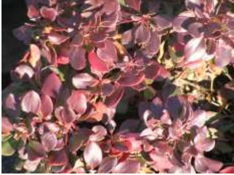
Eriogonum umbellatum 'Kannah Creek'

This is a fantastic low growing mat forming perennial with dark green pointed leaves and sulfur yellow flowers in spring. They have great fall-winter color.