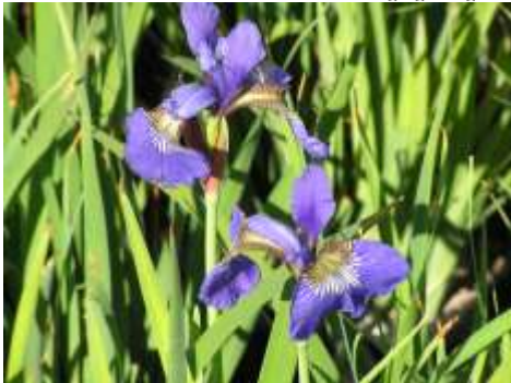
Iris siberica 'Caesar's Brother' Iris

This Iris has numerous deep purple flowers. Make a good cut flower.