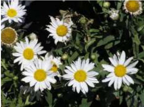
Leucanthemum x superbum 'Little Miss Muffet'

This is a compact clump forming perennial with dark green leaves and white flowers.