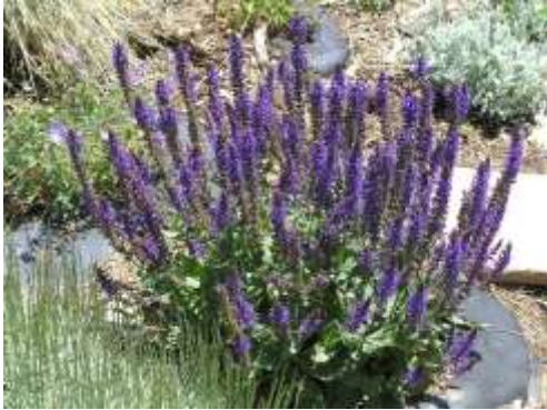
Salvia nemorosa May Night Salvia

This is a dense upright perennial with violet blue flowers.