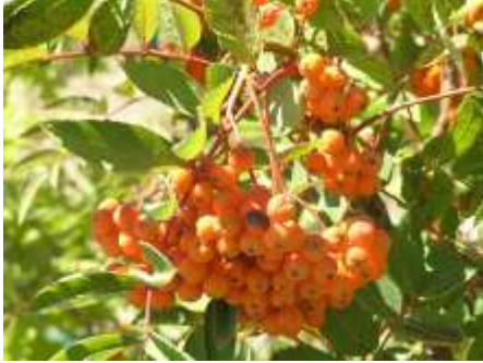
Sorbus scopulina Native Mnt. Ash

This is a small sized clump forming tree with compound leaves and white flower clusters in the spring. Bright orange berries through out the summer, followed with yellow to red fall color. Native to our higher elevations.