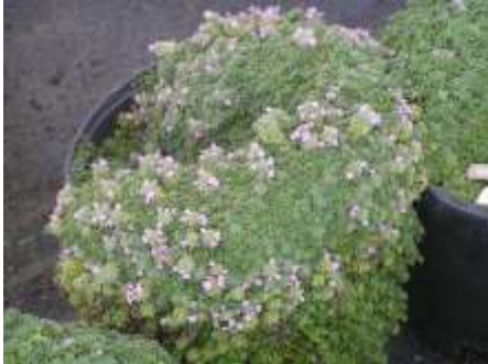
Thymus praecox 'Minus' Dwf. Thyme

This is an extremely low growing ground cover with tiny dark green leaves and pink flowers.