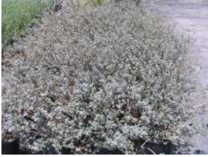
Salix repens Blue Creek Willow

This is a low growing shrub with attractive silver blue leaves and purple stems in winter. They are also called Salix arenaria . This is a very well behaved willow, doesn't get too wild. They grow shorter at higher elevations.