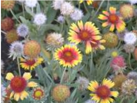
Gaillardia 'Goblin' Dwarf Blanket Flower

Clump forming perennial with rugged red and yellow flowers blooms in summer.