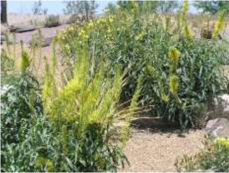
Stanleya pinnata Prince's Plume

Extremely drought tolerant perennial with bright golden yellow flowers in summer.