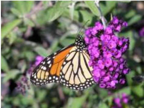
Buddleia davidii Royal Red

This is a tall up right shrub with dark red fragrant flowers. Works well as a cut flower.