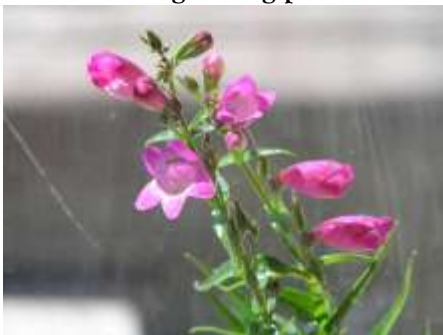
Penstemon x mexicali Red Rocks

This is a low growing perennial with dark green leaves and brilliant rose red flowers. Blooms all summer.