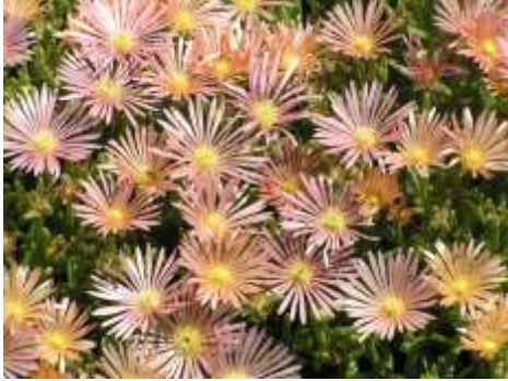
Delosperma 'Kelaidis' Mesa Verde Iceplant

This is a compact ground cover with salmon pink flowers.