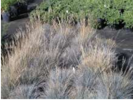
Festuca glauca 'Elijah Blue' Fescue

This is bunch forming grass with striking blue foliage throughout the year. They are excellent small grass.