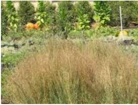
Schizachyrium scoparium Little Blue Stem

This is a long lived bunch grass with delicate blue green leaves and red fall color.