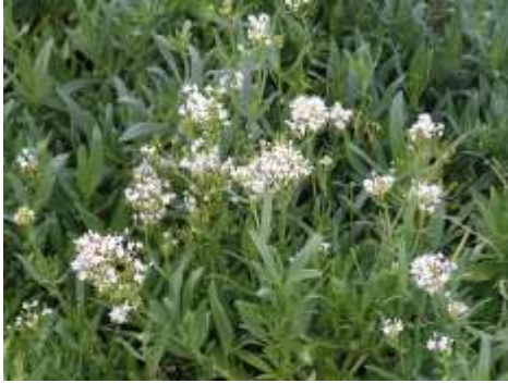
Centranthus ruber alba White Valerian

This is a tall bushy perennial with blue green leaves and white flowers. Blooms all summer long. This is very drought tolerant.