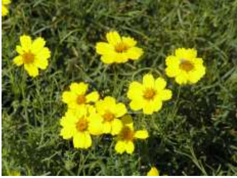
Thelesperma ambiguum Navajo Tea

This is a native perennial with bright yellow flowers in summer.