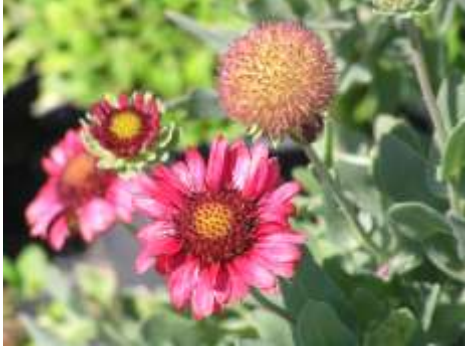
Gaillardia g. 'Burgundy' Burgundy Blanket Flower

This is a medium sized gaillardia with finely cut burgundy flowers.