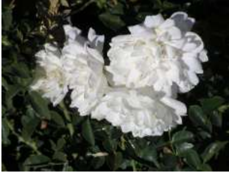
Rosa x 'Sea Foam' Sea Foam Rose

This is a ground cover rose with dense dark green leaves and double white flowers.