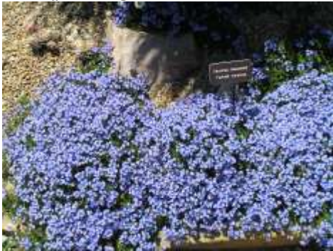
Veronica liwanensis Turkish Speedwell

This is a low growing evergreen ground cover with glossy green leaves and bright blue flowers. It works well in mass plantings.