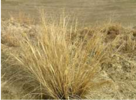
Oryzopsis hymenoides Indian Rice Grass

This is a bunch grass with delicate lacy leaves. In early summer this grass will be covered in airy cluster of nut like seeds. The nutlets were a food staple for native people.