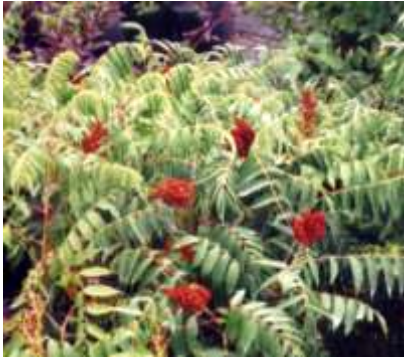
Rhus glabra cismontana

This is an open rounded shrub often forming colonies from suckers. It has finely cut deep green leaves and bright red fruit in fall and great orange and red fall color.