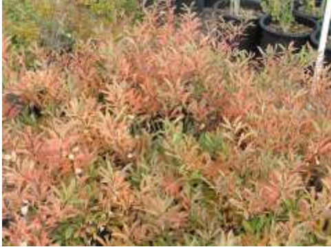
Prunus besseyi Western Sand Cherry

This is a rounded upright shrub with blue green leaves. They have fragrant white flowers in early spring followed by blue black berries in summer. It is great for the birds and has excellent fall color.