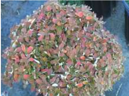
Eriogonum jamesii Creamy Sulfur Flower

Low growing mat forming perennial with silvery leaves and cream to pink flowers.