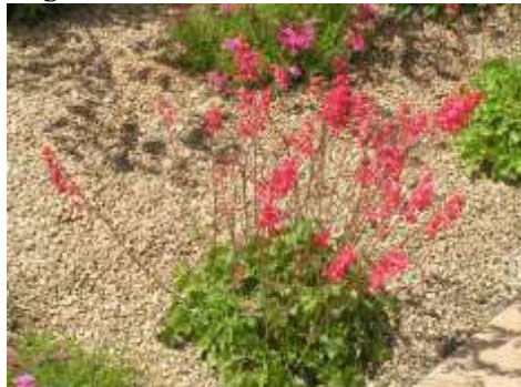
Red Coral Bells