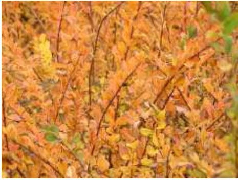
Spirea nipponica var. tosaensis Cheyenne Snowmound

This is a compact shrub with dark green leaves and white flowers in spring. Nice yellow to orange fall color. They can tolerate sun to shade.