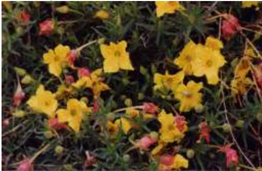
Calylophus hartwegii fendleri

This is an awesome mounding perennial with large 2" square, yellow flowers. Flower buds bold with pink and yellow polka-dots. The flowers bloom from June till frost. They are very drought tolerant. They tolerate poor soils very well.