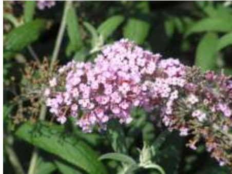
Pink Butterfly Bush