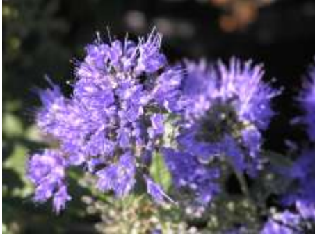
Caryopteris incana 'Dark Knight'

This is an upright shrub with dark green leaves and dark blue flowers. It works well as a cut flower.