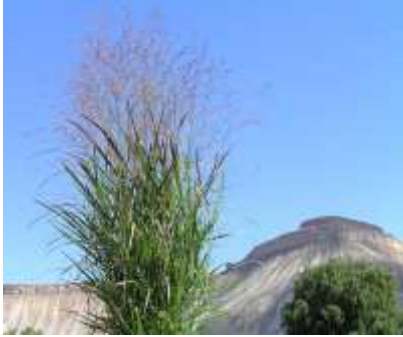
Panicum v. 'Shenandoah'

This is an arching grass with deep red leaves in late summer and fall. They have airy seed heads in late summer and fall. This is a very colorful grass in the fall