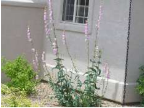
Penstemon grandiflorus Shell Leaf Penstemon

This is a tall robust perennial with blue green leaves and large pink flowers.