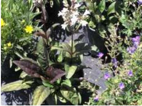
Penstemon digitalis 'Huskers Red'

Clump forming perennial with burgundy red leaves and white flowers. Blooms late spring to early summer.