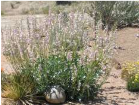
Penstemon palmeri Palmer Penstemon

This is a tall perennial with elegant pink flowers. Great for attracting Humming Birds and very fragrant!