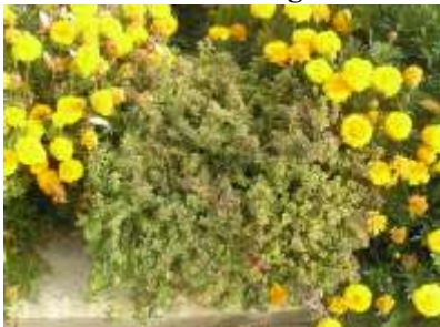
Thymus x citriodorus

This is a woody perennial with up right branches and variegated green and white leaves. The leaves have a nice lemon sent and are great for cooking.