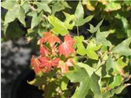
Acer truncatum Shantung Maple

This is a small rounded tree with leaves that start out purple than turn to a dark glossy green color.