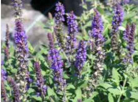
Salvia nemorosa Blue Queen Salvia

This is a tall perennial with gray green foliage and blue to purple flowers in early summer.