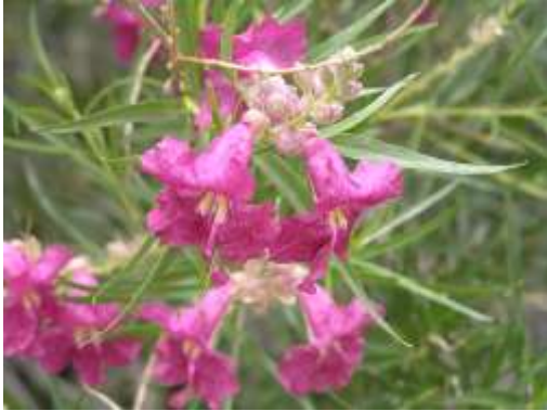
Chilopsis linearis Desert Willow

This is a small tree or large shrub with bright green leaves and pink orchid like flowers. It works well for attracting humming birds. The flower color can vary from pink to white with a pink blush. We also have a burgundy selection.