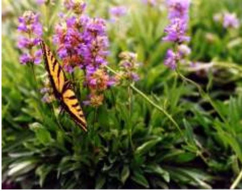
Penstemon procerus Small Flowered Penstemon

This is a mat forming ground cover with sky blue flowers in spring. Excellent for attracting butterflies.