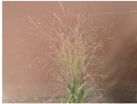
Shenandoah Switch Grass