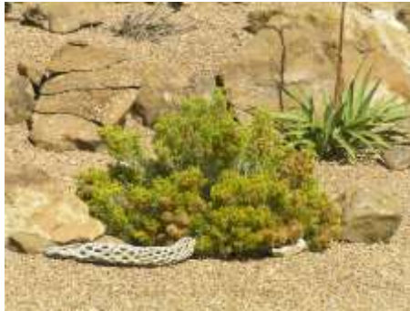
Dwf. Blue Rabbitbrush

Ht: 2-3' *Native* Mature Spread: 2-3' Shape: Low Mounding Flower Color: Yellow Hardiness: Zone 3 Full Sun Very Dry