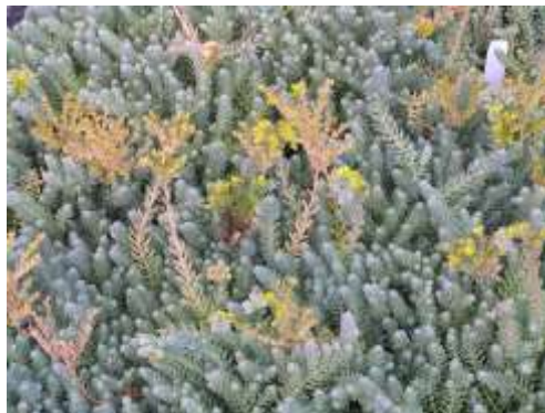
'Blue Spruce' Sedum