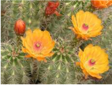
Echinocereus lloydii Lloyd's Hedgehog