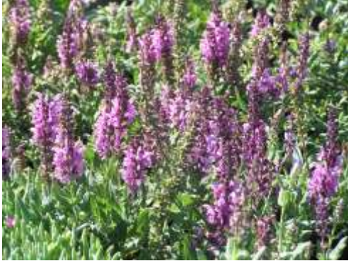
Salvia nemorosa Rose Queen Salvia

This perennial has deep rose flowers and gray green foliage. Will repeat bloom when cut back.