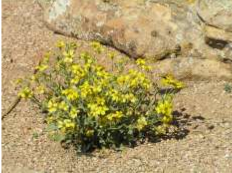
Psilostrophe tagetina Paperflower

This is an extremely drought tolerant mounding perennial with yellow paper like flowers that last all season long. They tolerate poor soils very well.