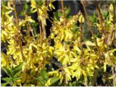
Forsythia x 'Meadowlark' Meadowlark Forsythia

This is a tall rounded shrub with bright yellow flowers in early spring. Meadowlark is the hardiest cultivar introduced by North Dakota State University. It prefers full sun for the best blooms.