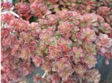
Sedum spurium Red Carpet

Low growing ground cover with rich red leaves and rose-red flowers.