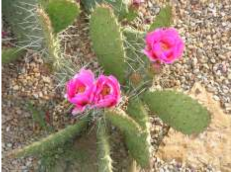
Opuntia phaeacantha Prickly Pear

This is a mound forming cacti with large light green pads and few spines. The flowers are bright yellow to red, and then followed by red purple juicy fruits.