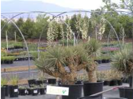
Yucca thompsoniana Thompson Yucca

This is a low branching tree forming yucca with gray green leaves. They usually have multiple heads.