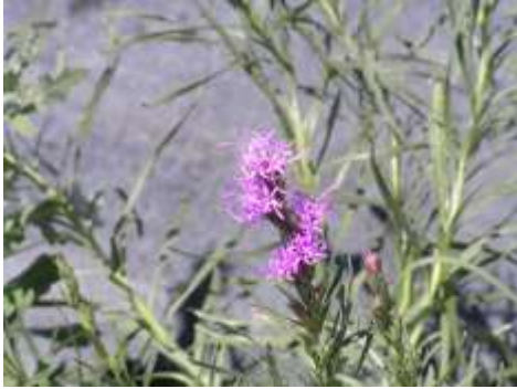
Liatris punctata Native Gayfeather

This is a tall perennial with silver green leaves and spike like lavender purple flowers.