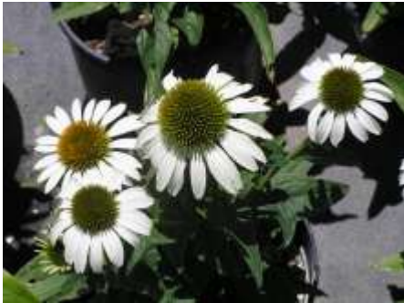
Echinacea purpurea White Cone Flower

This is a tall perennial with deep green leaves and white flowers.