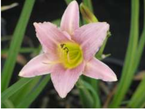
Hemerocallis 'Wine Time'

This is a clump forming perennial with rose wine colored flowers.