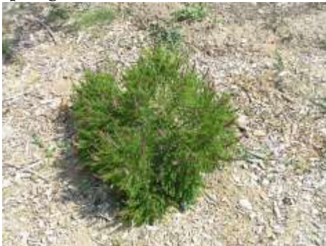
Amorpha nana Dwarf Leadplant

This is a graceful compact shrub with delicate green fern like leaves and fragrant pink flowers with orange anthers. They bloom in late spring to early summer. Like its relative A. canescens it is also late to leaf out in the spring.