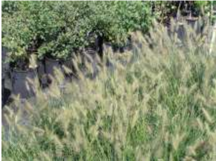
Pennisetum alopecuroides 'Hameln' Dwf. Fountain Grass

This is a dense mounding grass with narrow arching bright green leaves and slender buff colored seed heads.