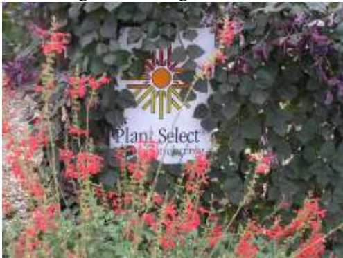
Salvia darcyi Vermillion Bluffs Mexican Sage

This is a tall sage with light green leaves and bright red flowers that bloom all summer long. They are great for attracting Hummingbirds.