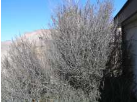
Cercocarpus intricatus Littleleaf Mt. Mahogany

This is an intricately branched evergreen shrub with tiny purple flowers in early spring followed by fluffy white twisting seeds in summer. They make a good evergreen screen and the birds love to hide in them.