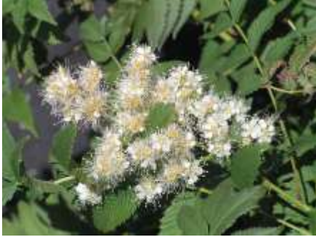
Sorbaria sorbifolia Ural False Leaf Spirea

This is a large shrub with attractive upright branches and compound dark green leaves. They produce large cream white flower spikes in late spring to early summer. They have reddish purple fall color.