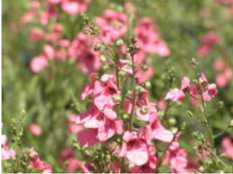
Diascia integerrima Coral Canyon Twinspur

This is a low growing mounding perennial with soft pink flowers. Blooms from spring through summer.