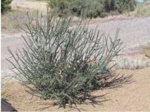
Cylindropuntia kleiniae Pencil Cholla

This is a slender shrub like cacti with pencil shaped light green stems. The flowers are pink to purple and the fruits are an orange color.