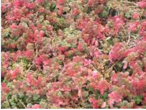
Sedum spurium Dragon's Blood

This is a low growing ground cover with greenish red leaves and pink flowers. The leaves turn brilliant burgundy in the fall.