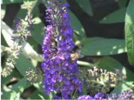
Buddleia davidii Nanho Purple

This is a mounding medium sized shrub with magenta purple flowers. They make a great fragrant dried flower.