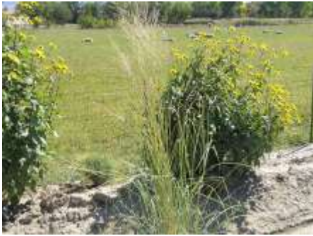
Sporobolus wrightii Sacaton Grass

This is an impressive no care bunch grass that works well in meadows and borders. They have golden feathery seed heads in summer.