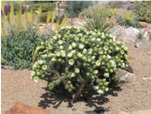
Cylindropuntia imbricata White Flg. Tree Cholla

This is a tall shrub like cacti with deep green stems and white flowers in the spring.