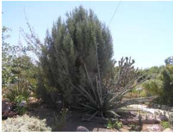
Juniperus osteosperma Utah Juniper