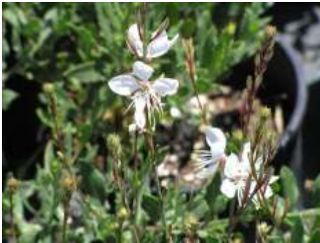
Gaura lindheimeri White Apple Blossom

This is a tall fast growing perennial with delicate white flowers blooms all summer long. They can tolerate shade.