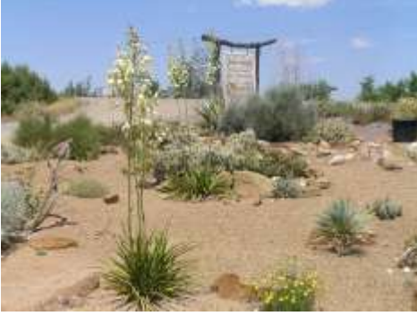
Yucca rupicola Twisted Leaf Yucca

This is a fairly short yucca with blue green twisting leaves.