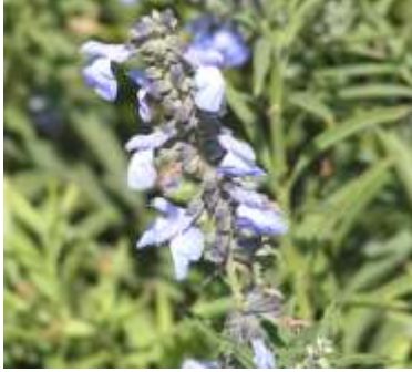
Salvia azure grandiflora Blue Sage

This is a tall robust, fragrant perennial with sky blue flowers in fall. Great for attracting humming birds!