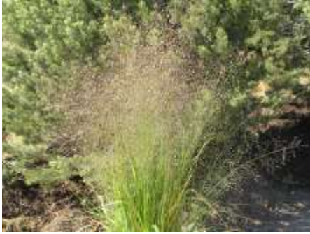
Eragrostis trichodes Sand Love Grass

This is a beautiful bunch grass with airy seed heads in summer and fall. The leaves turn a rust red color in the fall.