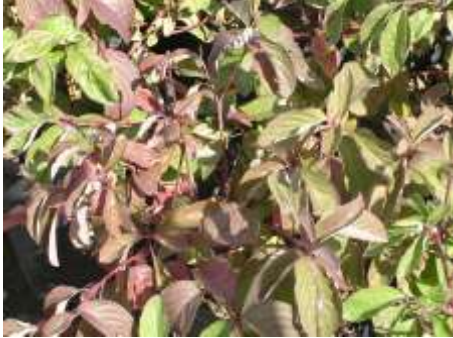
Cornus sericea Red Twig Dogwood

This is a dense upright shrub with medium green foliage. It has creamy white flowers in May followed by white fruit in fall. They have showy red to burgundy stems during winter.