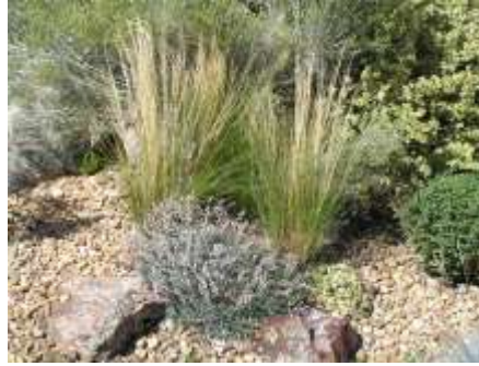
Mexican Feather Grass