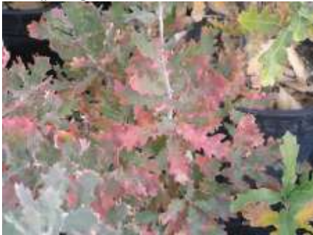
Quercus undulata Wavyleaf Oak

This is small tree or large shrub with blue green wavy leaves. Similar to Gamble Oak, but holds onto its leaves till spring.