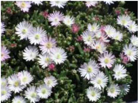
Delosperma 'Oberg' Oberg Iceplant

This is a small Iceplant with white flowers and pink flower buds.