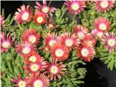
Delosperma dyeri Red Mountain Iceplant

This is a low growing ground cover with red flowers that fade to copper red.