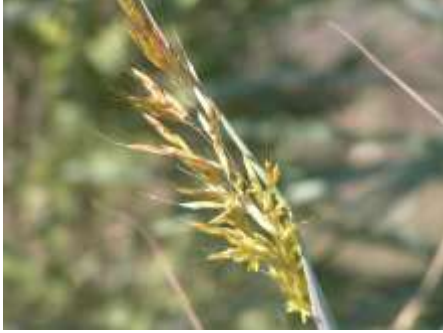
Sorghastrum nutans Indian Grass

This is a tall bunch grass with golden seed plumes in fall to winter. It works well in dried flower arrangements.