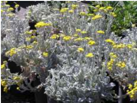
Tanacetum densum Partridge Feather

This is a low growing perennial with finely cut silver foliage and tiny yellow flowers.