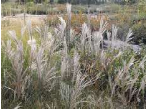
Miscanthus sinensis Yaku Jima Maiden Grass

This is a compact clump forming grass with rich green leaves and cream white seed heads.