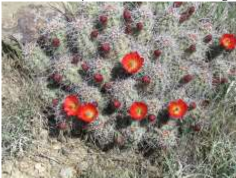
Echinocereus triglochidiatus Claret Cup

This is the most commonly found species of Hedgehogs. Forms large mounds of barrel shaped stems. In early summer they are covered with bright red flowers. The fruits are red, juicy and edible.