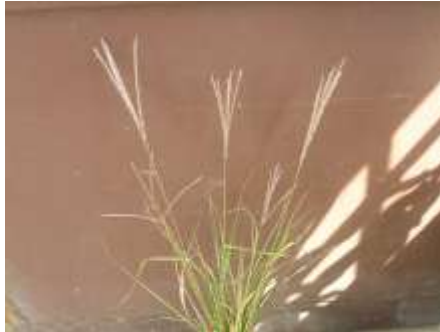
Miscanthus sin. purpurascens