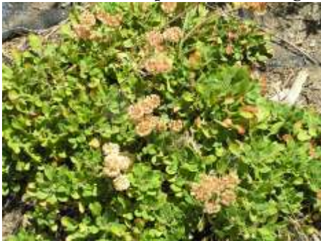
Eriogonum umbellatum Sulfur Flower

This is a low growing mat forming perennial with bright green leaves and sulfur yellow flowers. The flowers fade to shades of pink. The foliage turns a bright burgundy in the winter.