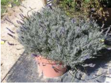
Lavandula x. intermedia cv. 'Grosso'

This is a large perennial with grey green evergreen leaves it has large purple flowers. They prefer well drained soils.