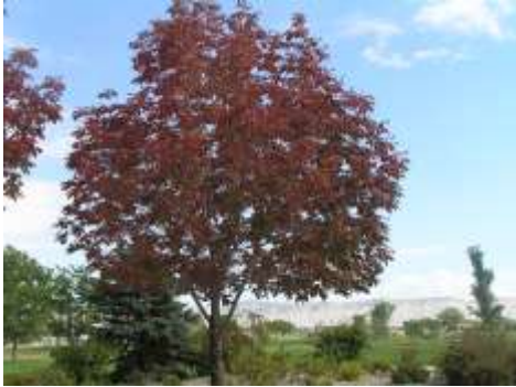
Fraxinus americana 'Junginger' Autumn Purple Ash

This is a seedless variety of white ash that turns a deep purple in fall. Protect the trunk from winter sun when young to prevent sunscald. Very popular for it's fall color.