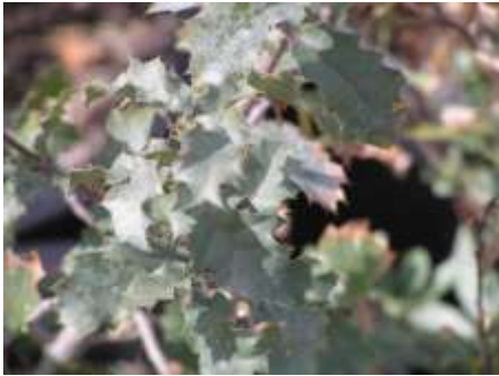
Quercus turbinella Live Oak

This is a shrubby evergreen shrub or small tree with blue green holly like leaves. This shrub tolerates poor soils. Will lose its leaves during cold winters.