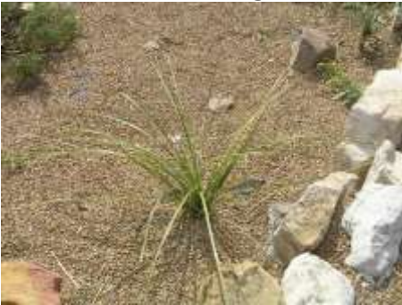
Nolina microcarpa Bear Grass

This is a grass like shrub with leathery green leaves with finely toothed margins. They have greenish white flowers clustered along 4-5' stalks in early summer.