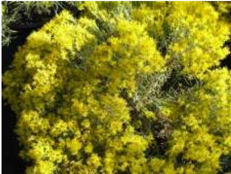
Chrysothamnus naus. naus.

This is a dwarf rounded shrub with thin blue to green foliage. They produce bright yellow flowers in late summer to fall. They are great for fall and winter color. Their compact form makes them ideal for small gardens.