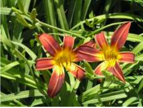
Hemerocallis 'Lady Eva' Lady Eva Daylily

This is a grass like perennial with bright green leaves and stunning rust colored flowers that bloom in summer.