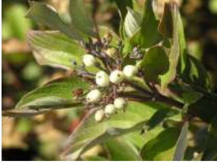
Cornus sericea coloradense Colorado Red Twig Dogwood

This is a rounded spreading shrub with red stems and bright green leaves. This shrub has white flowers in spring followed by white berries in summer.