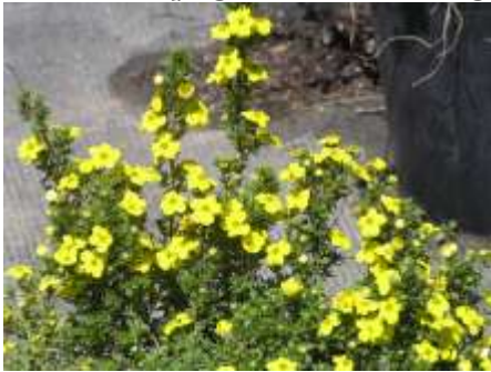
Potentilla fruticosa 'Jackman'

This is an upright shrub with large dark green leaves and bright golden yellow flowers throughout the summer.