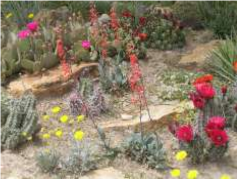
Penstemon alamosensis Alamo Penstemon

This perennial has blue green leaves and coral orange flowers. It is extremely drought tolerant.