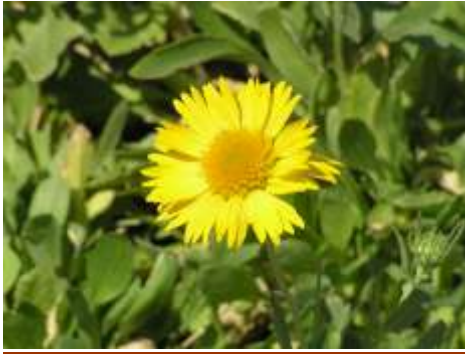
Gaillardia grandiflora Golden Gaillardia

This is a dwarf gaillardia with large gold flowers.