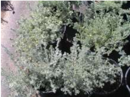
Artemisia frigida Fringed Sage

This is a mound forming perennial with fragrant soft silver foliage. They make a great accent.