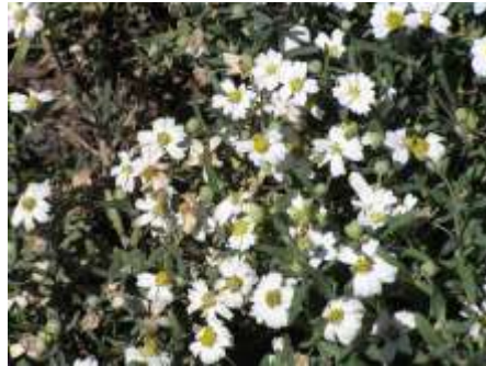
Black Foot Daisy