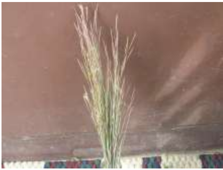
Schizachyrium scoparium The Blue's

This is a stiffly upright grass with sky blue leaves that will turn pinkish-red in fall.