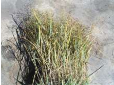
Panicum v. 'Prairie Sky' Prairie Sky Switch Grass

This is a medium sized vase shaped grass with bright blue green leaves and airy seed heads.