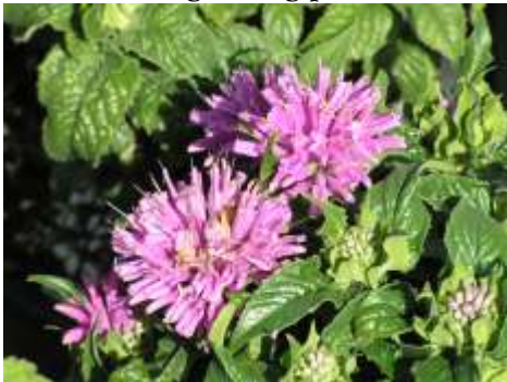
Monarda 'Petite Delight' Petite Delight Bee Balm

This is a low growing perennial with fragrant rich green leaves and lavender pink flower clusters.