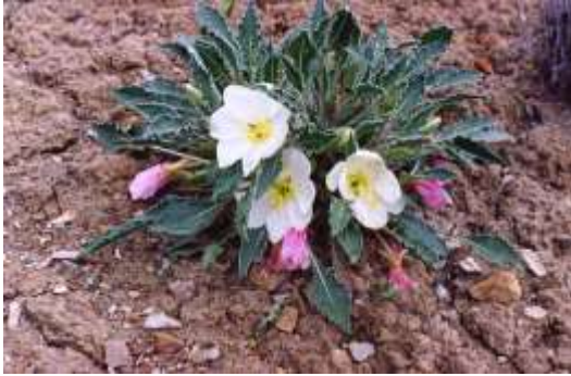
Oenothera caespitosa Evening Primrose

This is fantastic low growing perennial the rosettes have silver woolly leaves and white flowers. It blooms all summer.