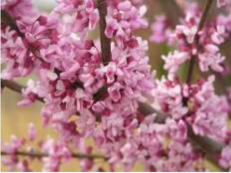
Cersis canadensis Eastern Redbud

This is a small rounded tree with lavender flowers in early spring. Heart shaped leaves start reddish and mature to green. Trunk needs protection from winter sun to prevent sunscald while young.