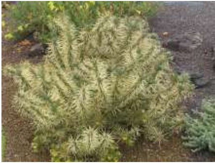
Cylindropuntia davisii Devil's Cholla

This is a tall shrub like cacti with long golden spines and greenish yellow flowers. The spines glow in the sun.