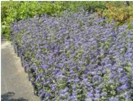
Caryopteris incana Blue Mist Spirea

This is a dense shrub with narrow grayish green leaves. It has brilliant blue flowers in mid to late summer and is great for bees.