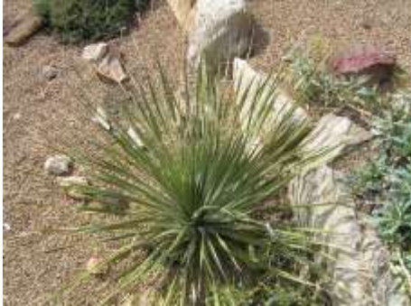
Dasyliirion texanum Green Desert Spoon

This is an evergreen yucca like shrub with thin dark green leaves. Works well in a cactus gardens. Spiked leaves are sharply toothed, so be careful.