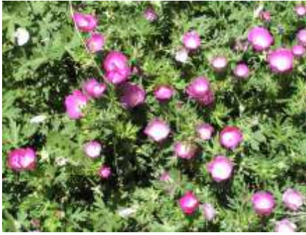
Callirhoe involucrata Poppy Mallow

This is a low growing perennial with burgundy cup shaped flowers blooms until frost. They work well as a ground cover.