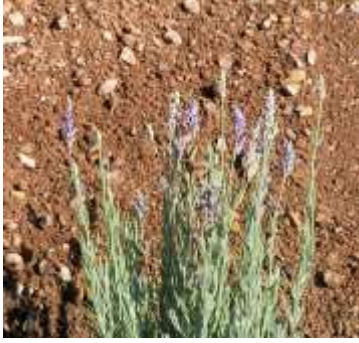
Lavandula ang. 'Munstead'

This is a medium sized perennial with slender grayish green evergreen leaves and lavender to blue flowers.