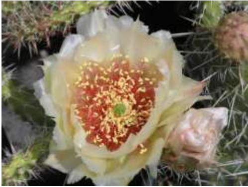
Opuntia polyacantha 'Crystal Tide'

This is a mound forming ground cover cacti with slender white spines. They have very showy, white flowers.