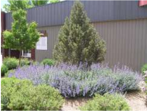
Nepeta x faassenii

This is an upright spreading perennial with gray green leaves and lavender flowers.