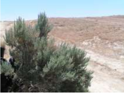
Artemisia tridentata Basin Sage

This is a tall fragrant shrub with rugged silver foliage. It is a great accent plant and excellent for wildlife habitat. It is extremely drought tolerant and soil tolerant.