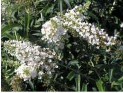
Buddleia davidii 'White Profusion'

This is a tall vase-shaped shrub with white fragrant flowers in summer. It makes a good cut flower.