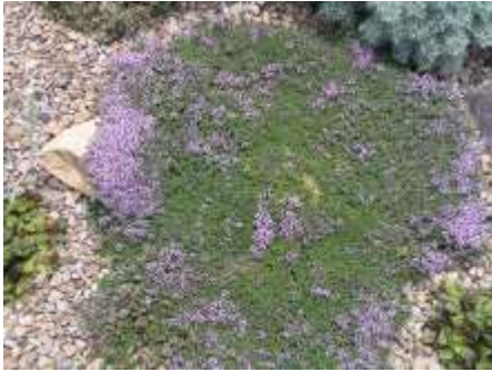
Thymus praecox 'Pseudolanuginosus' Wooly Thyme

This is great creeping mound cover that works well around walk ways. The foliage is a grey green and has tiny pink flowers.