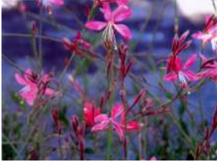
Gaura l. 'Pink'

This is a tall perennial with slender green to red leaves and soft pink flowers that resemble butterflies.