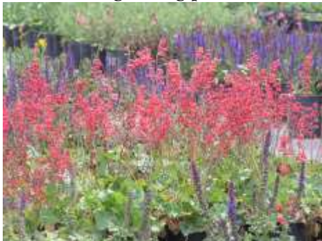
Heuchera sanguinea 'Splendens'

This is a low growing perennial with rich green leaves and scarlet red flowers in early summer.