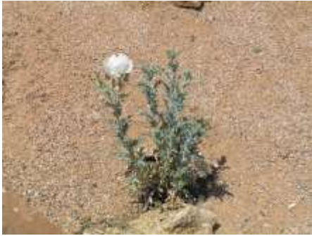
Argemone polyanthemos Prickly Poppy

This perennial has blue green spiny leaves and large white flowers. It is extremely drought tolerant. This is an Eastern Plains species that was introduced to the Western Slope possibly by the highway.