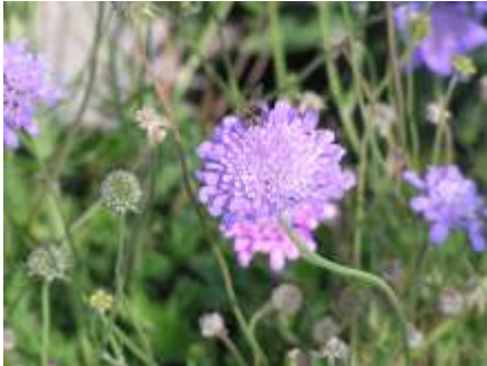
Scabiosa columbaria Butterfly Blue Pincushion

This perennial has numerous blue pincushion flowers all season long and makes a good cut flower.