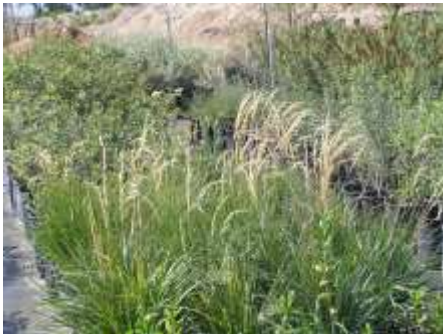
Calamagrostis arundinacea 'Karl Foerster'

This is an upright clump grass with thin glossy green leaves and fluffy tan seed head which becomes showy in mid-summer.