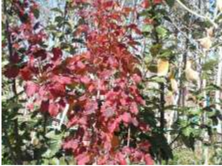
Acer tataricum Tatarian Maple

This is an excellent small single or multi stemmed tree. The winged seeds turn brilliant red in summer. They have good yellow to maroon fall color. Tolerant of alkaline soils.