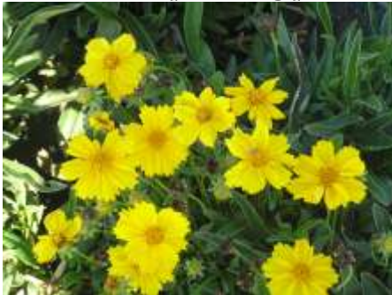
Coreopsis lanceolata Lance-Leaf Coreopsis

This is a clump forming perennial with shiny green leaves and bright yellow flowers.