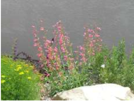
Penstemon 'Elfin Pink' Pink Penstemon

This is a slender Penstemon with blue green leaves and pink flowers.