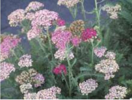
Achillea millefolium Sangria Yarrow

This is a medium sized perennial with bright green fern like leaves. They have striking red-wine colored flowers that bloom throughout the summer. They make a great cut flower.