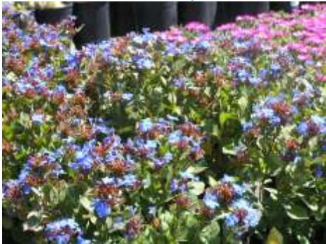
Ceratostigma plumbaginoides Hardy Plumbago

This is a low growing ground cover with glossy green leaves and deep blue flowers in summer. They work well in sun or shade. They have maroon fall color.