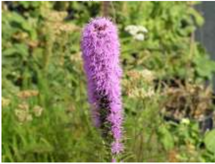
Liatris spicata Kobold Gayfeather

This is a compact selection of Gayfeather with dense violet spikes in mid to late summer.