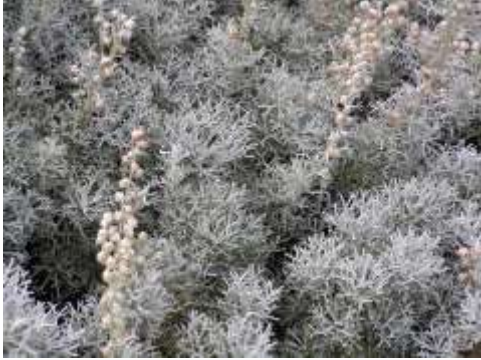
Artemisia versicolor Sea Foam Sage

This is a low growing shrub with lacey silver foliage. It works well as an accent plant.