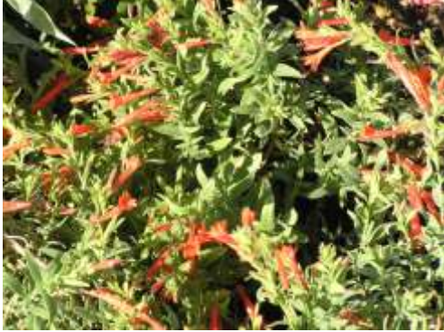
Epilobium canum subsp. garrettii Orange Carpet Hummingbird Trumpet

This is a lovely mound forming perennial with grayish green leaves and striking orange trumpet flower that attract hummingbirds.