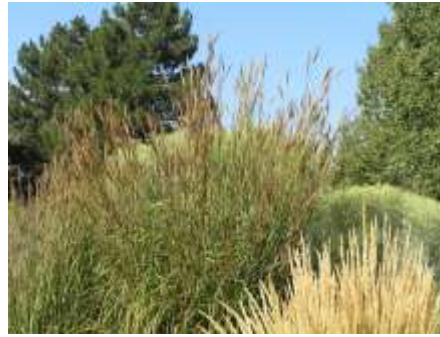
Big Blue Stem