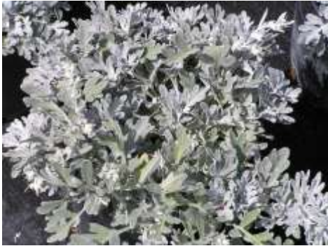
Artemisia stelleriana Silver Brocade Sage

This is a low growing perennial with bright finely-cut silver leaves. It makes a great accent plant.