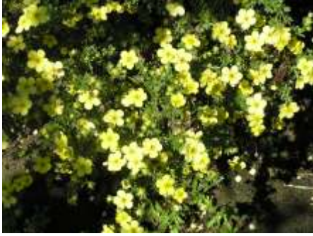
Potentilla fruticosa 'Katherine Dykes'

This is a large spreading shrub with gray green foliage and pale yellow flowers in summer.