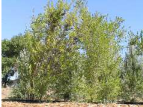
New Mexico Privet