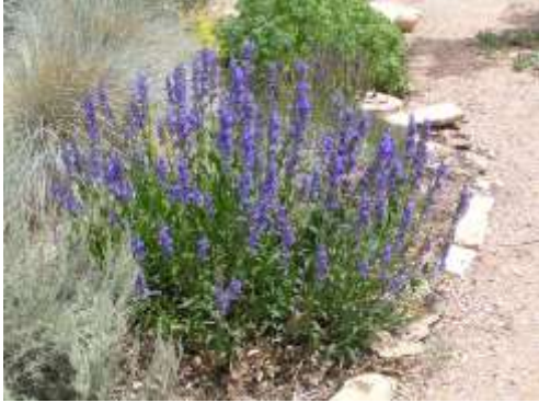
Penstemon strictus Rocky Mnt. Penstemon

This is a tall clump forming perennial with deep evergreen leaves and dark blue flowers.