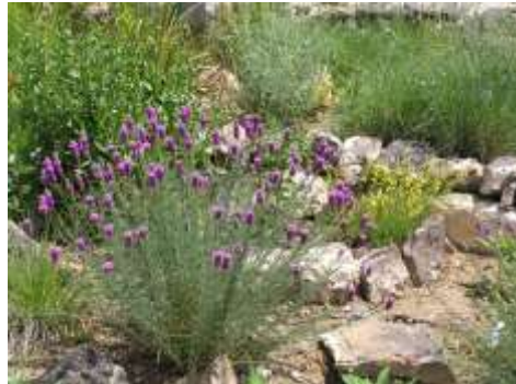
Purple Prairie Clover