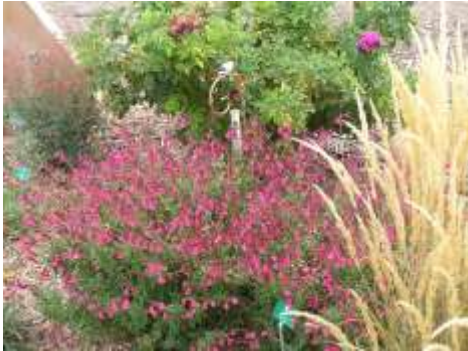
Salvia greggi 'Wild Things' Sage

This is a lovely perennial with hot pink flowers that bloom from June till frost.