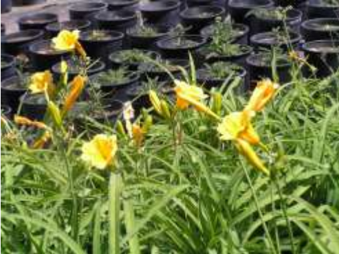
Hemerocallis 'Stella de Oro' Dwarf Gold Daylily

This is a medium sized daylily with rich green leaves and golden flowers most of the summer.