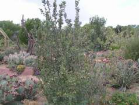
Amelanchier utahensis Utah Serviceberry

This tall shrub has white fragrant flowers in the spring followed by bluish black berries. The leaves have a blue green hue. Great for birds and extremely drought tolerant.