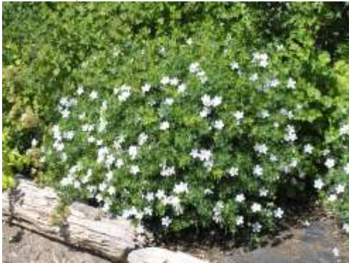
Geranium sang. alba White Geranium

This is a mound forming perennial with white to pink flowers in summer. They have graceful foliage throughout the year.