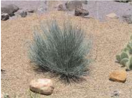
Ephedra equisetina Blue Stem Joint Fir

This is a mounding evergreen shrub with slender blue stems. The female plants have bright red berries in midsummer. They have a tendency to sucker.