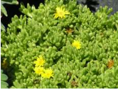
Delosperma nubigenum Hardy Yellow Iceplant

This is a low growing ground cover with bright yellow flowers early summer and again in fall. They have light green succulent leaves turn red in winter.