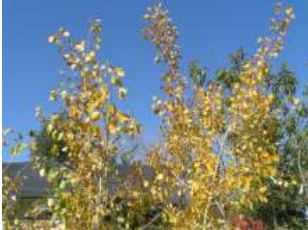
Populus sargentii Sargent Cottonwood

This is a broad irregularly rounded tree. They have large rich green leaves that turn golden yellow in fall. Native to the eastern slope, it's the largest of the native cottonwoods. Great shade for large spaces.