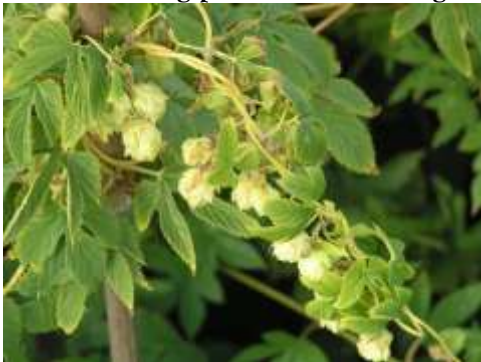
Humulus lupulus neomexicana

Vigorous climbing vine. Course green leaves and tan to pink seed clusters. Excellent for quick shade on trellises or dog pens. Dies to the ground in winter.