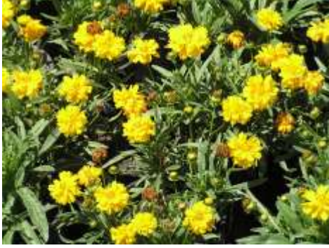
Coreopsis grandiflora "Sunray" Dwf. Dbl. Coreopsis

This is a medium sized perennial with bright green leaves and vivid double yellow flowers.