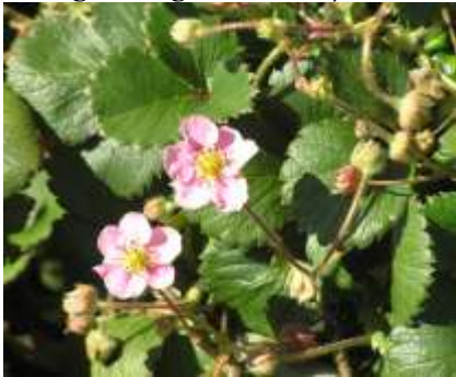
Fragaria 'Frel' Pink Panda Strawberry

Low growing strawberry with bright pink flowers and sweet berries.