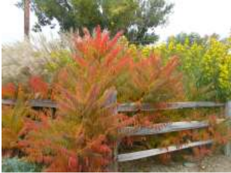
Rhus typhina 'Laciniata' Cutleaf Staghorn Sumac

This is a small tree to large shrub with bright green finely cut leaves and red seed heads in summer. They spread by suckers. They have excellent fall color.