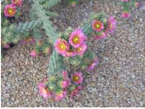
Cylindropuntia imbricata x whipplei Pink Flg. Tree Cholla

This is a medium sized shrub like cacti with bright pink flowers. Similar to the tree Cholla but not as tall.