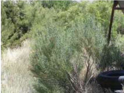
Chrysothamnus naus. Tall Blue Rabbitbrush

This is a bushy semi evergreen shrub with thin blue or green leaves. They have bright yellow flowers in late summer to fall followed by fluffy white seeds.