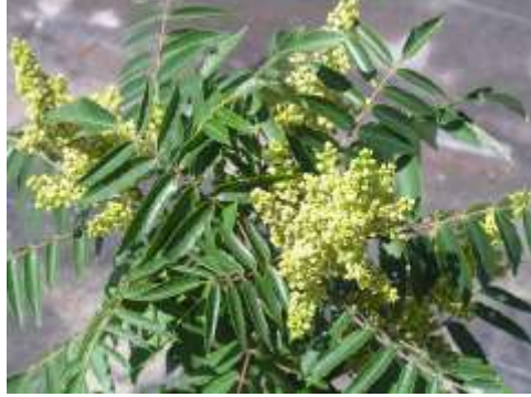
Rocky Mnt. Sumac