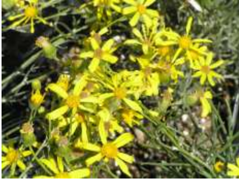
Senecio longiflorus Threadleaf Groundsel

This perennial has silver foliage that shimmers in the sun and slender yellow flowers that bloom September-October.