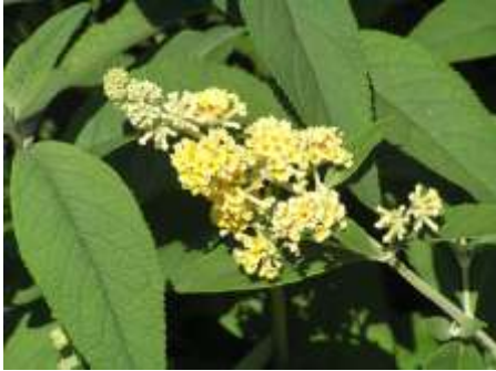
Buddleia x weyeriana

This is a large mounding shrub with bright green leaves and honey yellow flowers all summer long. Works well as a cut flower and smells really good!