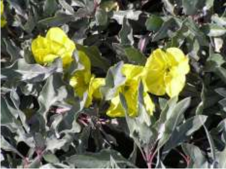
Oenothera macrocarpa "Silver Blade" Primrose

This is a low growing perennial with silvery leaf blades and bright yellow flowers that bloom in summer.