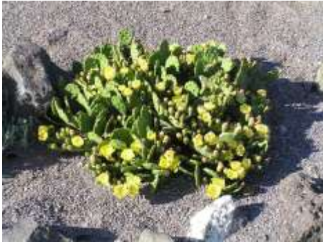
Opuntia humifusa Smooth Prickly Pear

This is a mound forming cacti with large bright green pads and very few spines. The flowers are bright yellow that blooms a little later than most varieties. They need protected area or a light cover to keep it looking good during winter.