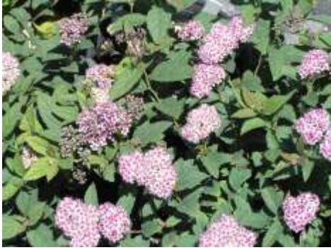
Spirea japonica 'Froebeli' Froebel Spirea

This is a low growing mounding shrub with clusters of reddish-pink flowers in late spring. They have purplish fall color.