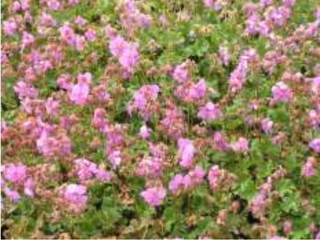
Geranium pink Pink Cranesbill

This is a mound forming perennial with dark green leaves and pink flowers in mid spring.