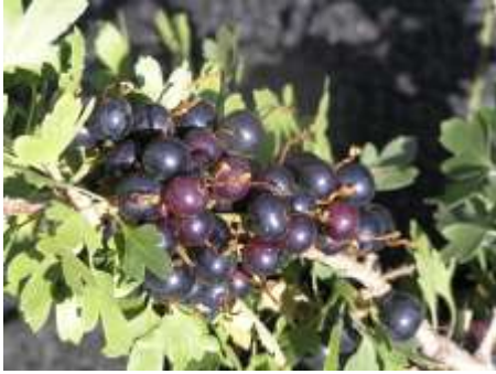
Ribes odoratum 'Crandall' Clove Currant

This is an upright shrub with fragrant yellow flowers that smell like cloves in spring and followed with delicious black fruit.