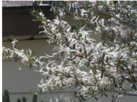
Curleaf Mt. Mahogany