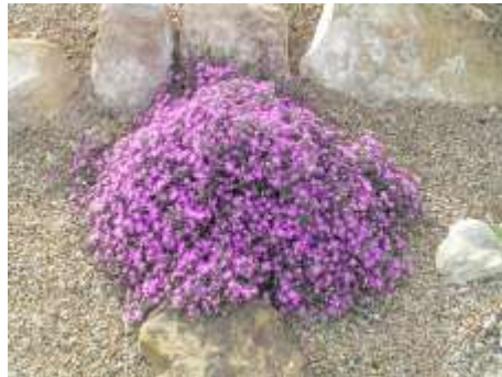
Shrubby Ice Plant