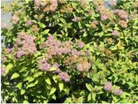
Spirea x bumalda 'Goldflame' Goldflame Spirea

This mounding shrub has bright gold foliage in spring, then turns to yellow in summer and has bright pink flowers. They have very nice fall color.