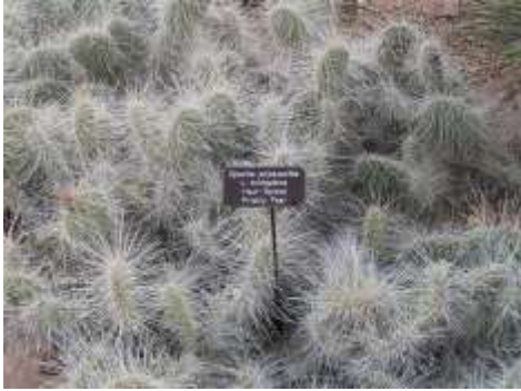
Opuntia polyacantha v. tricophora Hair-Spined Prickly Pear

It has medium sized pads and clear yellow flowers in spring. Our selection comes from southeastern Utah.