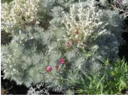
Artemisia schmidtiana Silver Mound

This is a low growing mound forming perennial with fragrant finely cut silver leaves.