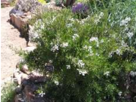
Fendlera rupicola Cliff Fendler Bush

This is an upright airy shrub with small glossy leaves and fragrant four-petaled white flowers in June. It has reddish bark exfoliates to gray as it matures.