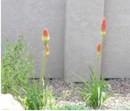
Kniphofia uvaria 'Pfitzeri' Red Hot Poker

Dense spike like leaves with large red/yellow flower spike.