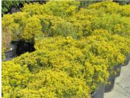
Broom Snake Weed