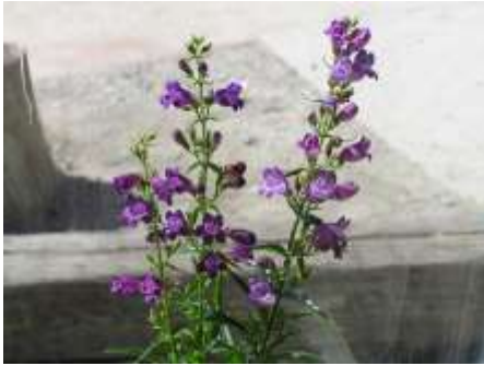
Penstemon x mexicali Pikes Peak Purple

This is a low growing perennial with dark green leaves and vivid purple flowers. Great for attracting Humming Birds. Blooms all summer.