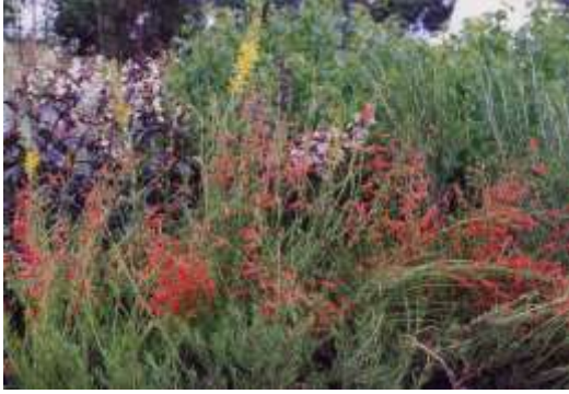
Penstemon pinifolius Pine Leaf Penstemon

This is a spreading evergreen perennial covered in bright red flowers all summer long. Great for attracting humming birds.