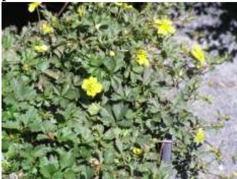
Potentilla verna Creeping Potentilla

This is a vigorous spreading ground cover with bright yellow flowers throughout the summer. It works well in paths.