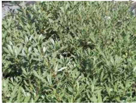
Prunus besseyi 'Pawnee Buttes'