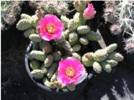
Opuntia debreczyi v. denuda Potato Cactus

This is a low growing ground covering cactus with few spines.