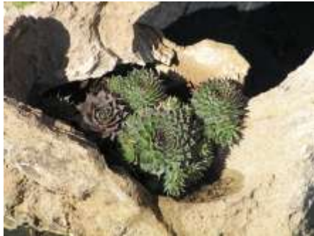
Hens & Chicks