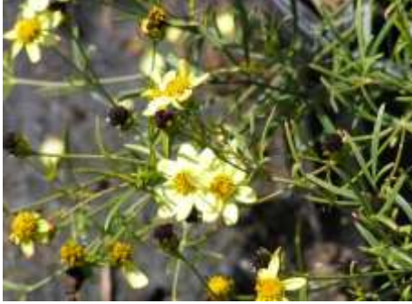
Coreopsis verticillata 'Moonbeam'

This is a rounded mound of bright thread like green leaves and pale yellow flowers in mid to late summer.