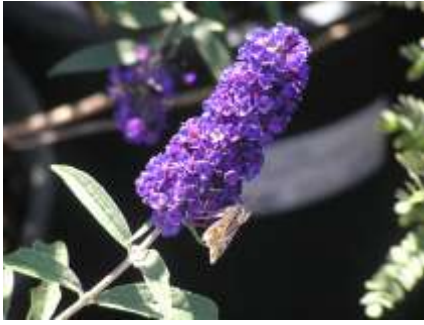
Buddleia davidii 'Black Knight'

This is a large mounding shrub with deep purple fragrant flowers in summer to fall. This shrub is great for attracting butterflies and humming birds.