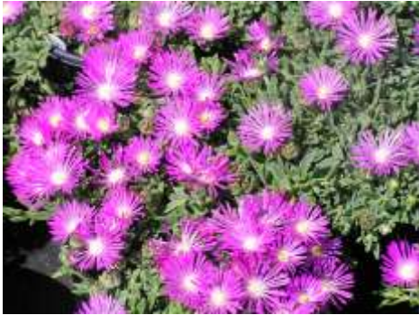
Delosperma x cooperi Table Mountain Iceplant

This is a low growing ground cover with fuchsia/white flowers. This variety is particularly vigorous and showy.