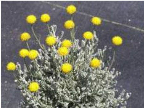
Santolina chamaecyparissus Lavender Cotton

This is an upright perennial with finely-cut silver leaves and bright yellow flowers. Works well as an accent plant.