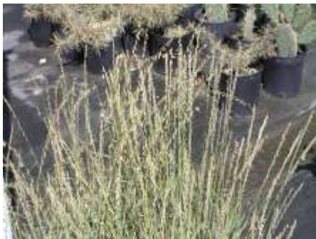
Bouteloua curtipendula Sideoats Grama

This is a great grass for meadows and reclamation. The seeds are born in two rows on one side of the flower stalk.