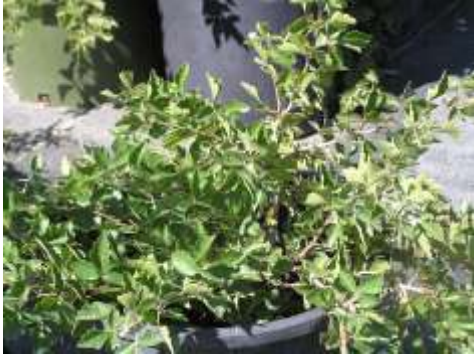
Rhus trilobata 'Autumn Amber'

This is a prostrate form of three leaf sumac. It forms a dense ground cover that will cascade over walls. This shrub has amber to brick red fall color.