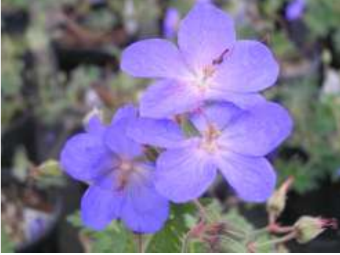
Geranium 'Johnson's Blue'

This is a large perennial with gray to green leaves and vivid blue flowers.