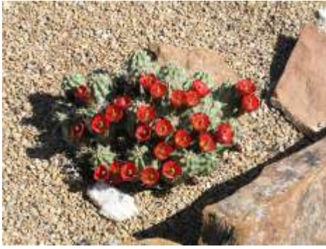
Echinocereus triglochidiatus f. inermis Spineless Claret Cup

This is a nearly spineless to spineless form of Claret Cup.