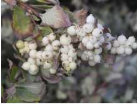
Symphoricarpos alba White Snowberry

This is an arching shrub with blue to green leaves and pink to white flowers in spring followed by white berries.