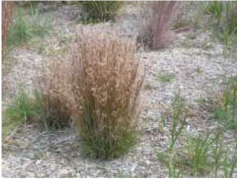
Schizachyrium scoparium 'Blaze'

This is an upright clump forming grass with light blue leaves that turn brilliant red in the fall. It tolerates poor soils.