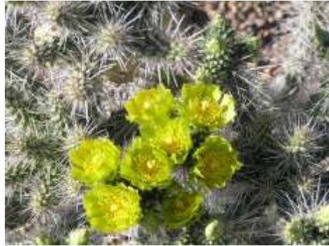
Silver Spined Cholla