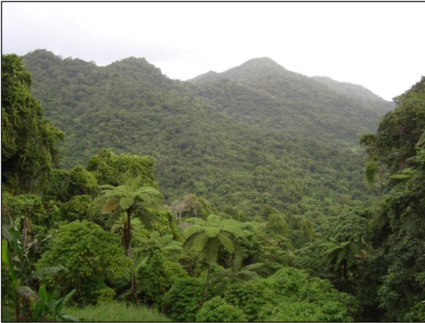
Plate 5 – The forests of the Natewa Peninsula; a major source of carbon stocks.