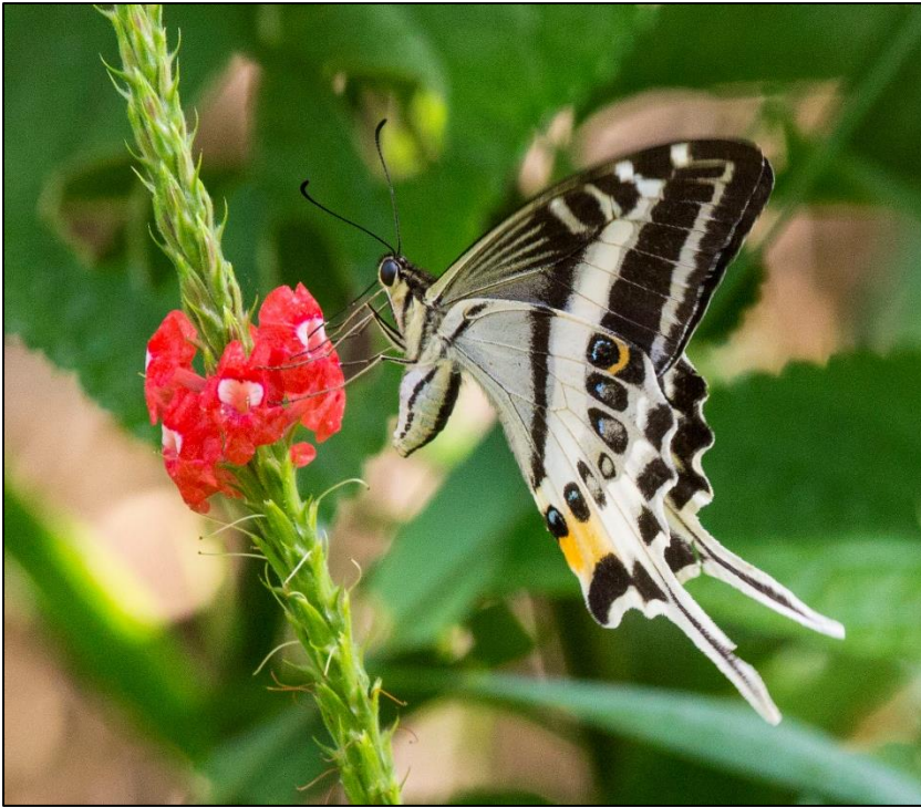
Plate 4 – Natewa Swallowtail ( Papilio natewa ) on the Natewa Peninsula.