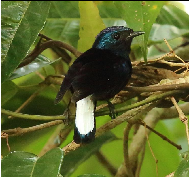
Plate 2 - Natewa Silktail ( Lamprolia klinesmithi ) in the forests of the Natewa Peninsula – the only locality where it occurs.