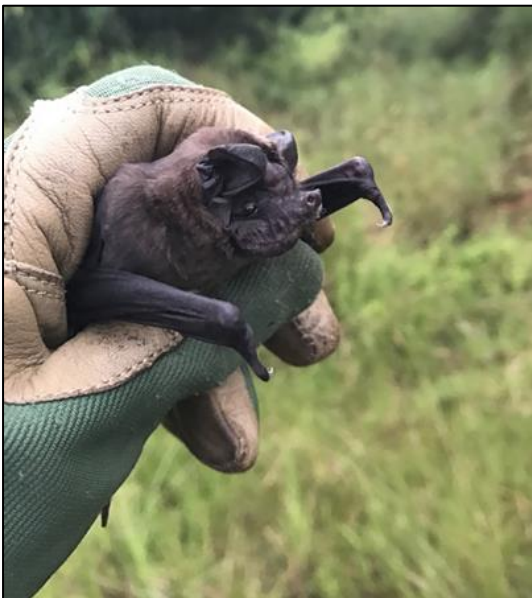
Plate 1 - Fijian Free-tailed Bat ( Chaerephon bregullae ), photographed on forest edge in the Natewa peninsula in July 2017.

study area lie between 175,000 and 400,000 individuals (Kerr 2018), and this population representing a severe risk to Natewa’s native birds, herpetofauna, and in likelihood other taxa. Controlling this mongoose population thus, in likelihood, represents the single most pressing conservation priority for the Natewa peninsula. A detailed study plan has been submitted which aims to achieve this objective, using a combination of intensive trapping for extant Mongooses in Natewa, and the construction of a 400m fence across the base of the Peninsula to prevent further colonization by this highly invasive species (Kerr 2018) (Figure 1c).