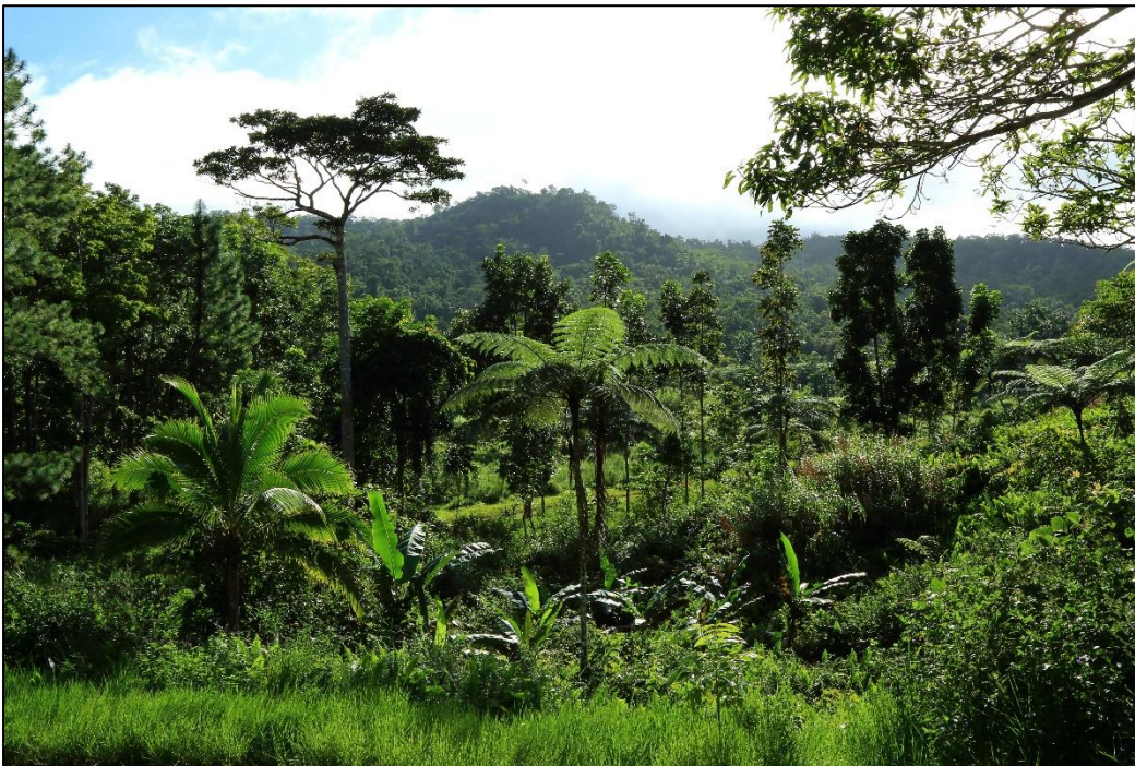
Plate 6 – The Natewa Peninsula

assessments of carbon stocks than has been possible to date. However, while further work remains to be completed to refine our knowledge of the study area, the data presented in this report clearly shows the Natewa Peninsula possesses extremely high conservation value, and represents a high priority area for conservation projects aiming to protect the biodiversity of this Pacific island nation.