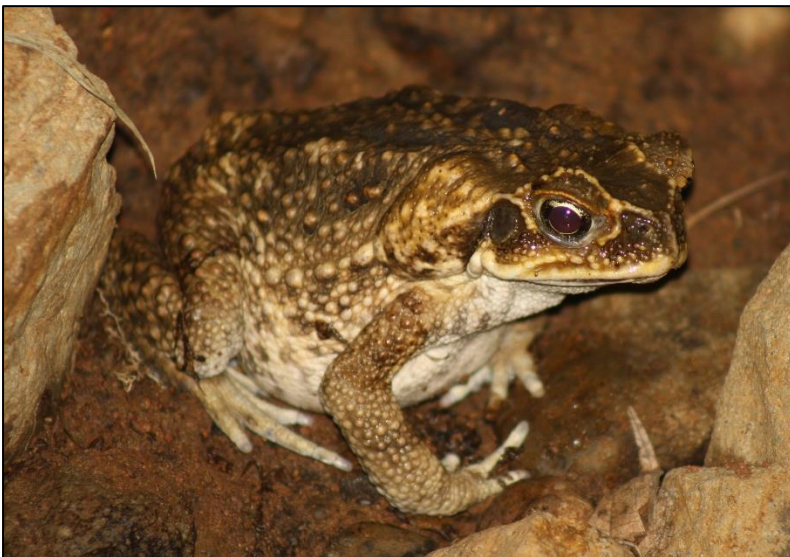
Plate 3 – Cane Toad ( Rhinella marina ) on the Natewa Peninsula.

A final observation of note regarding the herpetofauna of the Natewa Peninsula relates to the absence, rather than presence of a species; the endangered Fiji Banded Iguana ( Brachylophus fasciatus ). This iconic Fijian species does occur in parts of Vanua Levu, but does not appear to occur in the study area, despite the presence of large tracts of suitable forest habitat. It may be that the species has never colonized the peninsula due to its biogeographical isolation, but it may also be the case that it has been extirpated due to pressure from invasive species, such as the Small Indian Mongoose.