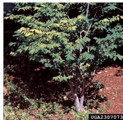
Euonymus alatus in summer.